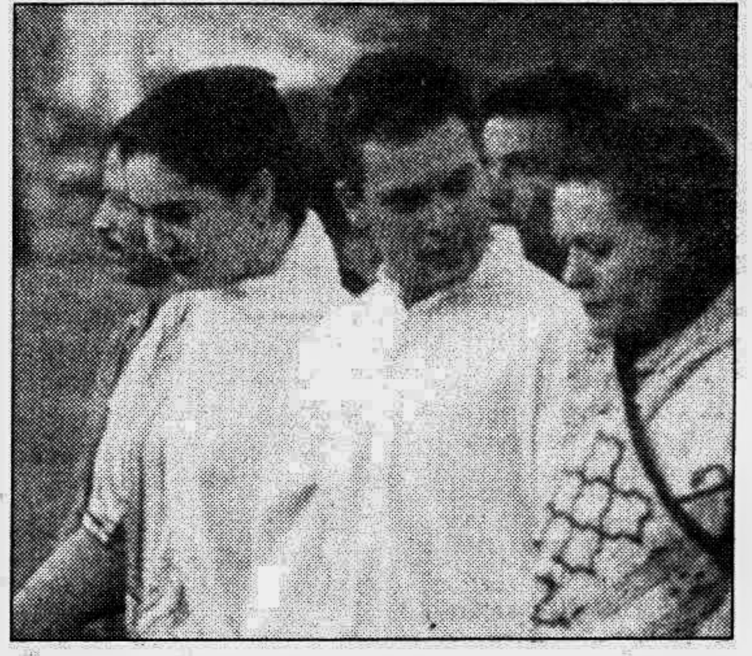
File photo of Rahul Gandhi flanked by sister Priyanka and mother Sonia Gandhi.