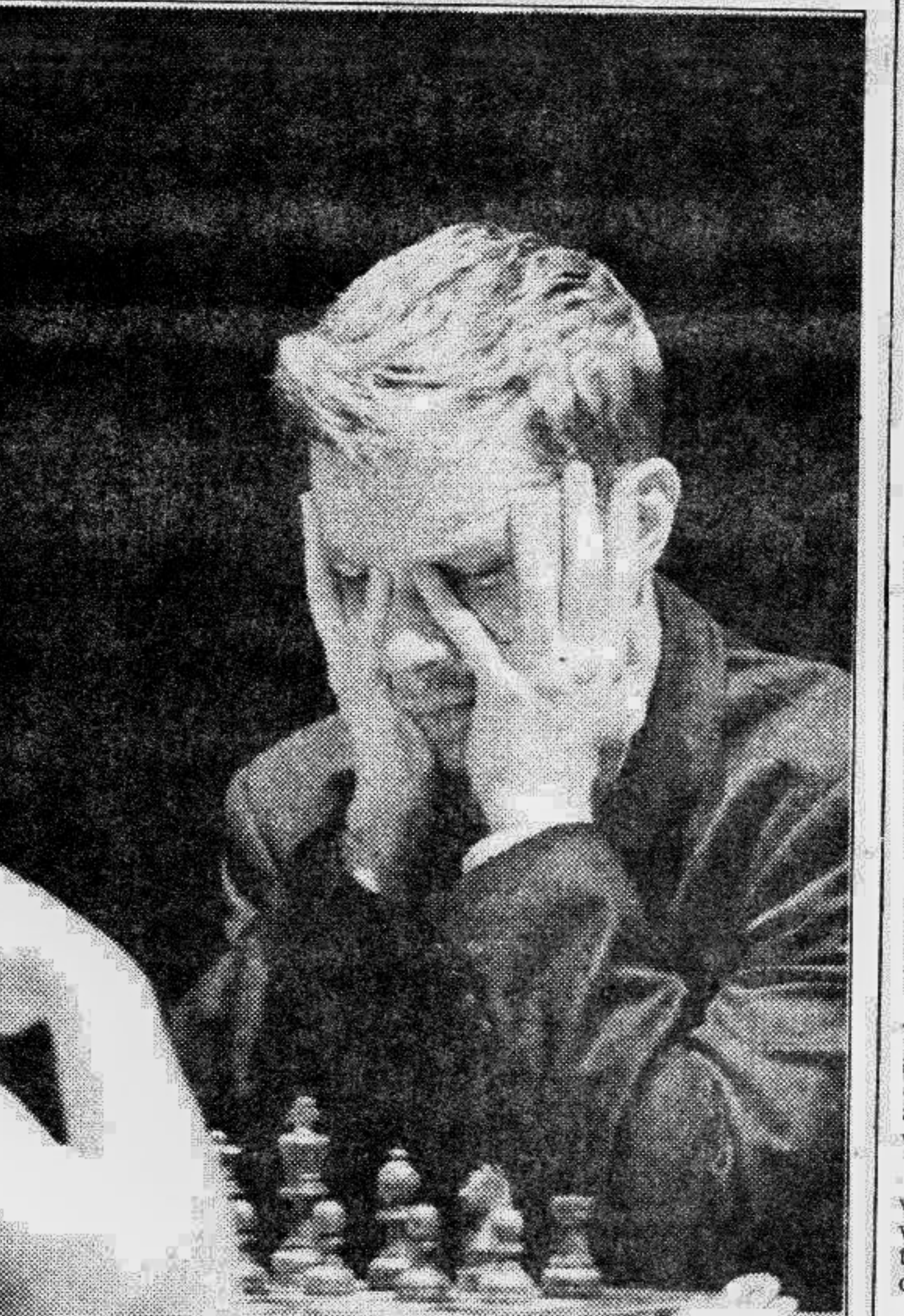
Russian Alexander Khalifman ponders his next move against Liviu-Dieter Nisipeanu of Romania in the semifinal of the World Chess Championship in Las Vegas on August 18.