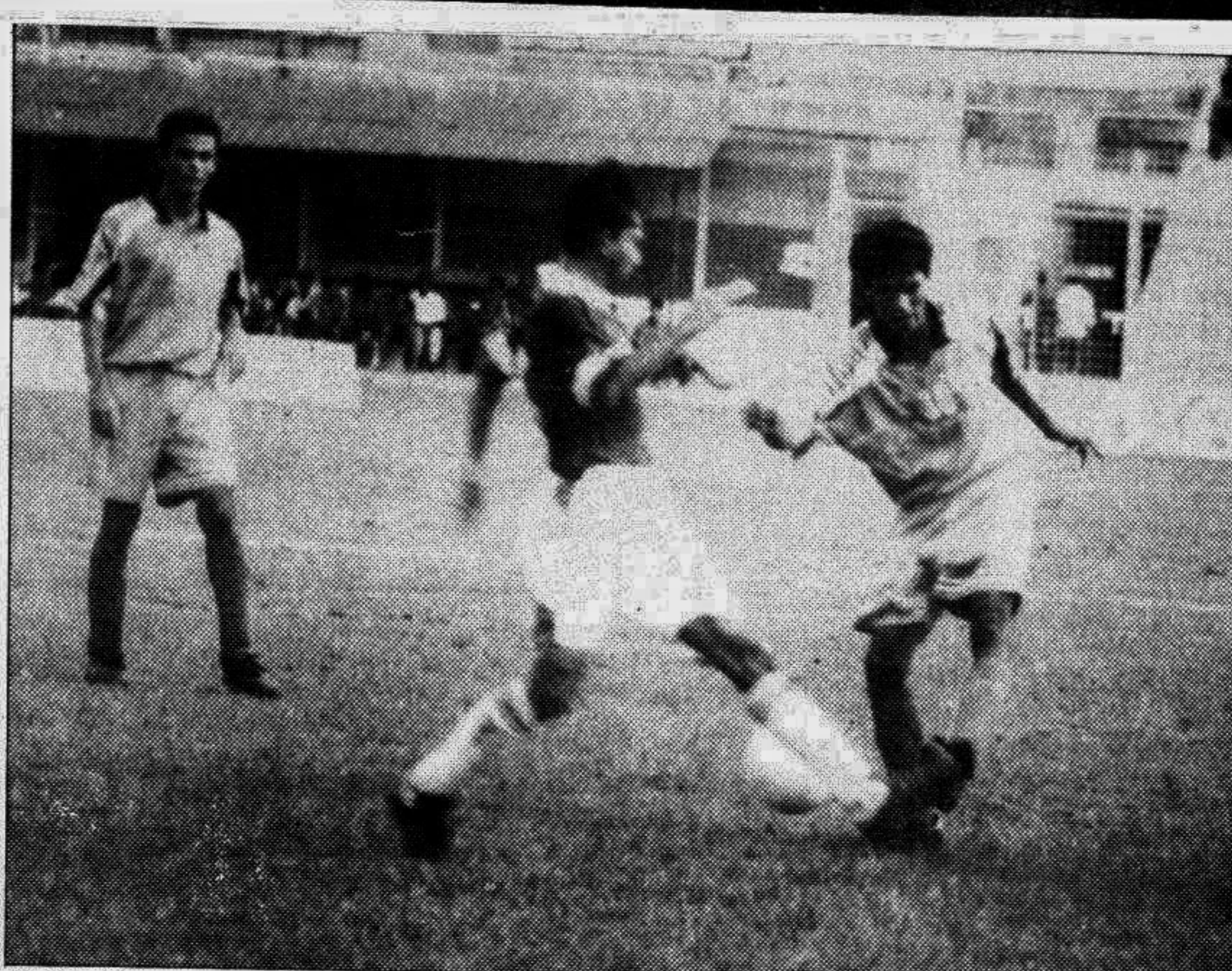
Action from yesterday's Premier Division football league match between Fakirerpool and Mirpur Chalantika at the Bangabandhu National Stadium.