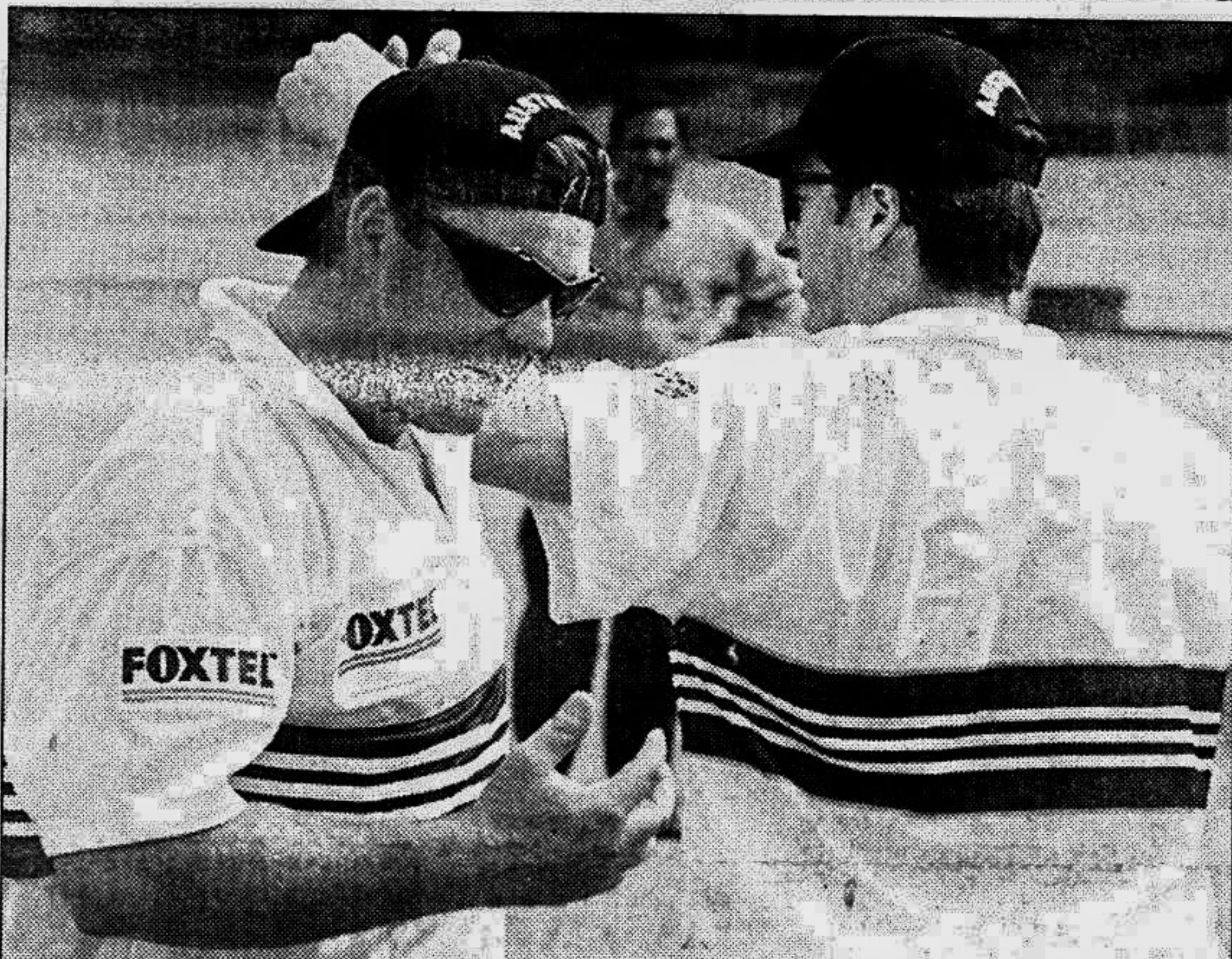
Australia's Shane Warne (L) and Steve Waugh during practice in Colombo yesterday.