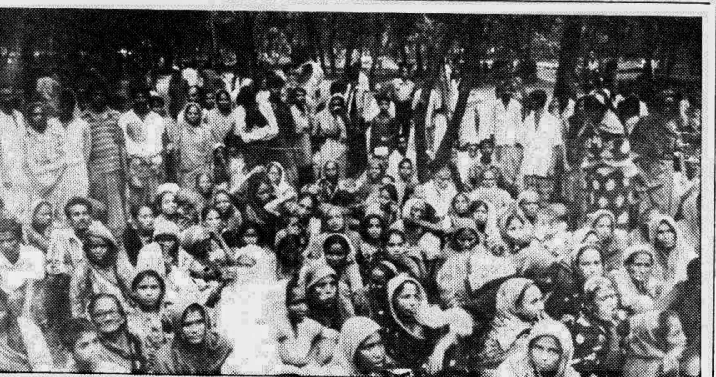
These people, claiming themselves to be evicted slum dwellers, occupied a part of the Osmany Udyan yesterday. They are organised under the banner of Bangladesh Bastuhara Samity, whose address is stated to be the same as the Awami League central office.