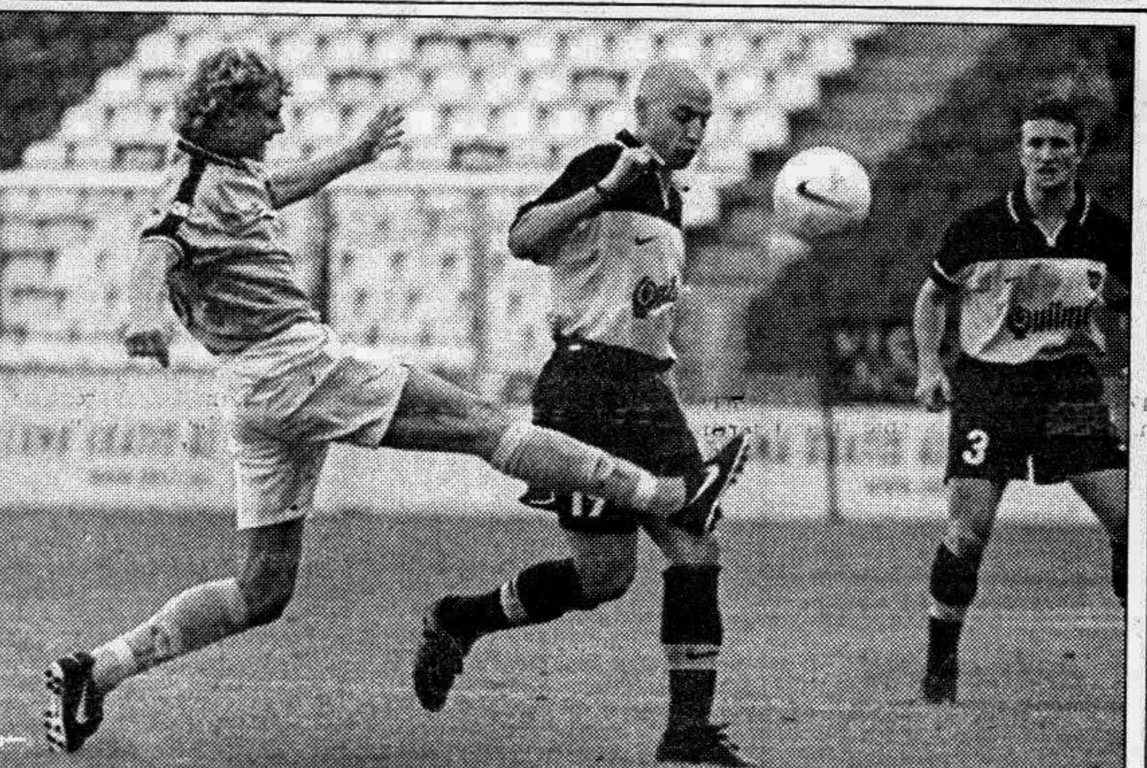
Tomas (L) of Spanish outfit Celta Vigo and Argentine side Boca Juniors' La Plagia (C) fight for possession during the final of the Teresa Herrera Cup in La Coruna, Spain on August 15.

West Ham finished strongly, though, and Sinclair sealed the draw with his opportunism. "We were so close to winning tonight - but a lapse in concentration cost us dear," said Dublin. Liverpool 2 1 0 1 2 2 3 Watford 3 1 0 2 3 5 3 Coventry 3 0 1 2 1 3 1 Derby 3 0 1 2 2 5 1 Everton 3 0 1 2 3 7 1 Sheff Wed 3 0 1 2 2 7 1 Newcastle 3 0 0 3 3 8 0