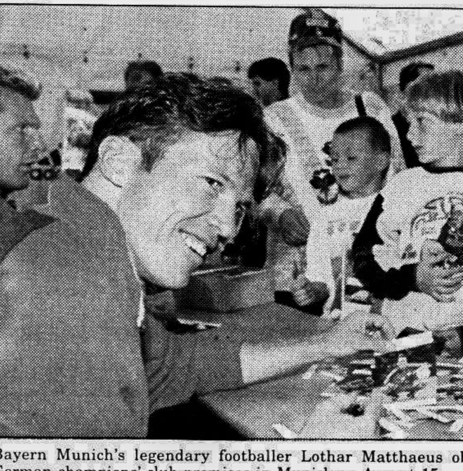
Bayern Munich's legendary footballer Lothar Matthaeus obliging his tiny fans at the German champions' club premises in Munich on August 15.

JOHANNESBURG, Aug 16 (Reuters): South Africa beat India 2-1 in the second Test of their five-match series at the Randburg Astro near Johannesburg yesterday.