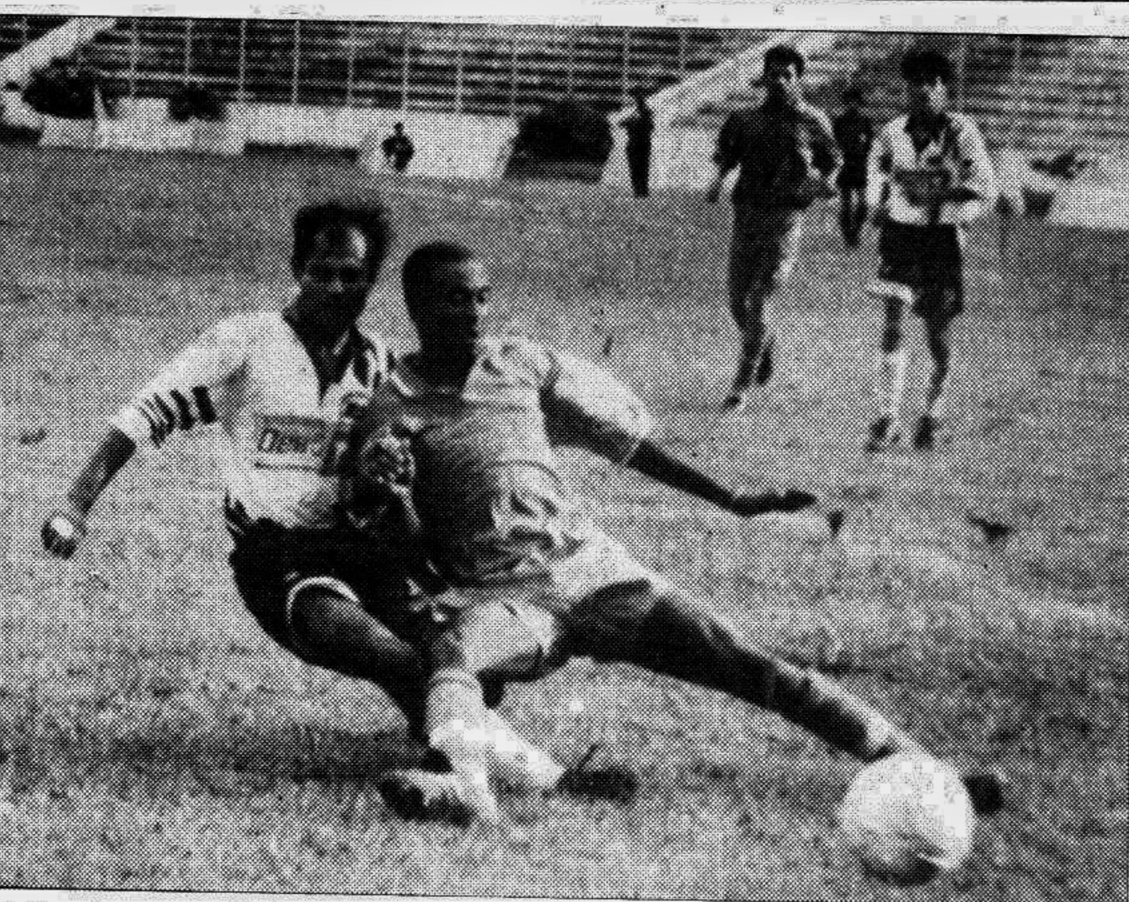
Action from yesterday's Premier Division football league match between Mukhtijoddha and Arambagh at the Bangabandhu National Stadium.