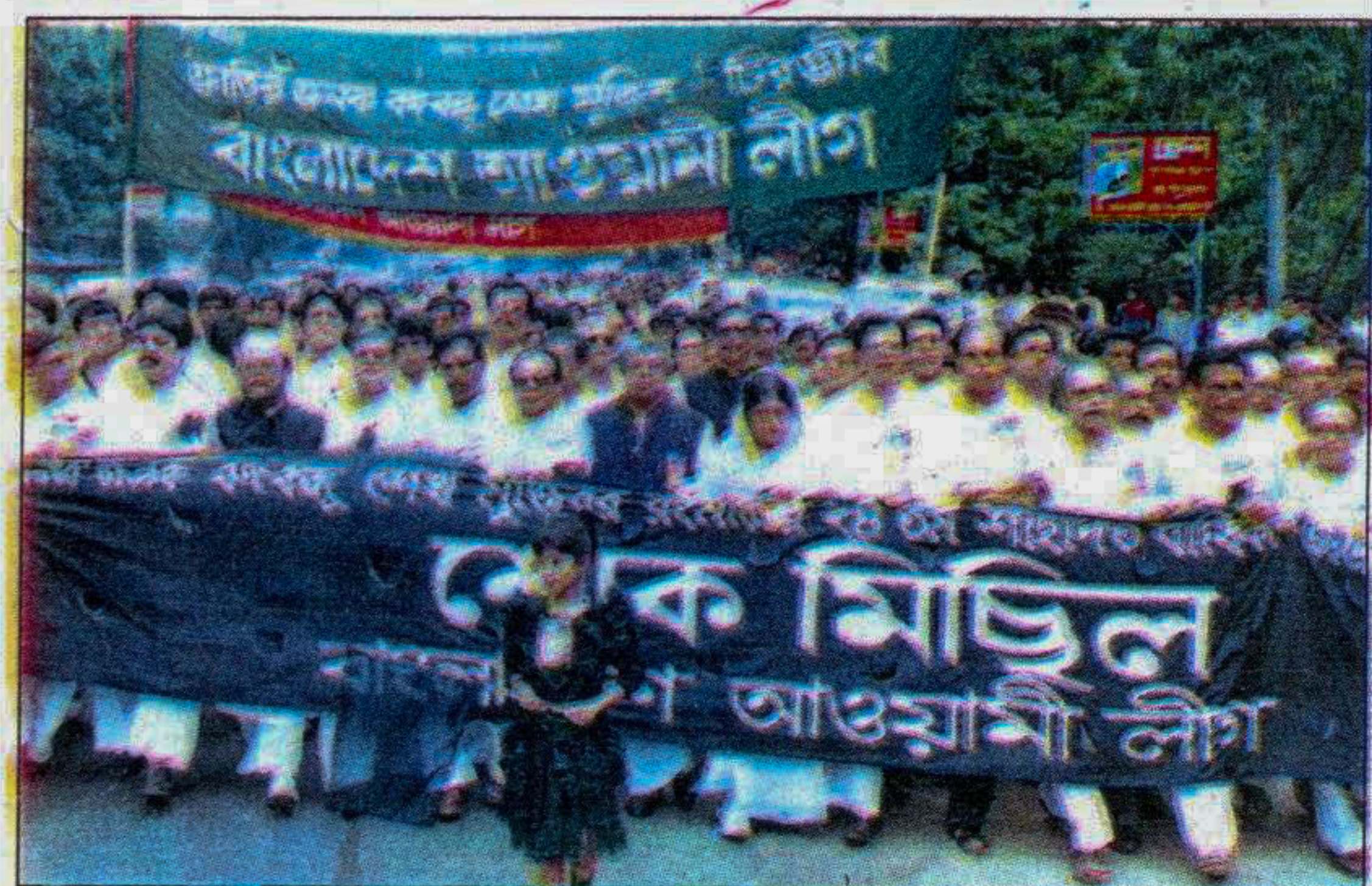
The Awami League mourning procession on August 15.