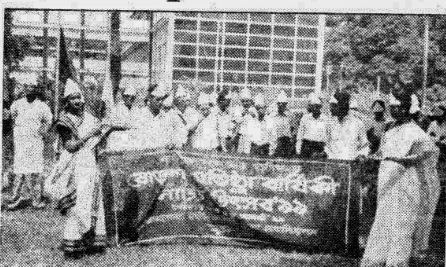
Rajshahi University Drama Association celebrated its 10th founding anniversary recently on the university campus.