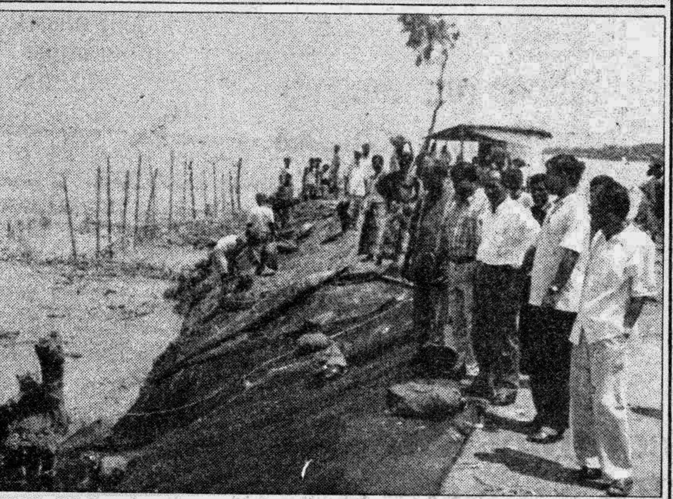
BWDB officials and staffers trying frantically to check the erosion by the River Meghna at Katakhal point of Chandpur irrigation project.

A monthly meeting of the district development and coordination committee urged the Deputy Controller of Food to move the higher authorities for procuring additional 50,000 tons of rice and 50,000 tons of paddy from the district.