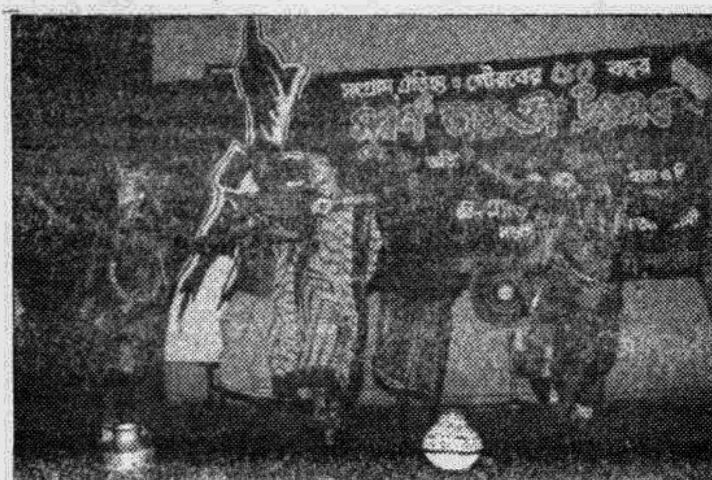
A colourful cultural programme was arranged recently at the Natore district council auditorium on the occasion of the golden jubilee of Awami League.

Official sources said North Bengal Paper Mills alone owes Tk 2 crore to PDB. They said bills totalling Tk 75 lakh remained unpaid by residential consumers. Tk 36 lakh by irrigation pumps, Tk 25 lakh by cottage industries, Tk 20 lakh by government offices, Tk 80 lakh by business establishments, Tk 8.00 lakh by Palli Biddyt and Tk 19 lakh by the municipality. Of the total unpaid bills, 50 per cent account for government and semi-government organisations, and autonomous bodies, the officials said.