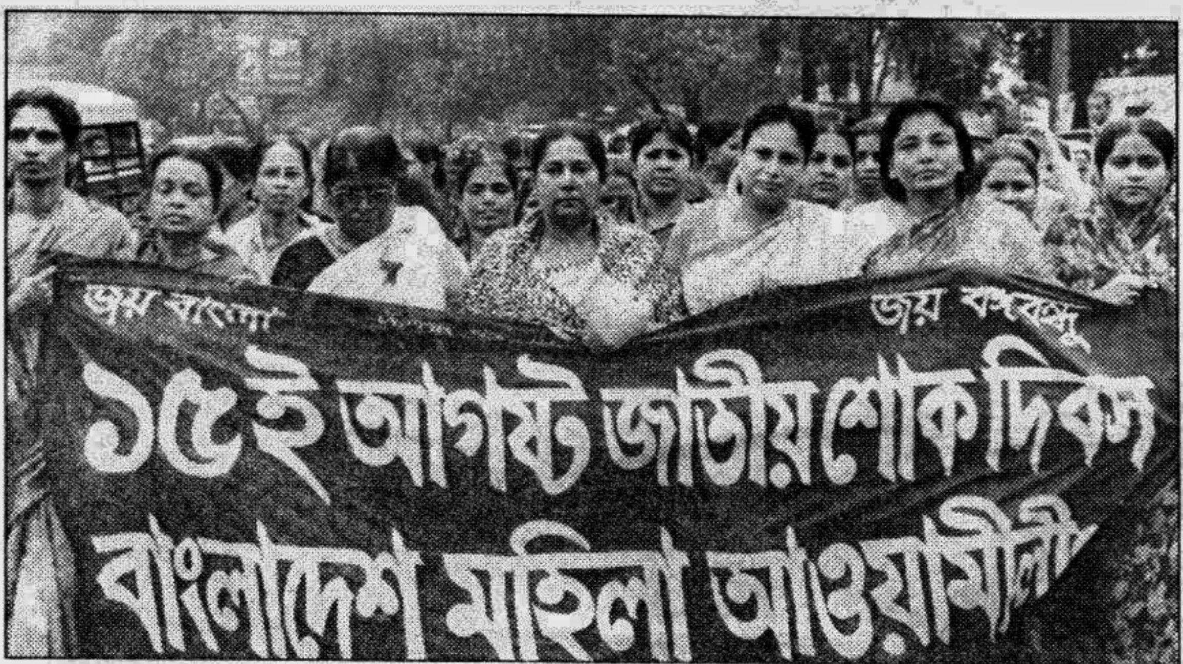
Bangladesh Mohila Awami League, the women front of the ruling Awami League, brought out a procession to mark the National Mourning Day in the city yesterday.