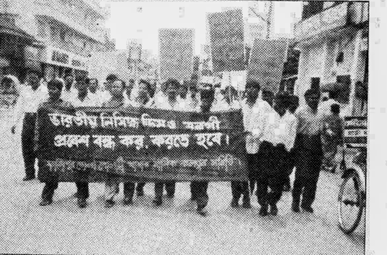
Anti-smuggling procession: Faridpur district poultry farm owners association brought out a procession in the town recently protesting rampant smuggling of Indian eggs and poultry birds.