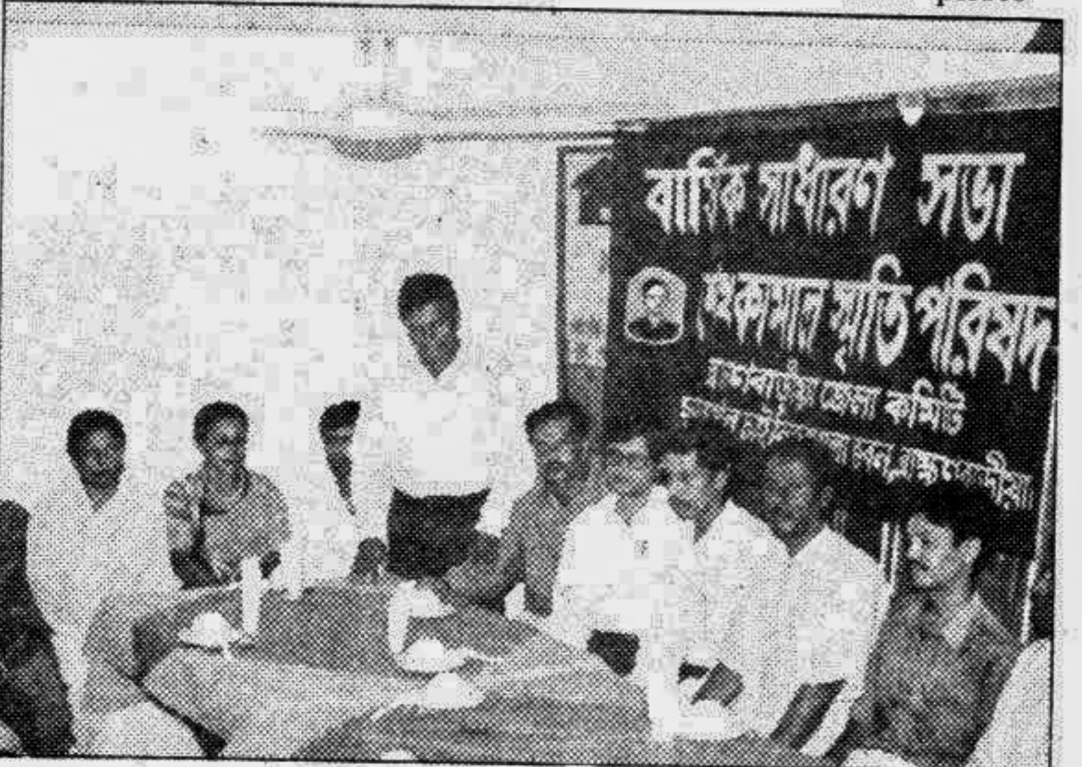
The annual general meeting of Sheikh Kamal memorial body was held recently in a Chinese restaurant in Brahmanbaria.