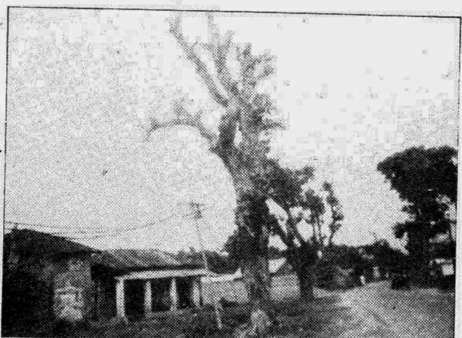
Trees are best friends: Roadside trees along Gaibandha-Palashbari highway dying alarmingly due to outbreak of unknown diseases. But there is none to take care of the trees.