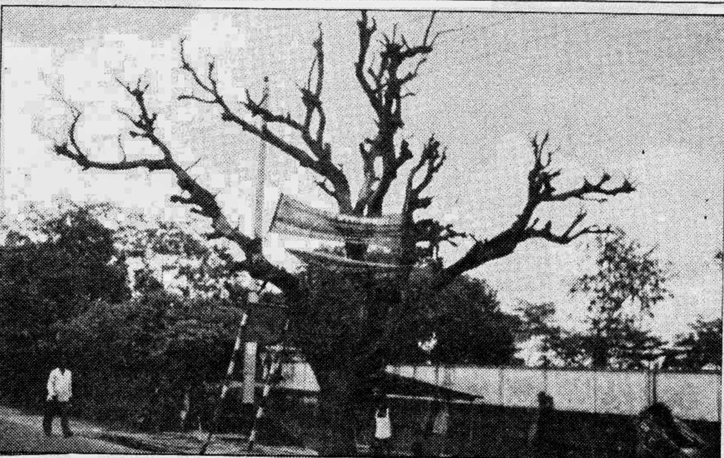
Villagers of Brahmanbaria district suffering a lot due to unabated cutting of valuable trees and outbreak of unknown diseases.

However, the PHED engineer added that it was difficult to test the water of all the tubewells in all the six thanas due to lack of necessary equipment and manpower.