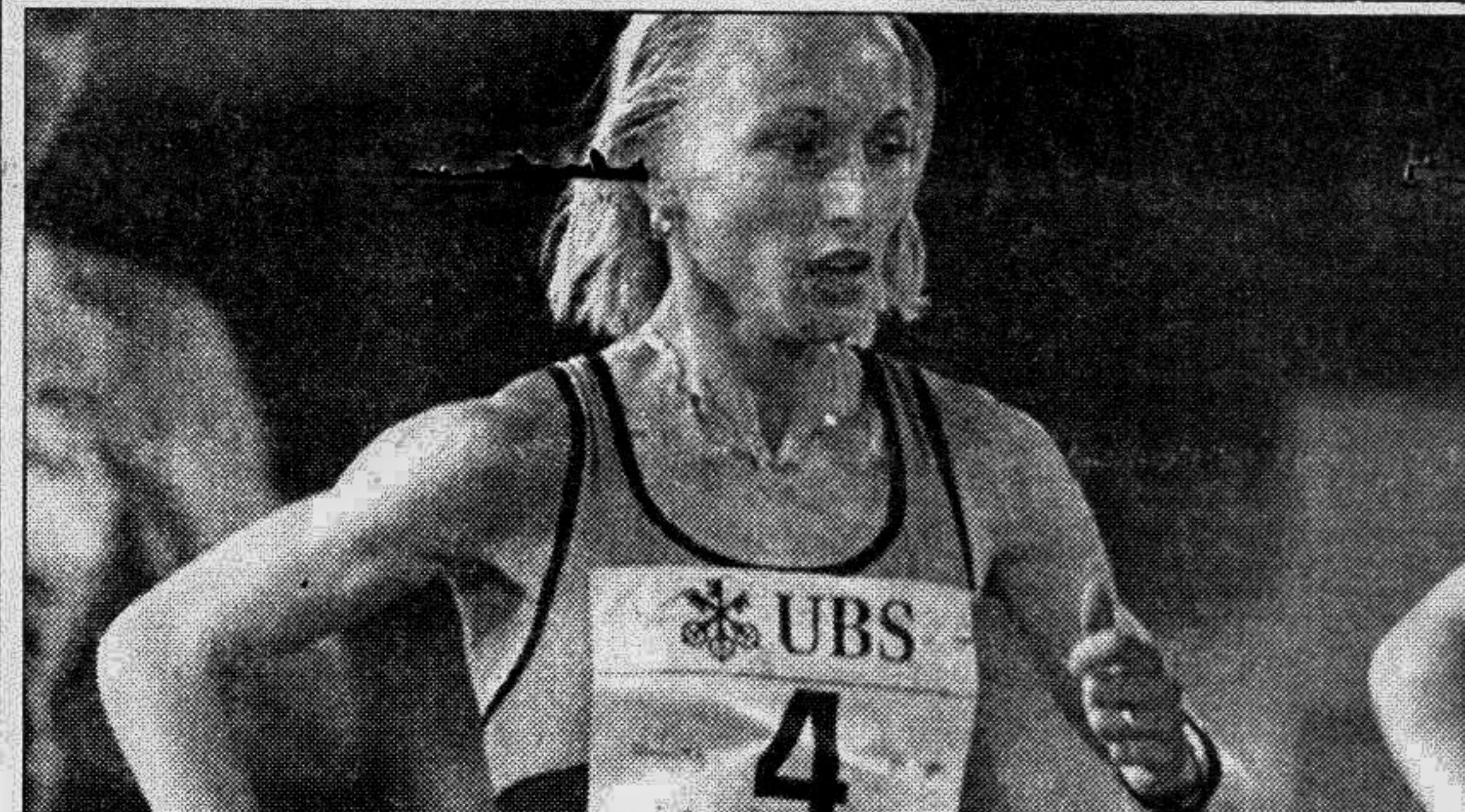
Gabriela Szabo of Romania in action during the 3000 metres steeplechase at IAAF Golden League event in Zurich on August 11.

Jim Courier retired from his second round match at 6-7 (5-7), 7-6 (7-4), 2-0 for Frenchman Cedric Pioline with heart-related cramps in his legs.