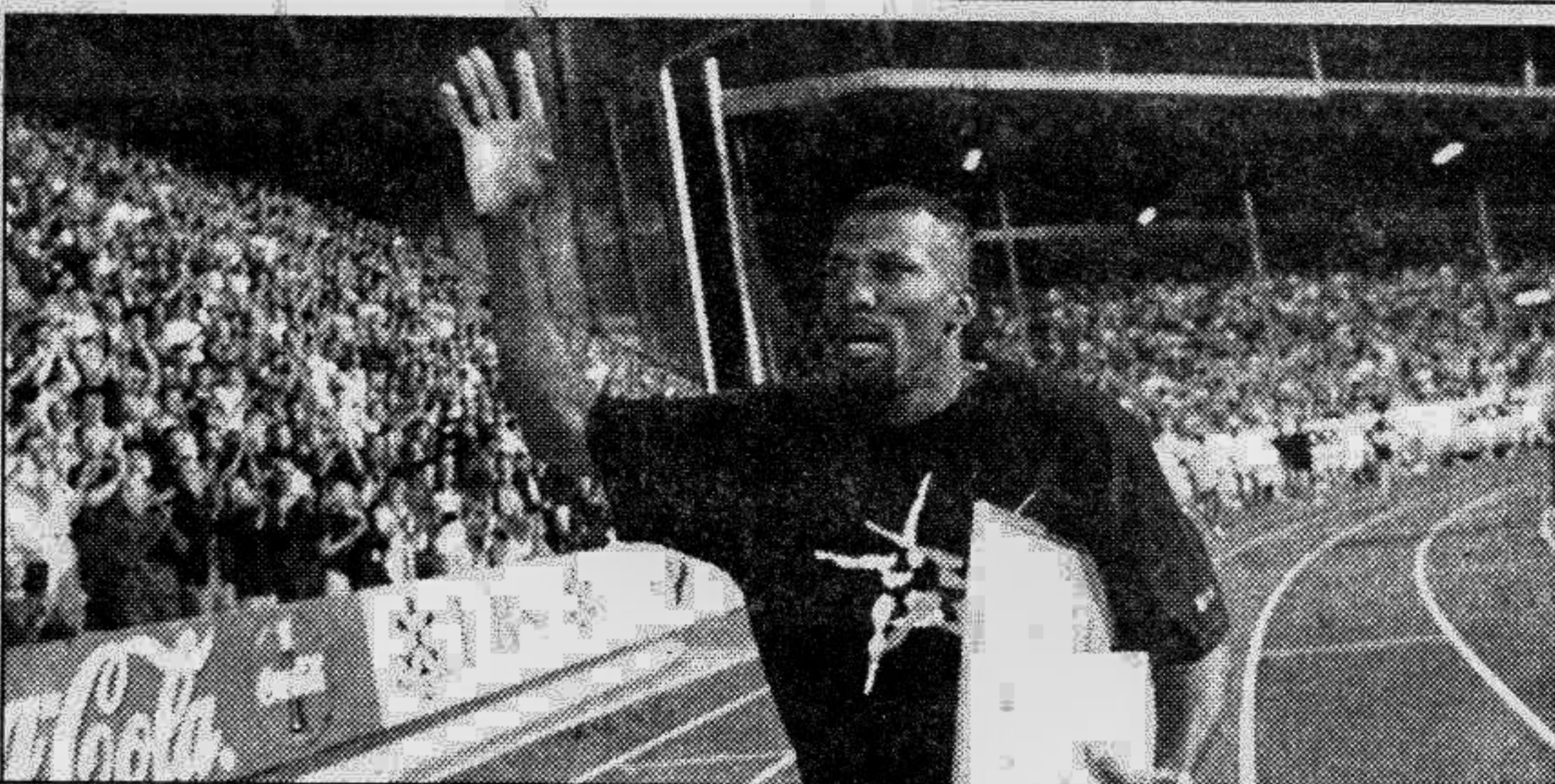
American sprinter Roger Kingdom waves goodbye to spectators in Zurich on August 11. Kingdom announced his retirement from athletics.

Ethiopia's Gebrselassie, searching for his 16th world record, also appears a sure bet to be on the podium in Seville as he stormed home first in the 5,000 metres in 12:49.64, the eighth fastest time over the distance.