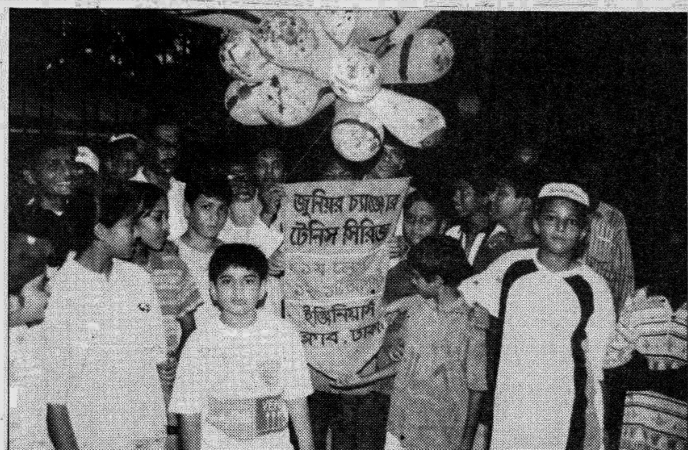
The Junior Challenger Tennis Series being inaugurated yesterday

The teams are: Abahani Krira Chakra, Confidence Club, Kheloir Kalyan Samitee, T&T Eleven, Rupatali Prantik Sangha, Amanatganj Eleven, Shaheed Muktojodha Ashis Pathagar and Club, Chandrasekhar Pathagar and Club, Friends Society and Kallol Pathagar and Club.