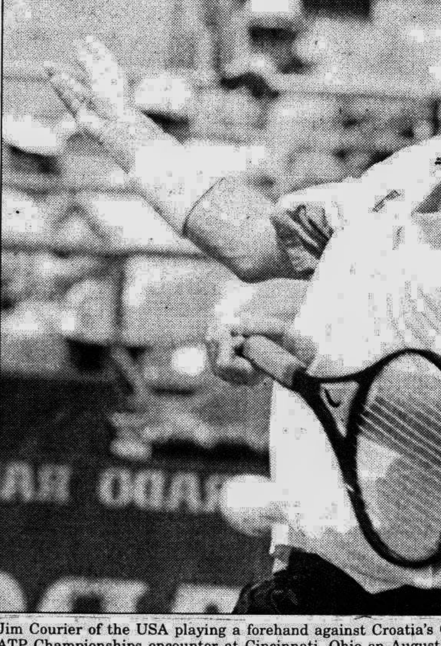
Jim Courier of the USA playing a forehand against Croatia's Goran Ivanisevic during their ATP Championships encounter at Cincinnati, Ohio on August 10. Courier won 7-6, 6-2.