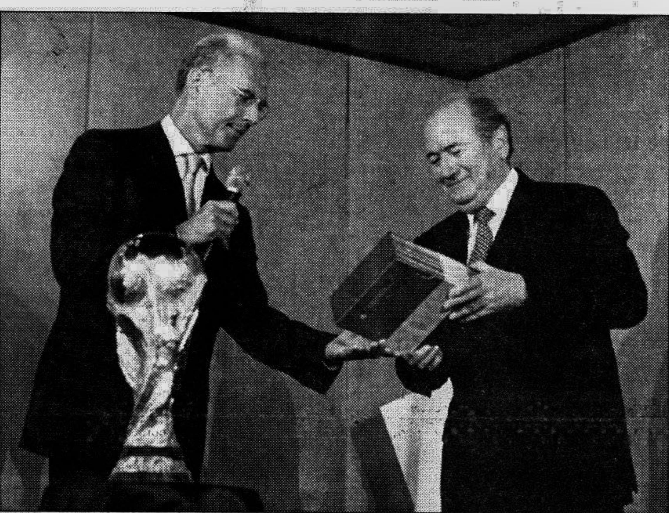
Germany's 2006 World Cup bidding committee head football legend Franz Beckenbauer (R) handing over their bid to FIFA chief Joseph Blatter at Zurich on August 10.

"In any case I think the financial investors have had plenty from the gravy train."