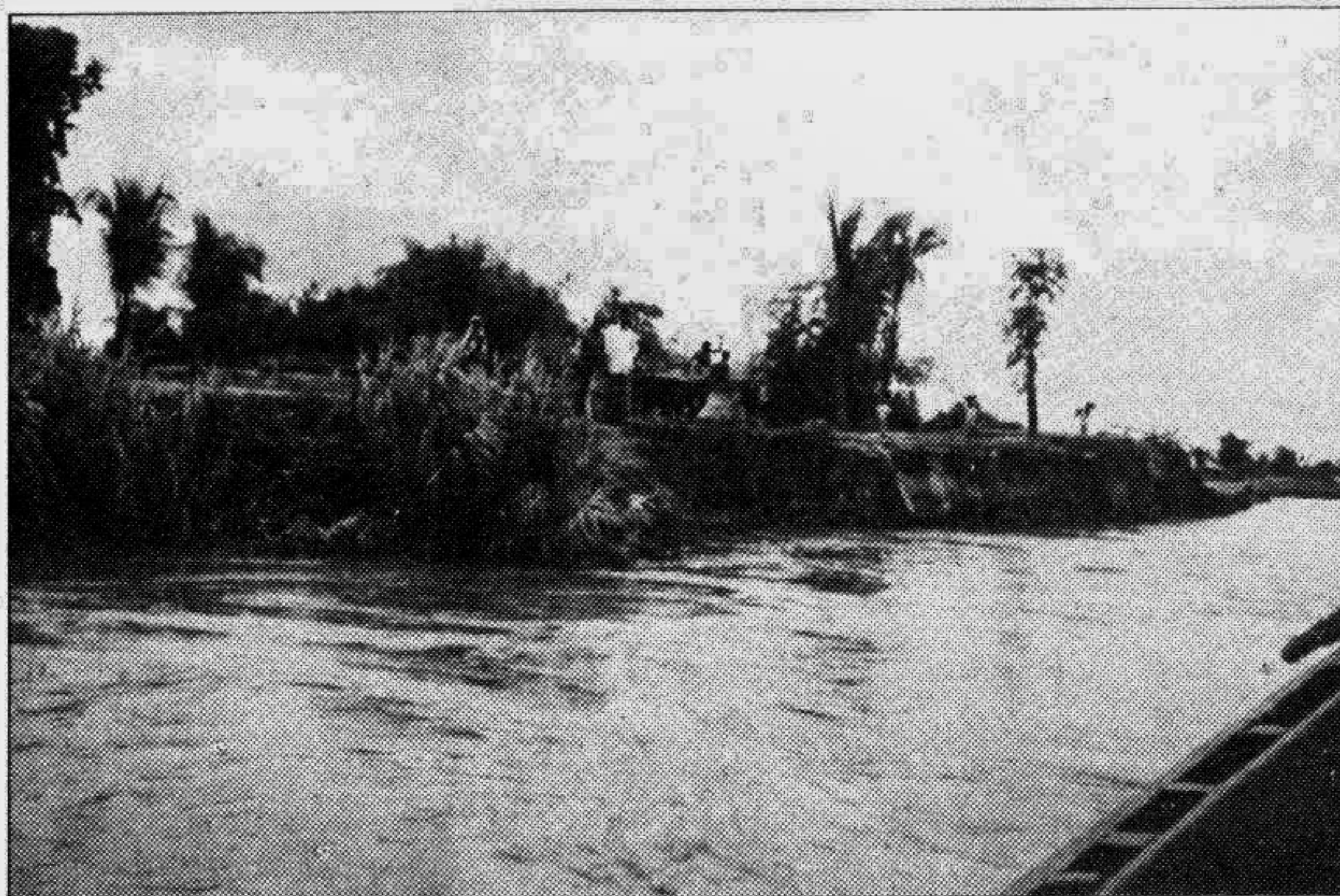
Living beside river banks: Villagers of Chakrampur in Daulatpur thana of Kushtia district shifting their belongings to safer places due to erosion by the River Padma.