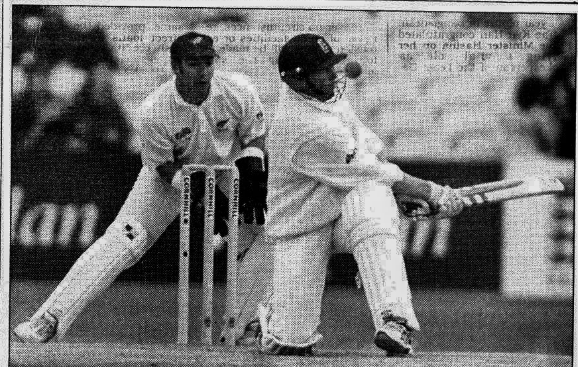
Mike Atherton, the England opener, is about to be caught off a miscued sweep on the fourth day of the third Test against New Zealand at Old Trafford on August 8.