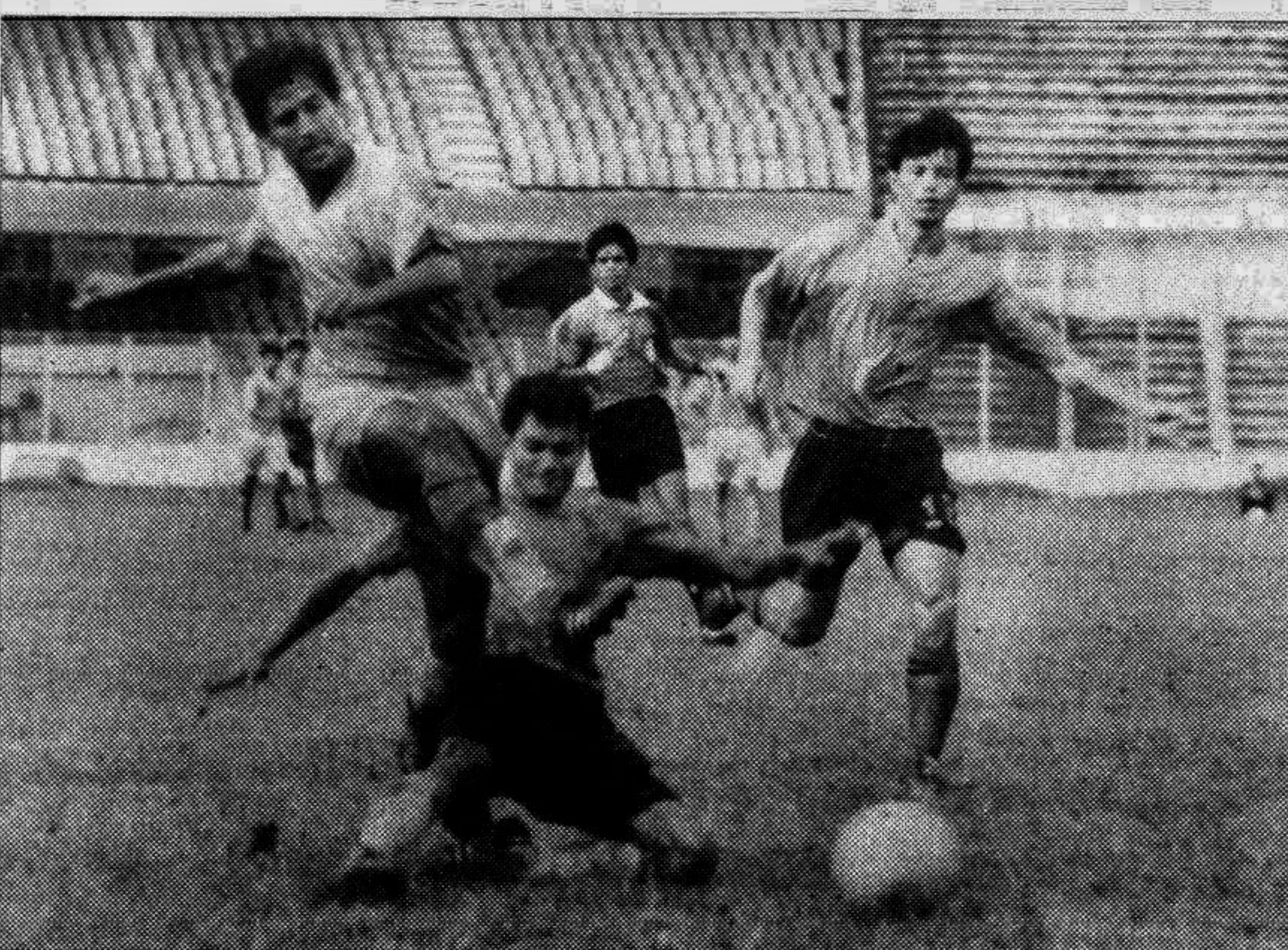
Action from the Premier Division clash between Brothers Union and Rahmatganj at the Bangabandhu National Stadium yesterday.