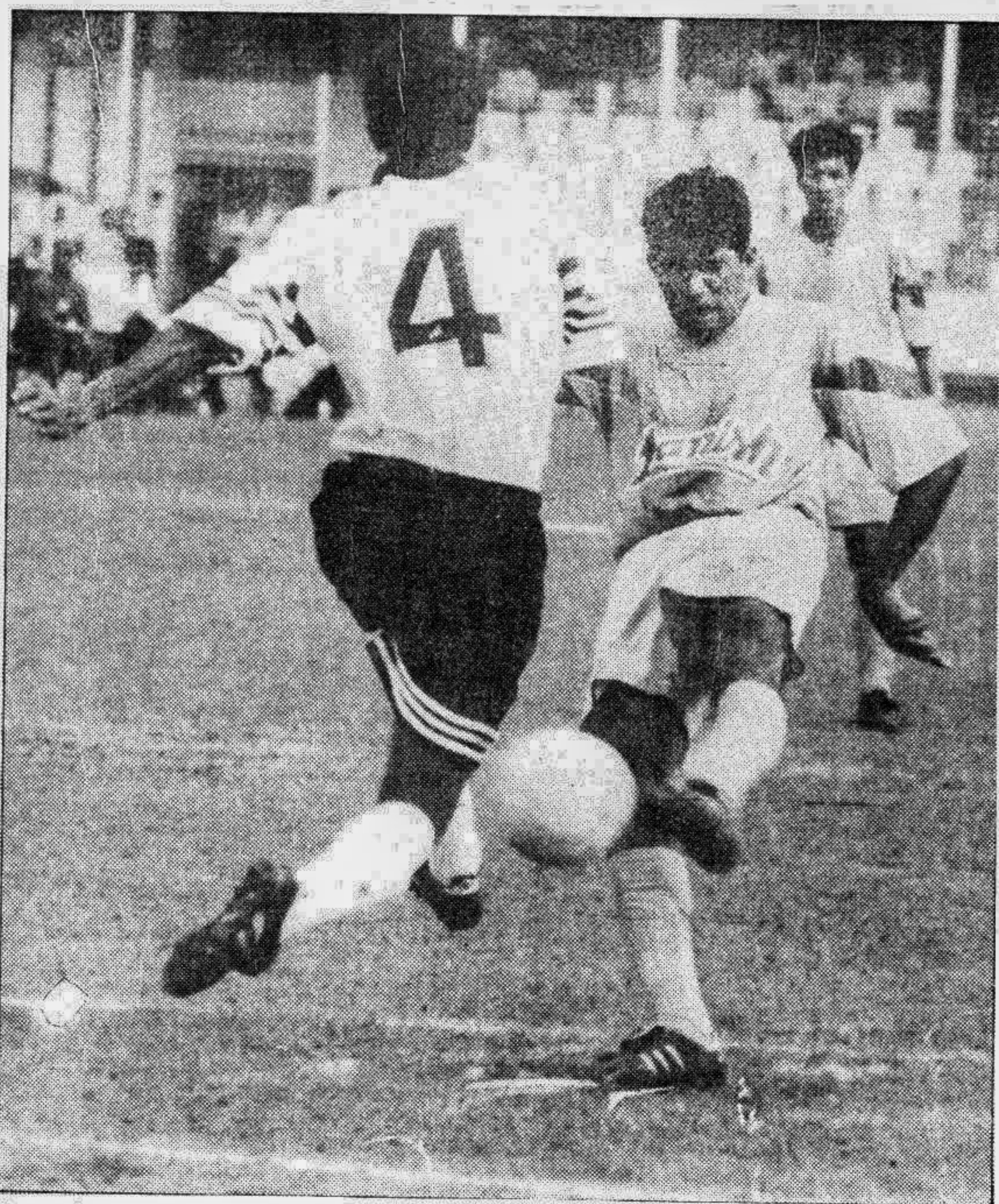
Scene from the Abahani-Arambagh Super Four match of the Premier League yesterday. Abahani won 2-0.

But England lost stand-in captain Mark Butcher in the seventh over for nine and his contribution of 86 in six innings threatens to put his place in doubt.