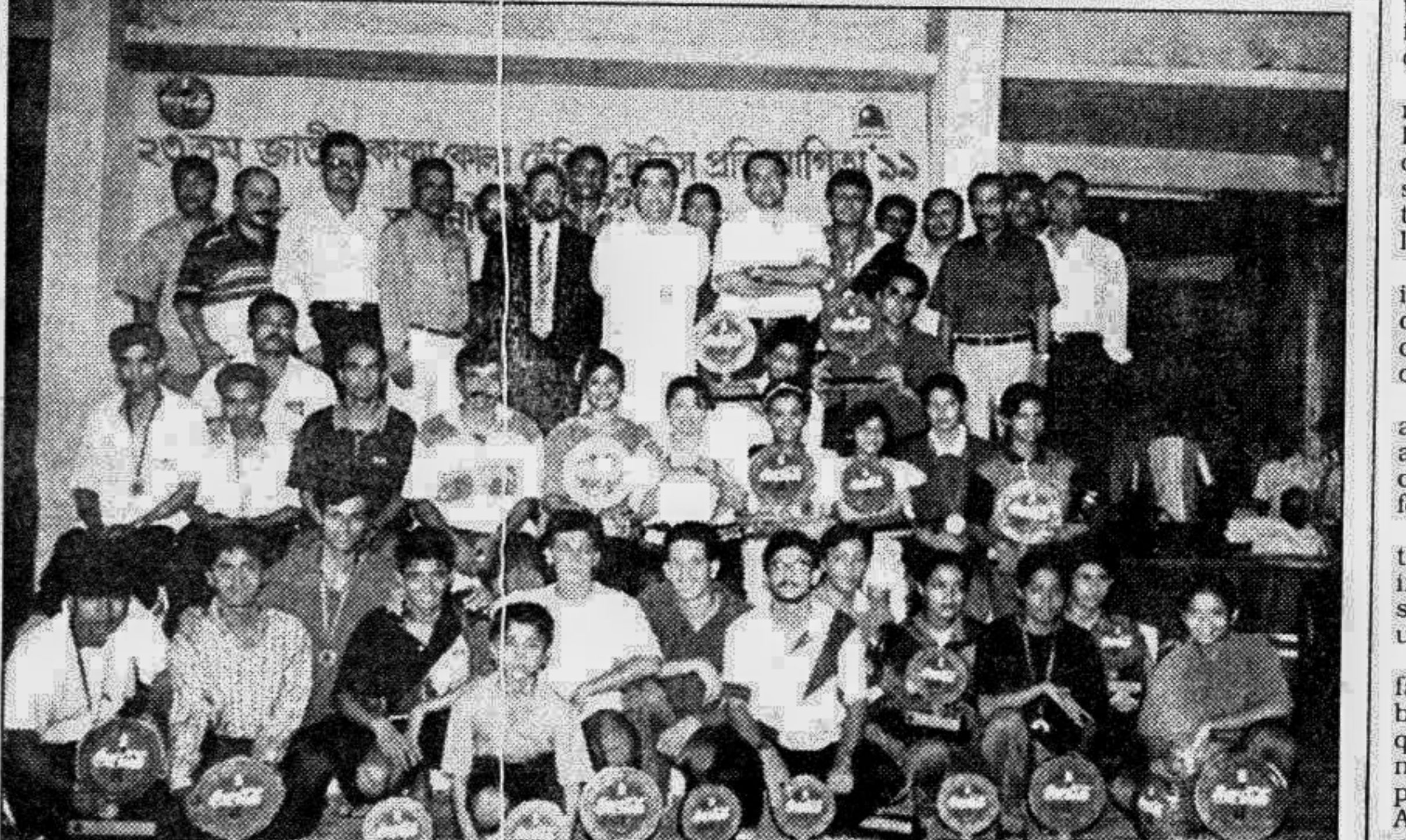
Winners of the Coca-Cola national table tennis championships.