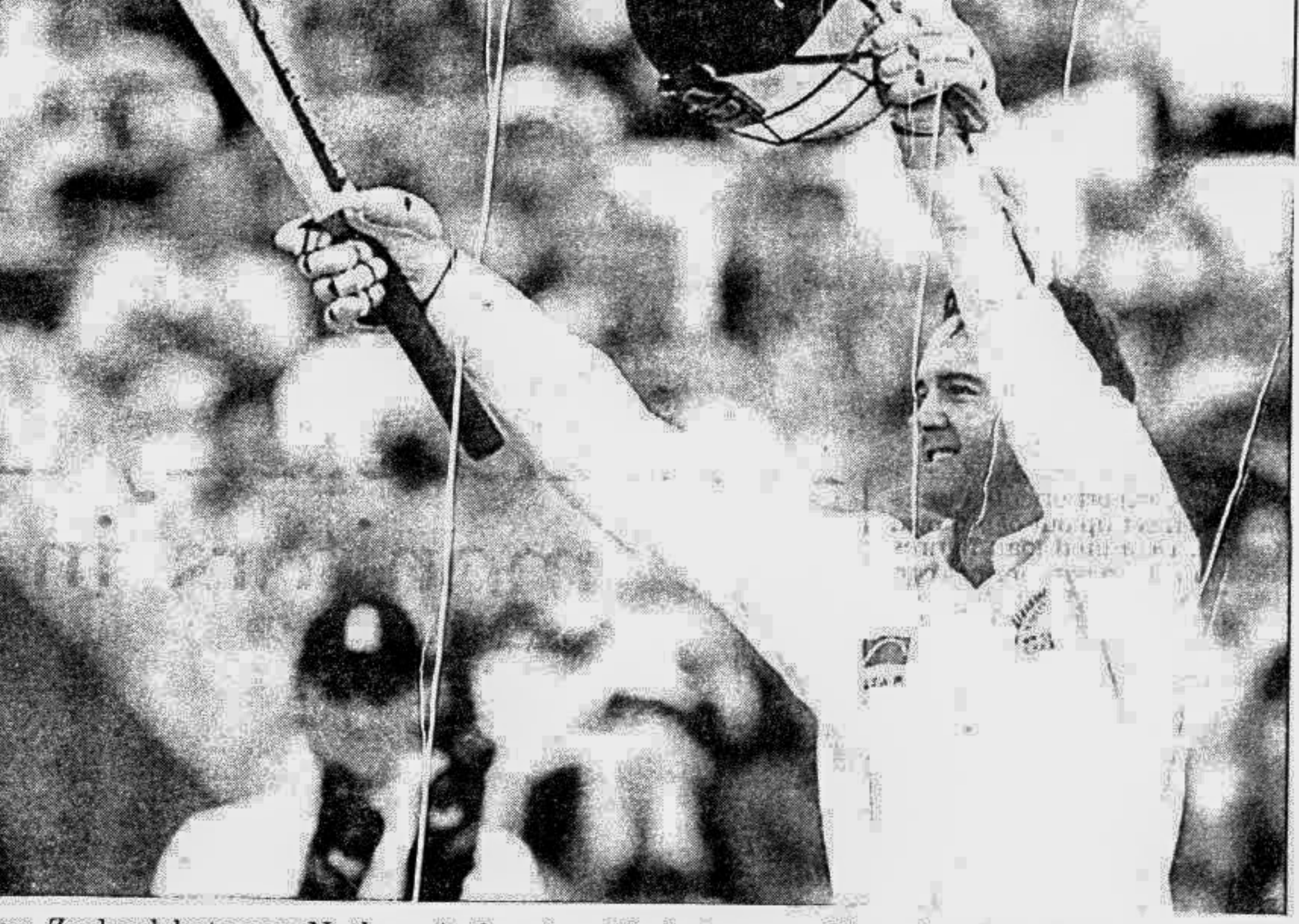
New Zealand batsman Nathan Astle raises his bat on reaching the three-figure mark at Old Trafford on August 7.

Youngsters interested in joining the academy are requested to contact: Cricket Corner at F/7/2, GM Plaza, New Elephant Road (phone 863913) or the office of Orient Club.