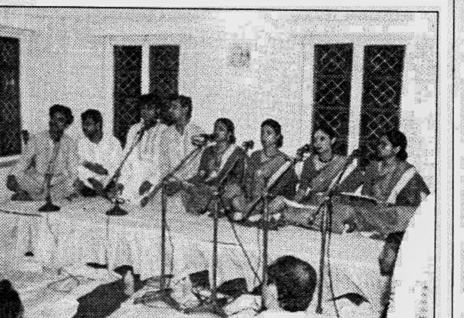
School of Communication held a cultural function recently at its office.