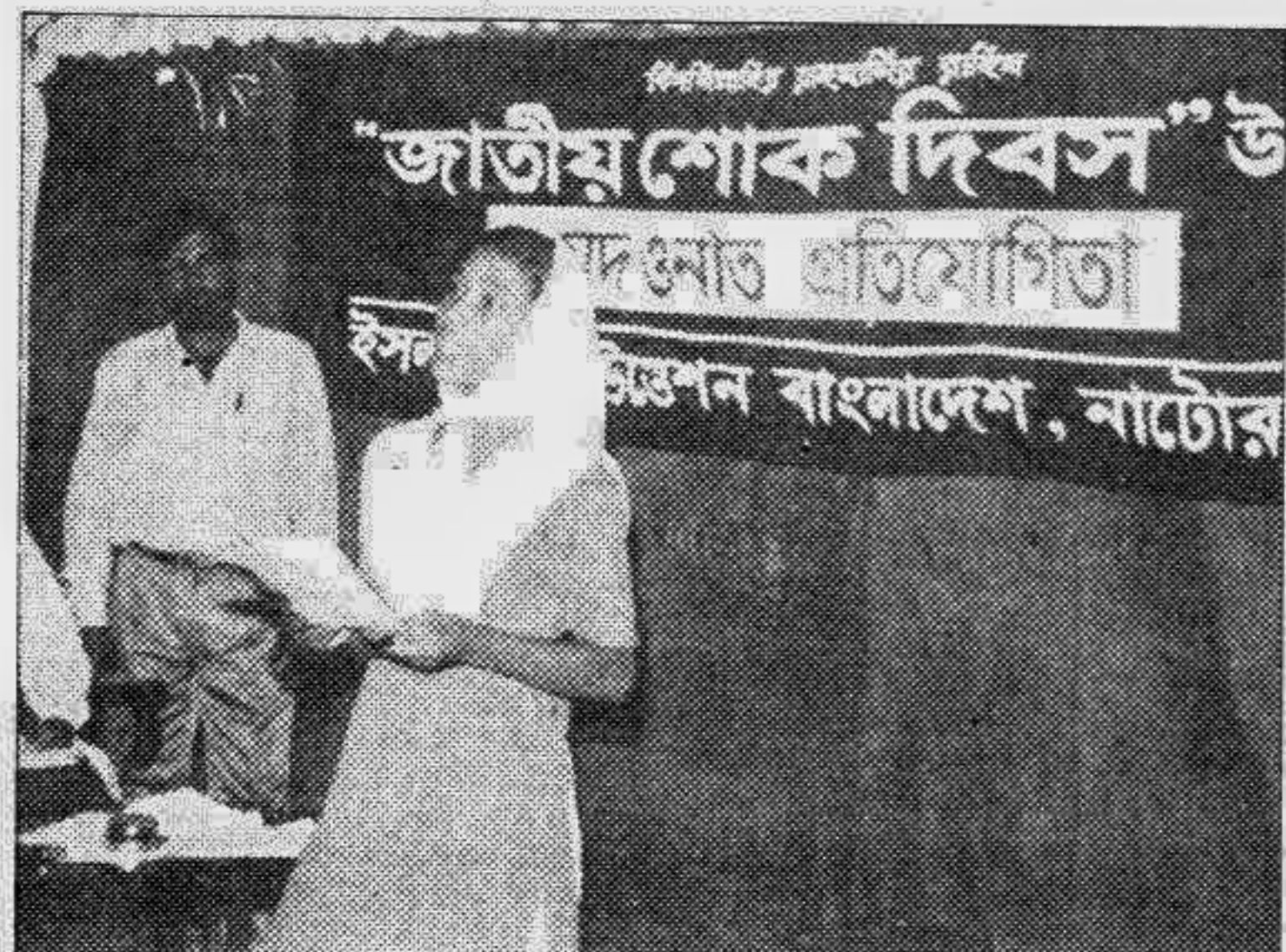
Mourning: A session of H'amd and Naat arranged by the Natore unit of Islamic Foundation on the occasion of national mourning.