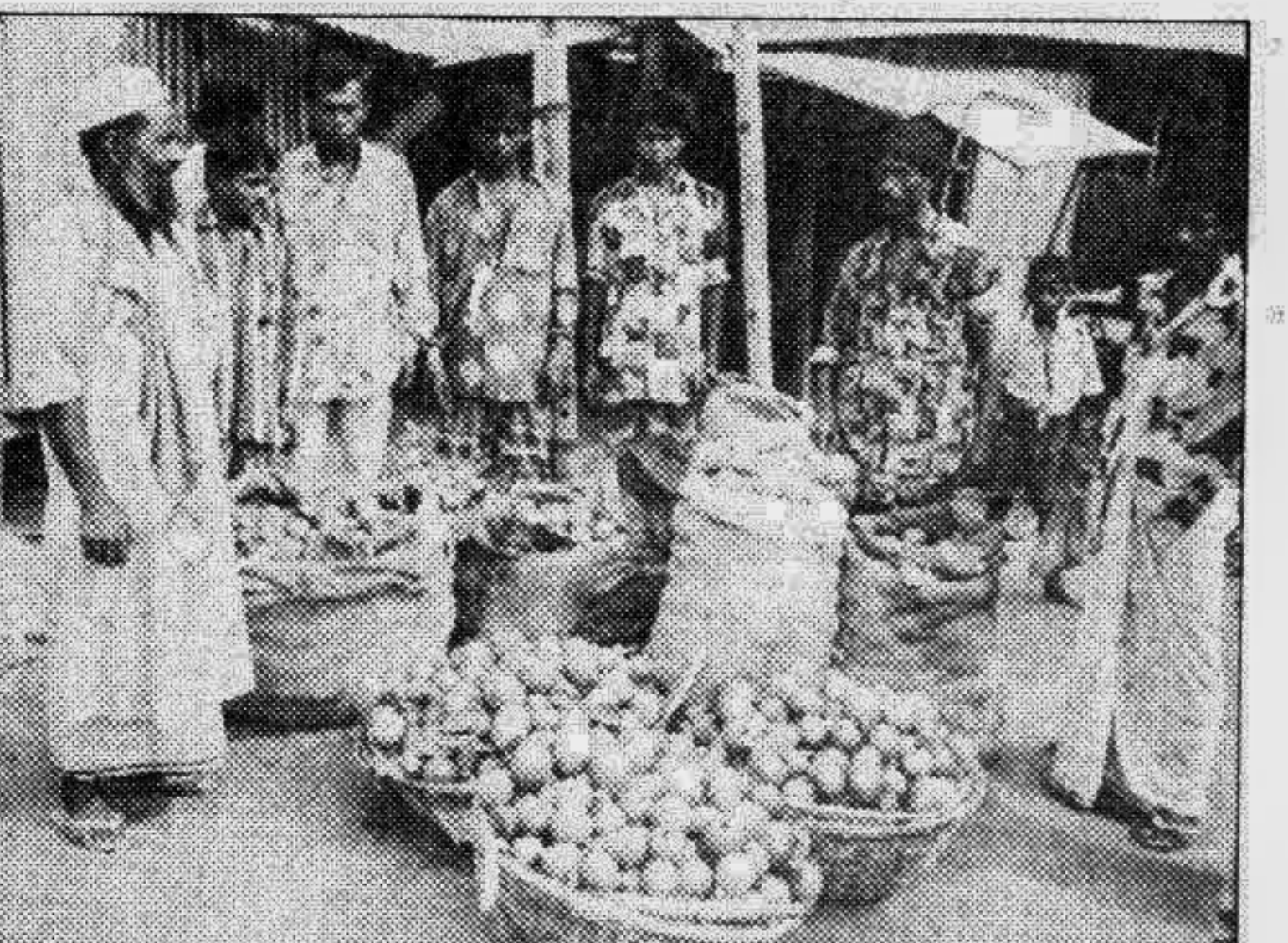
Fruit is energy: Seasonal fruit guava rich in Vitamin C and other nutrients have flooded the bazaars of Magura in recent days. It is specially good for lactating mothers and teething babies. Forty kgs of guava is being sold at Taka 200.