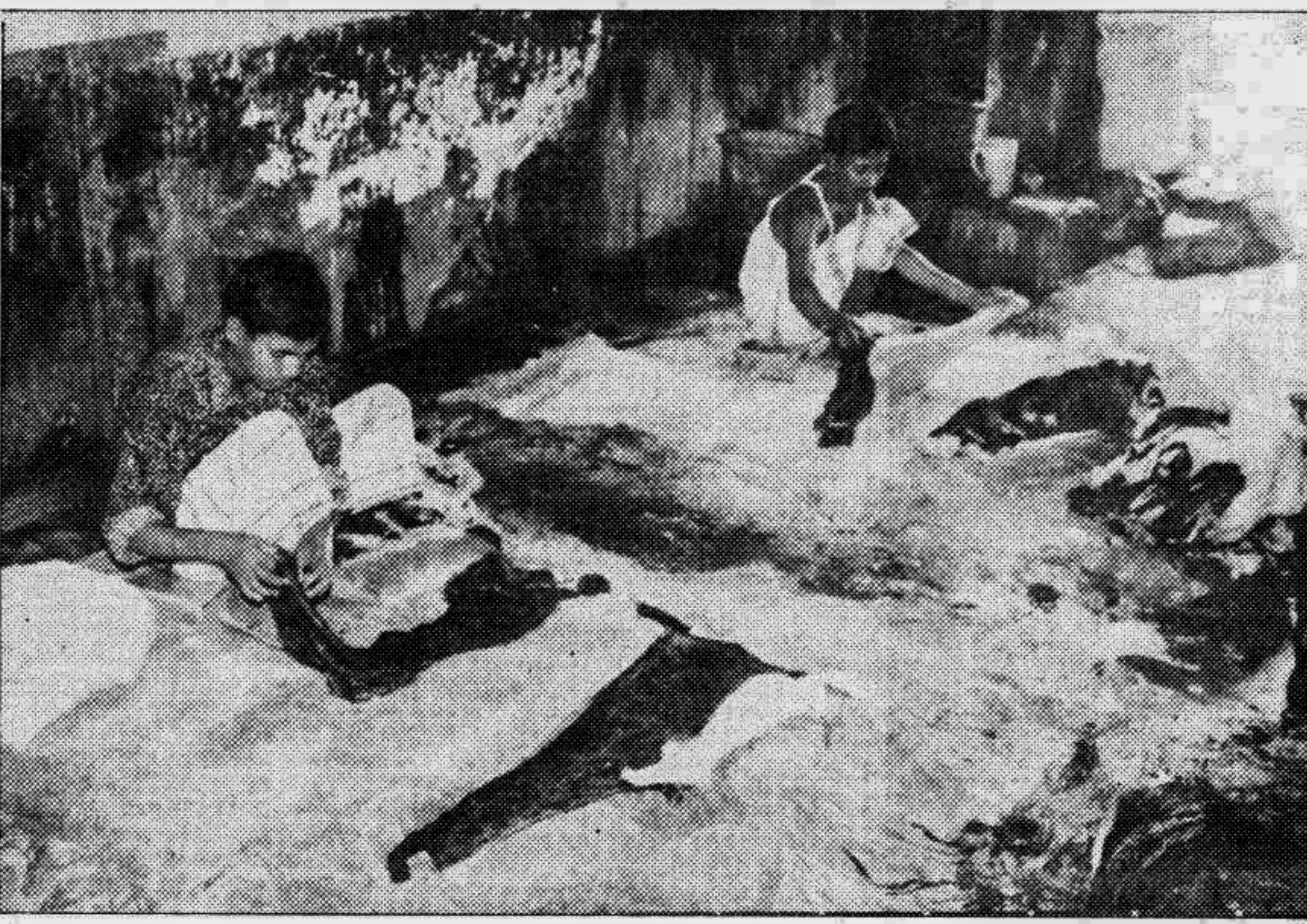
Hide scarcity: Workers cleaning and applying preserving materials on raw hides at a processing unit in Natore. Previously at least 15 labourers were engaged in one unit while now-a-days only one or two workers do the job in the single unit. This is because of a dull hide market in Natore.