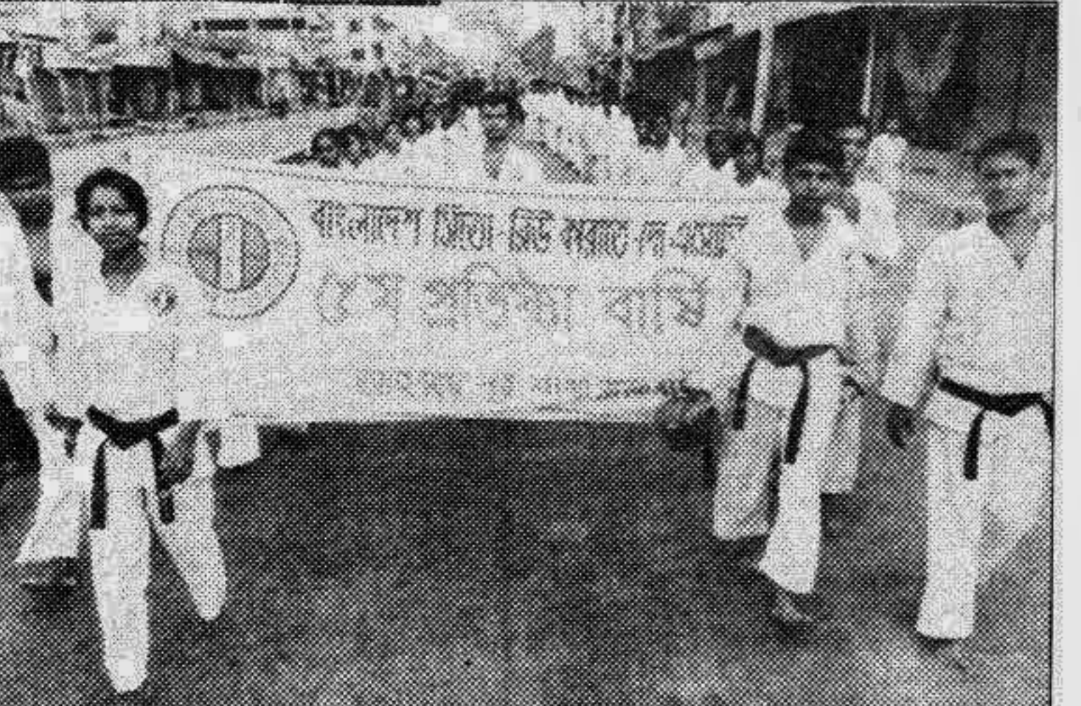
Healthy youths for healthy nation: The Ahmedpur unit of Bangladesh Shito-Ryu Karate-Do Association of Rajshahi recently celebrated its fifth founding anniversary with a colourful rally.