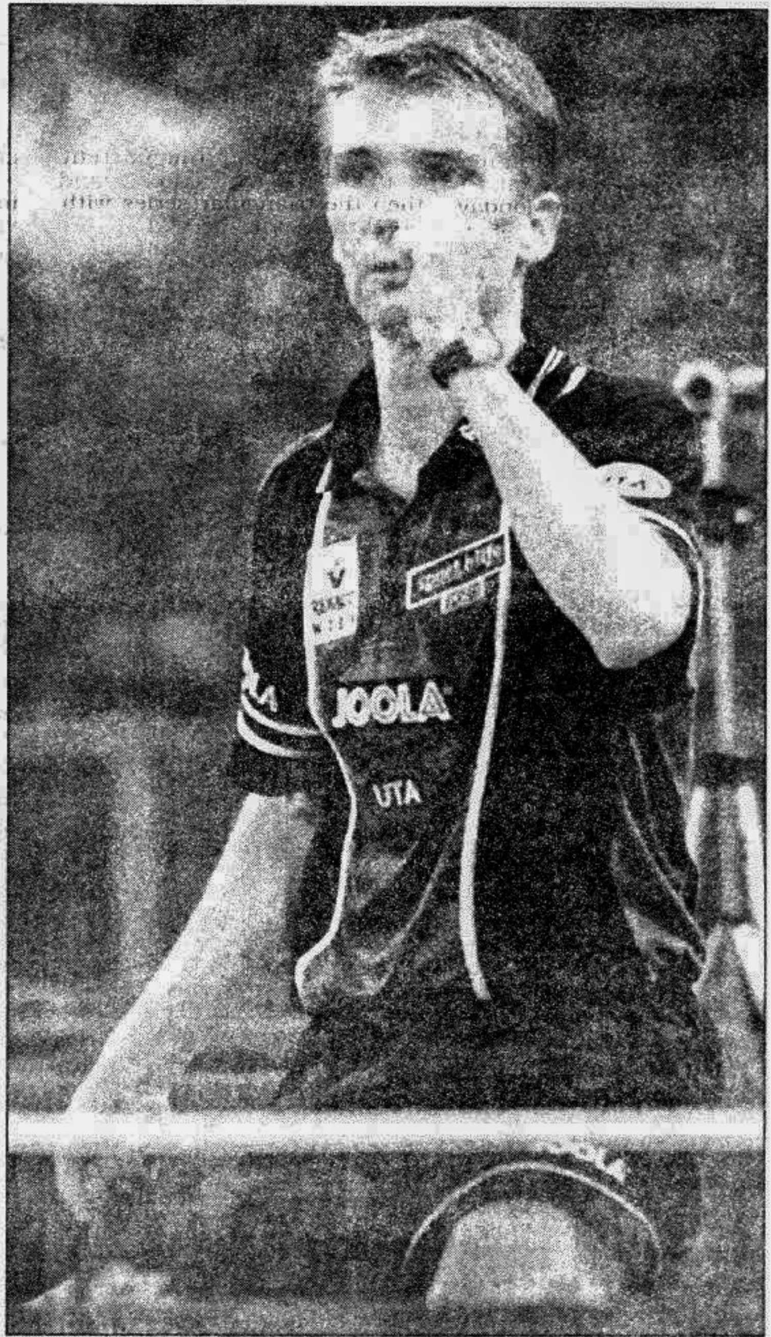
Austrian Werner Schlager exults after defeating Croatia's Zoran Primorac in the quarterfinals of the World Table Tennis Championships on August 6.

Backed by a noisy Chinese contingent in the crowd, Wang emerged the victor by a 22-24, 21-9, 21-15, 16-21, 21-16 scoreline.