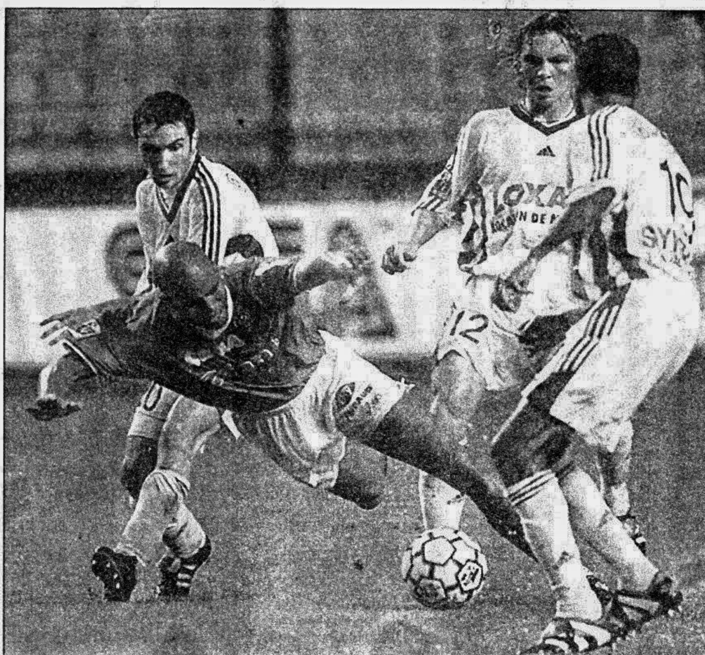
Action from the French First Division match between Saint Etienne and Nantes on August 6. Nantes won 2-0.

The documents are filled with possible violations not previously disclosed, one of the sources said. The sources said references to scholarships went well beyond previously disclosed memos from Atlanta Olympics chief Billy Payne, who said the memos contained ideas that never acted upon.