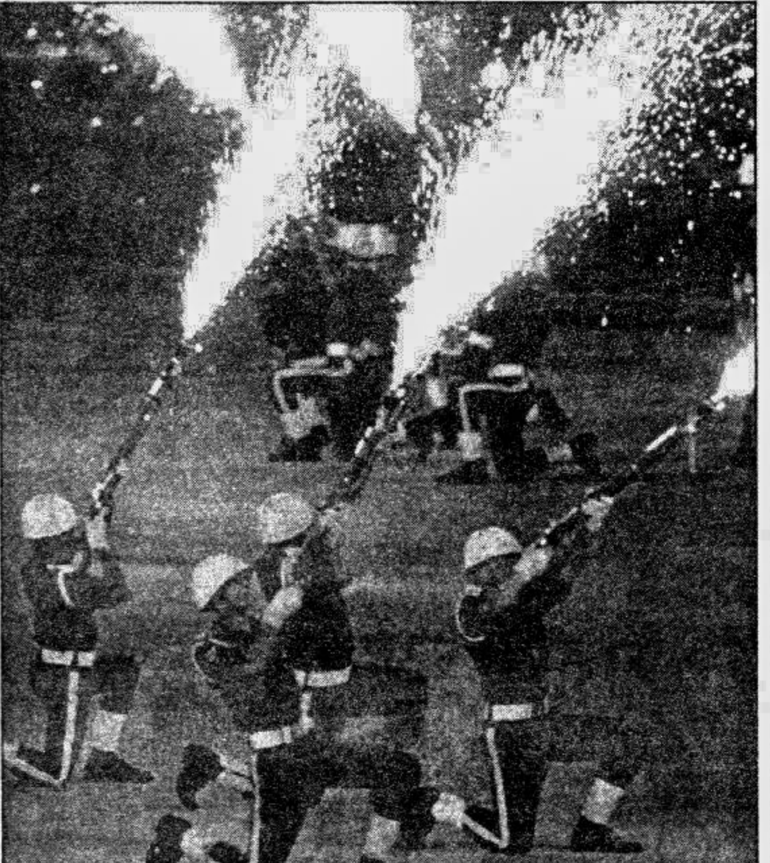
Scene from the opening ceremony of the Southeast Asian Games yesterday.

"I regard it as a great honor to be picked the final torch bearer," said the 26-year-old student of a Scottish university who was the last Brunei athlete to win a gold medal in the games in 1993.