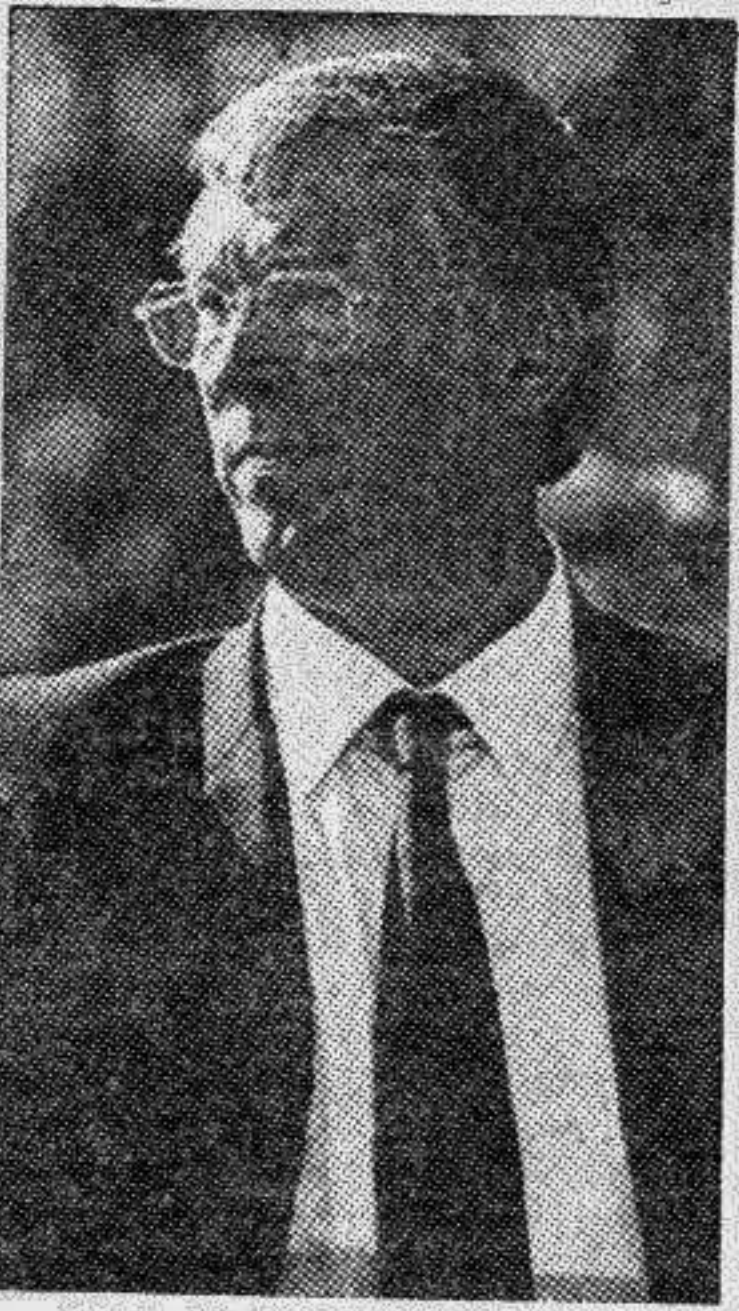
SIR ALEX FERGUSON

sympathises with the plight of his fellow Scot Walter Smith at Everton, the team United face.