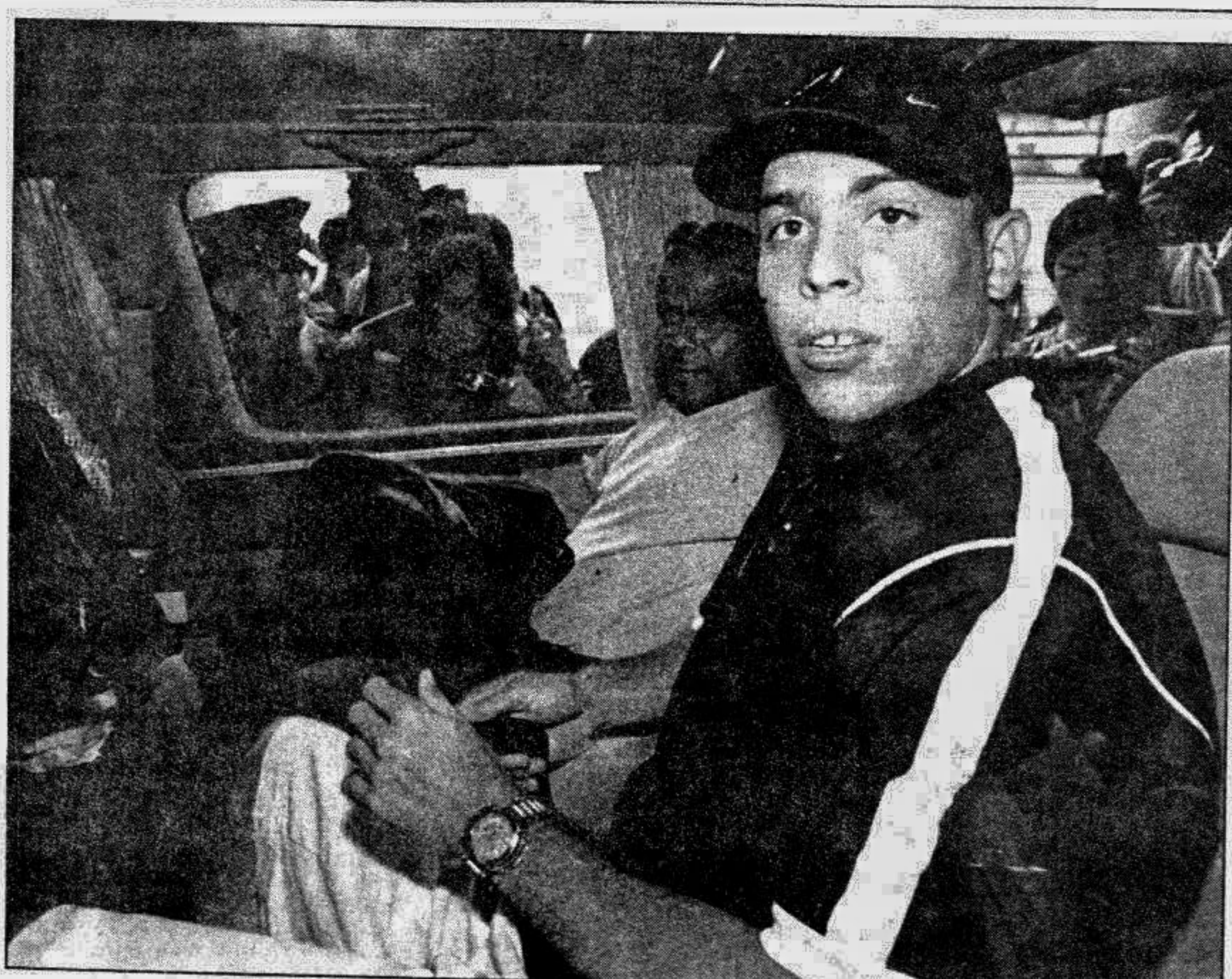
Brazilian superstriker Ronaldo leaving Hong Kong Airport yesterday. The Inter Milan player is the Chinese territory on a three-day promotional tour of a Swiss-made watch 'R9'.