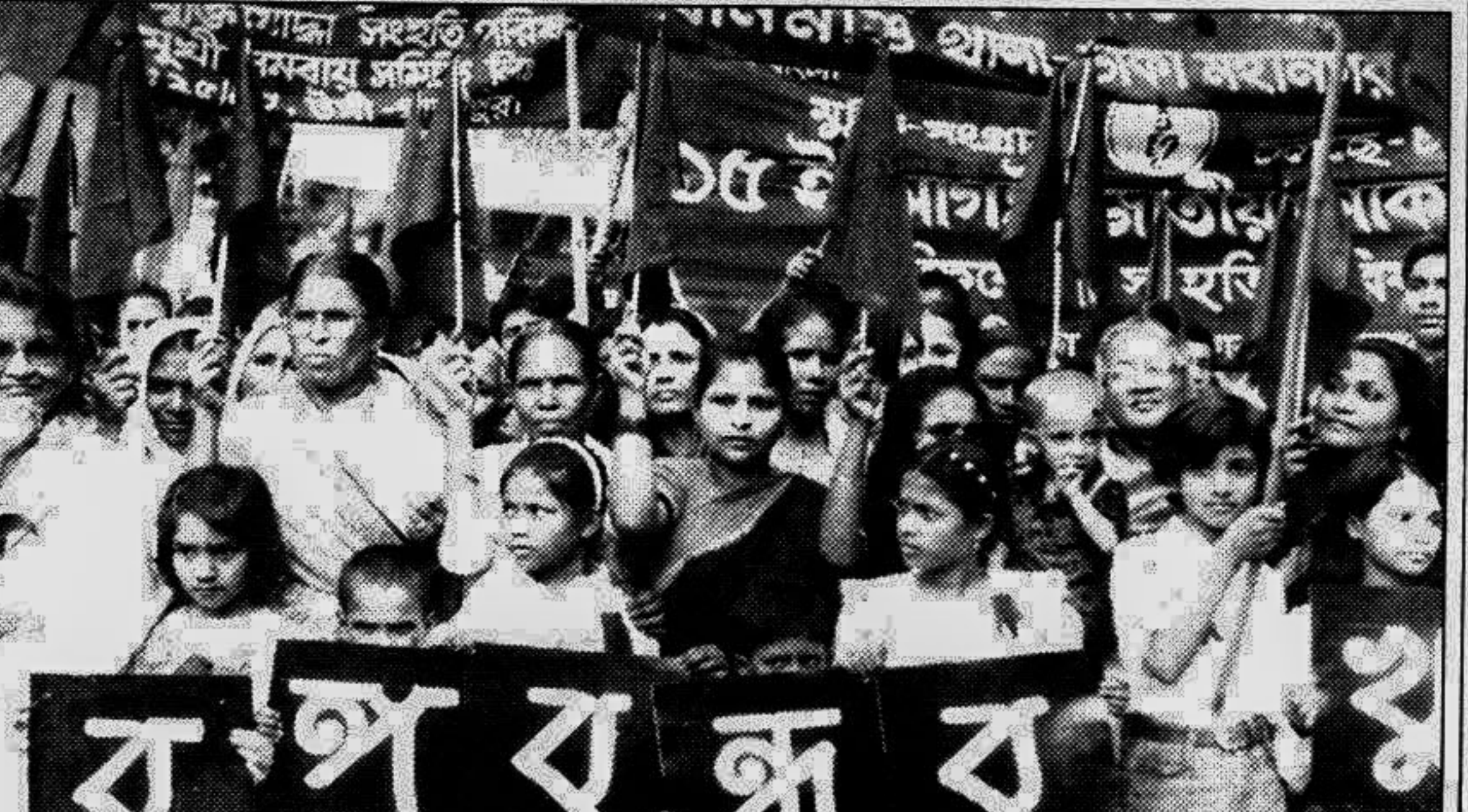
Muktijodha Sanghati Parishad brought out a silent procession to mark the National Mourning Day in the city yesterday. —Star photo