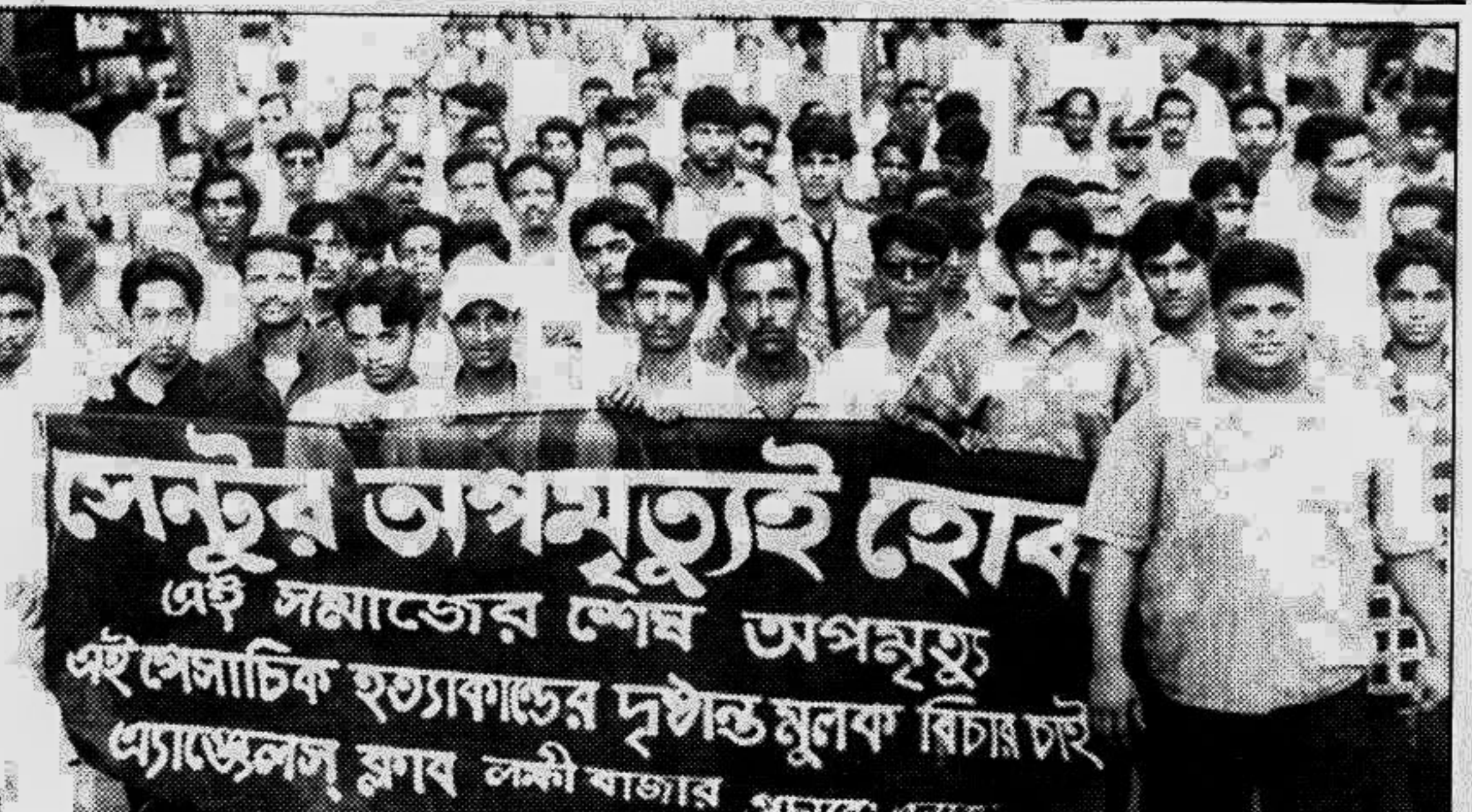
The residents of city's Laxmibazar area brought out a procession yesterday protesting the killing of Sentu.

It said the State Minister's comment that journalists taking bribe are writing against the rehabilitation of prostitutes of Tanabazar and Nimto is not only false and condemnable, it is also an attempt to undermine journalists and assassin their characters.