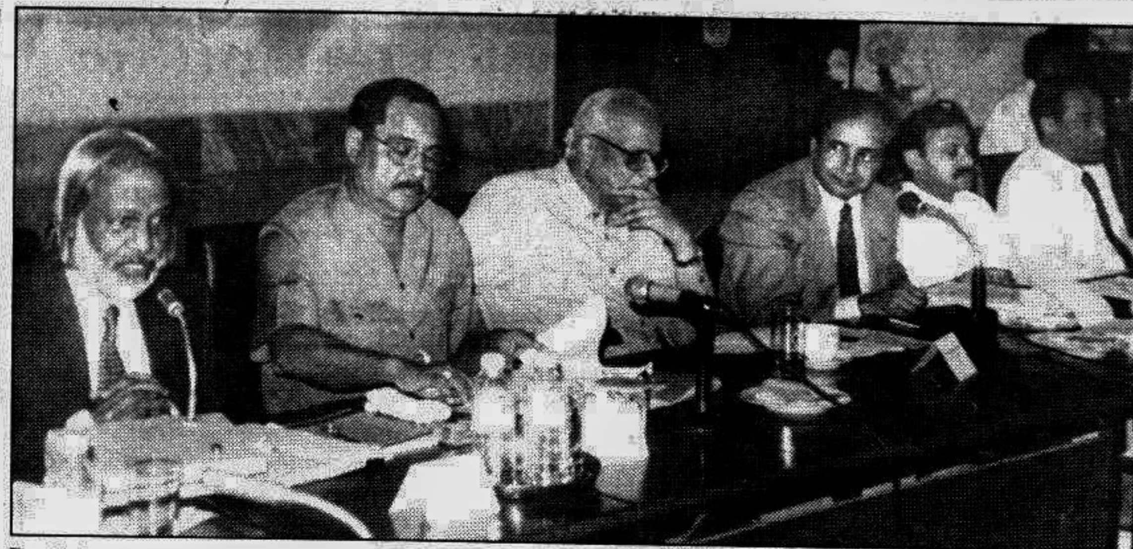
Participants at a roundtable discussion on 'Security Perception in South Asian Region and Beyond' held at the CIRADP auditorium in the city yesterday. Bangladesh Institute of Law and International Affairs organised the event.