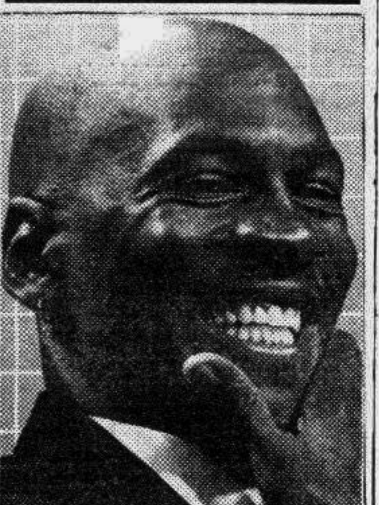
Michael Jordan (American basketball legend) "It's a hundred (per cent). It's a hundred right now." How sure he was that he would not return to basketball.