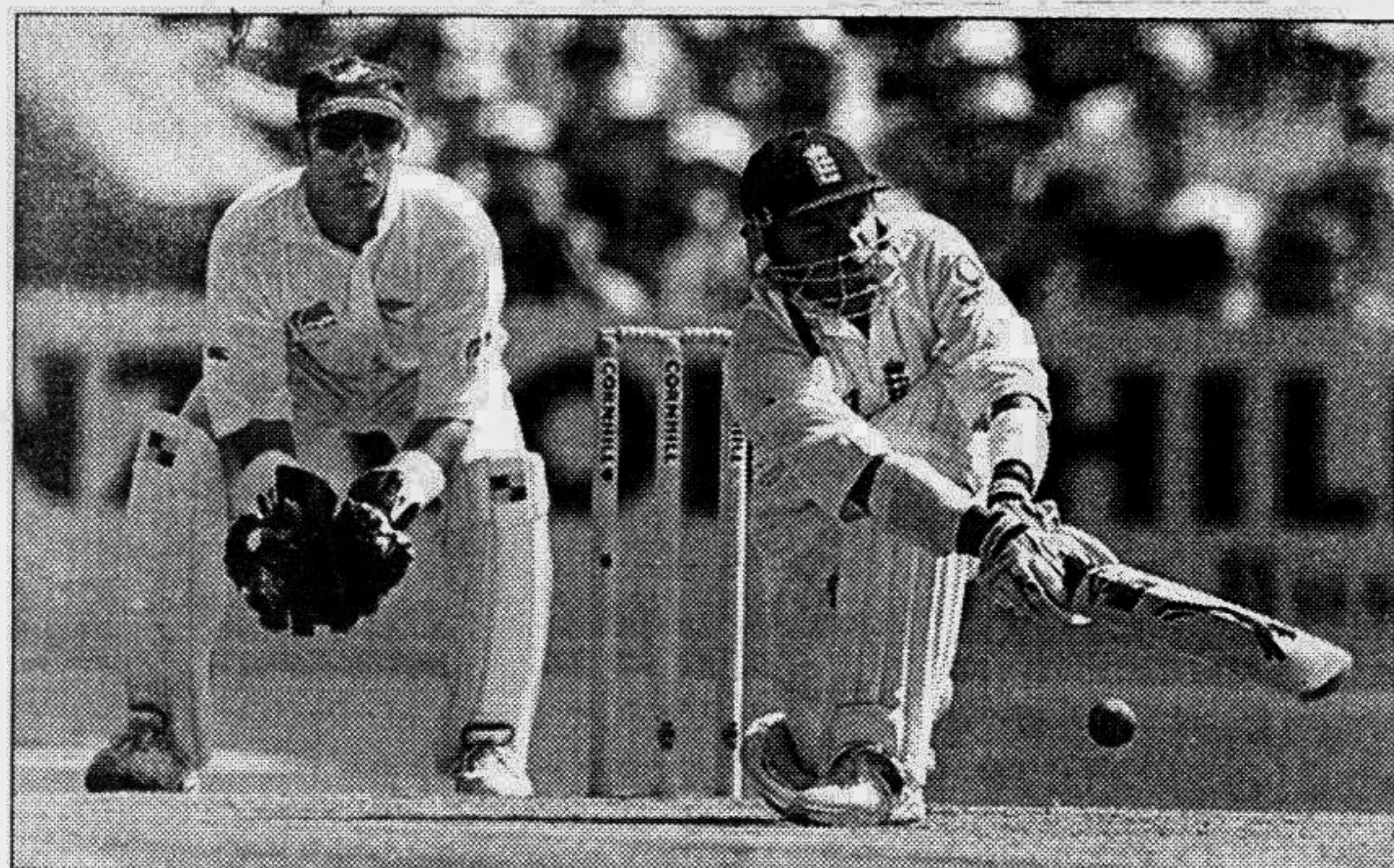
England batsman Mark Ramprakash sweeps during the third Test at Old Trafford yesterday.