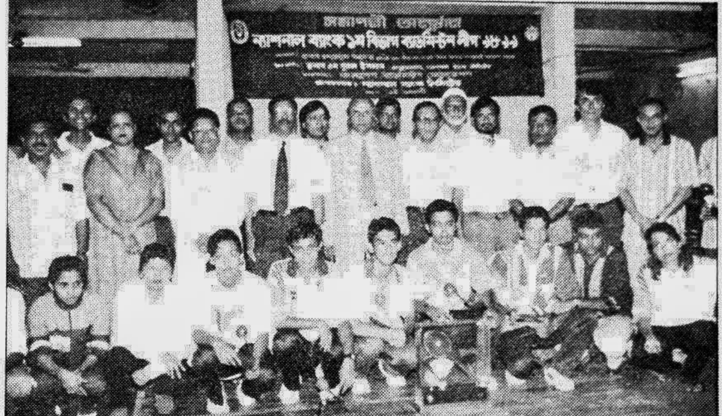
Winners of the National Bank First Division badminton league.