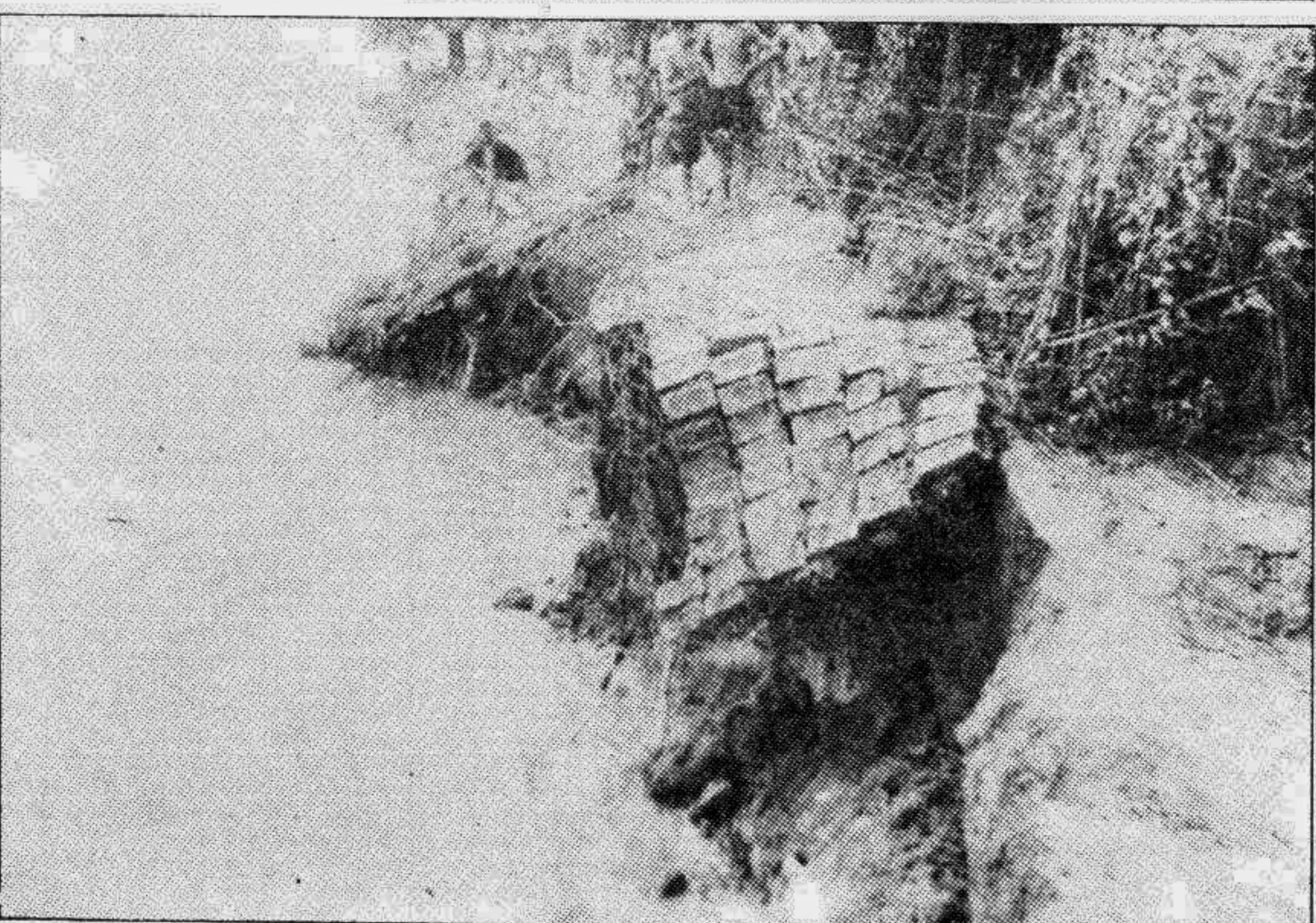
Nature's wrath: Vast tracts of lands and hundreds of homes going under water due to unabated erosion of the Padma in Rajshahi district.

Executive Engineer of Roads and Highway told that they have plan to renovate the road but could not implemented it due to lack of fund.