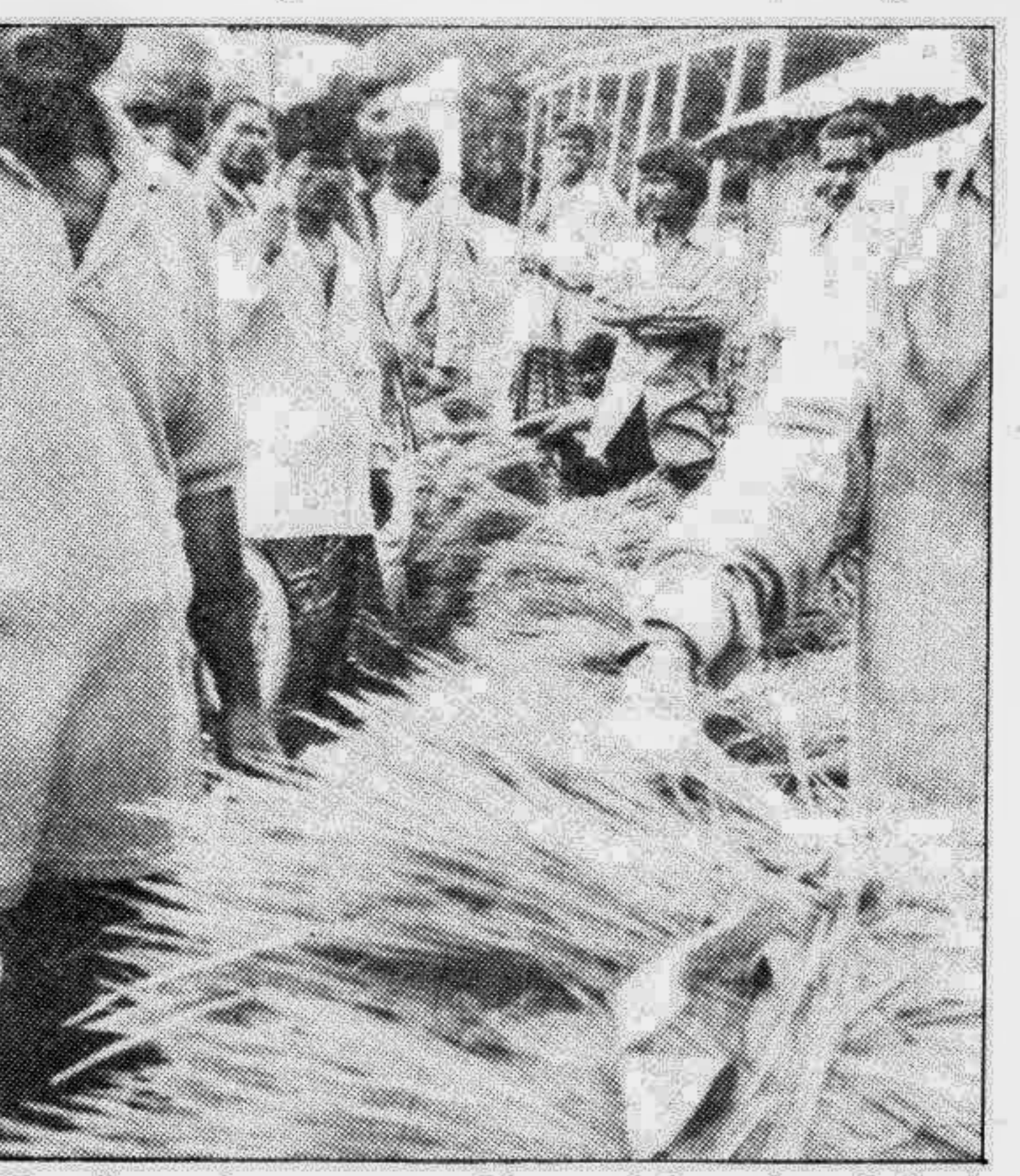
New hope for growers: Plenty of Transplanted Aus saplings at Sailkupa hat on Tuesday has brought hope to the Jhenidah farmers this sowing season.