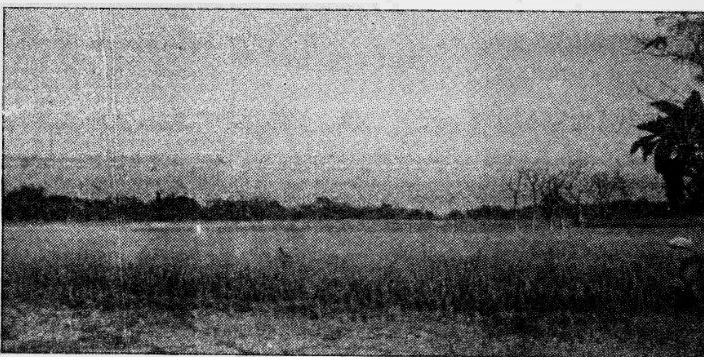
An Aus paddy field at village Naogon in Phulbari thana of Mymensingh district.

Production target has been fixed at 28,000 tonnes of paddy. Improved variety seeds, fertilisers and other inputs were supplied to the growers by the government to achieve the target.