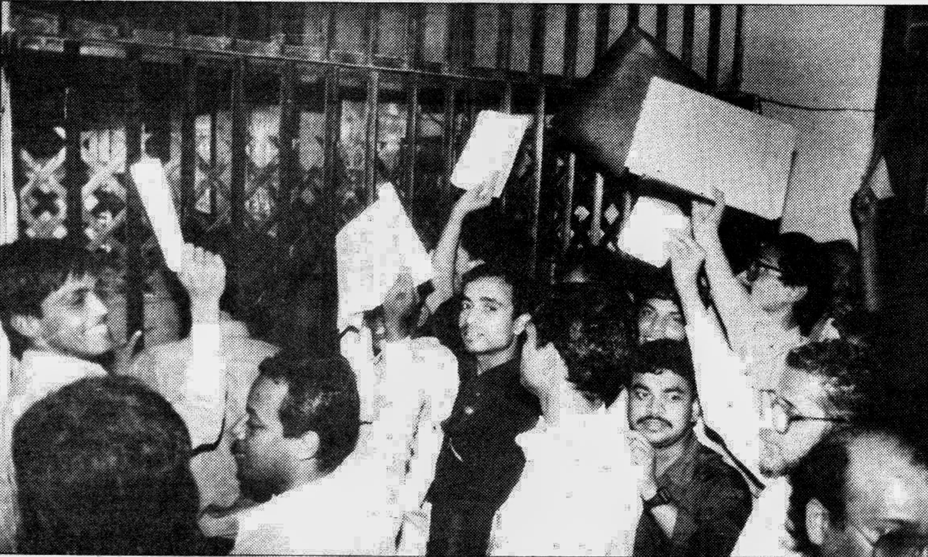
Garment employees wave files and papers in front of the closed gate of the EPB's Textile Cell at Motijheel in an attempt to draw attention of the officials of the cell to get things done.