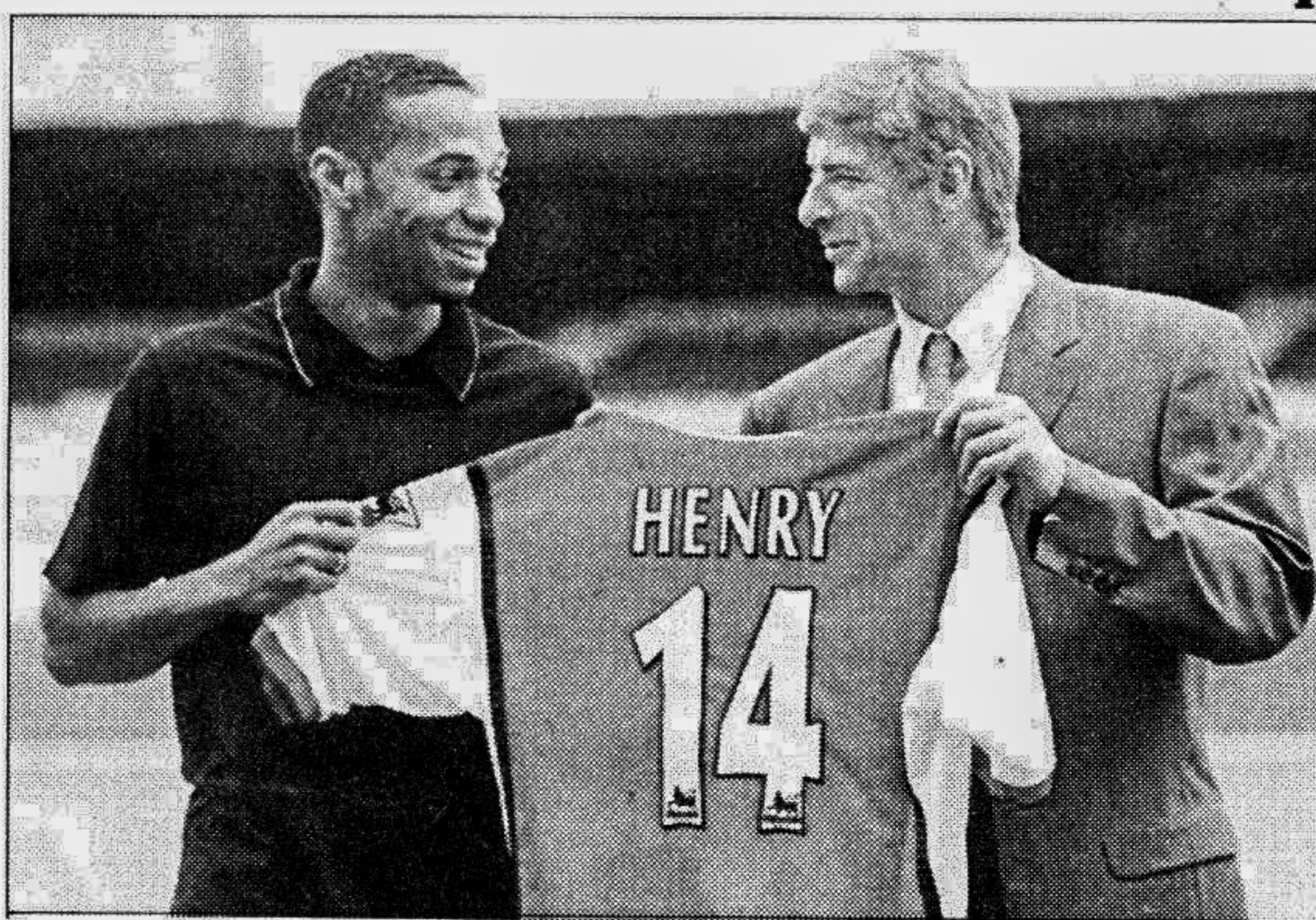
REUNITED: Arsenal's record signing French international striker Thierry Henry (L) and team coach Arsene Wenger posing for photographers with Henry's No 14 shirt at the Highbury Stadium on August 3. Wenger was once Henry's coach at French First Division team AS Monaco.

Egypt drew their two other matches in the tournament against Bolivia and Mexico.