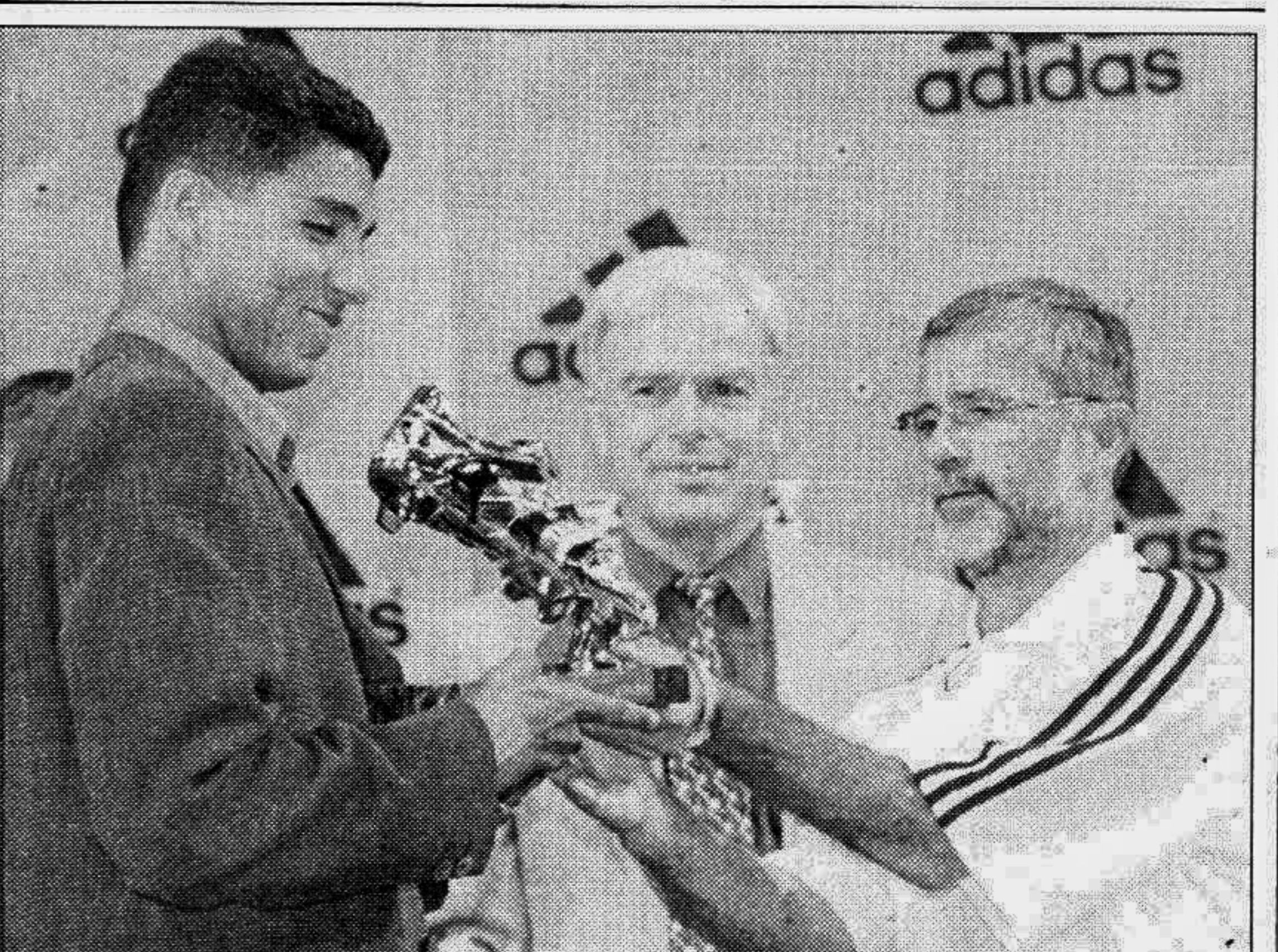
German football legend Gerd Mueller (R) giving away the Golden Shoe to FC Porto's Brazilian striker Mario Jardel (L) for becoming the best scorer in Europe during the 1998/99 season. Jardel had scored 36 goals in the Portuguese First Division.

The Cryptogram is a substitution cipher in which one letter stands for another. If you think that X equals O, it will equal O throughout the puzzle. Single letters, short words and words using an apostrophe give you clues to locating vowels. Solution is by trial and error.