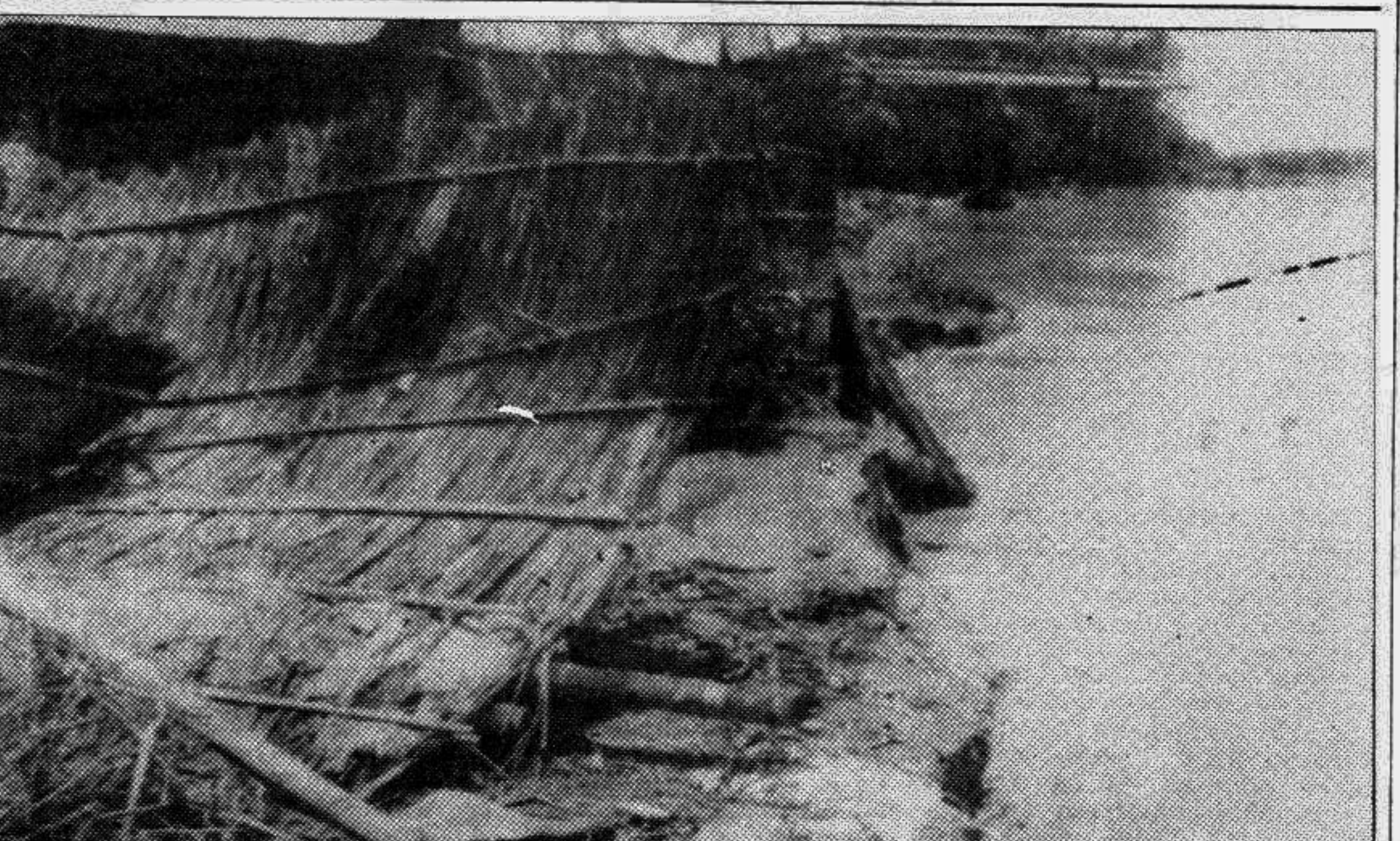
Unrequited anger: The River Padma has devoured hundreds of acres of land including homesteads in Baragharia of Chapainabganj district with the onset of the rainy season.

Additional District and Sessions Judge, Shah Alam Chowdhury acquitted all the accused after examining 10 prosecution witnesses.