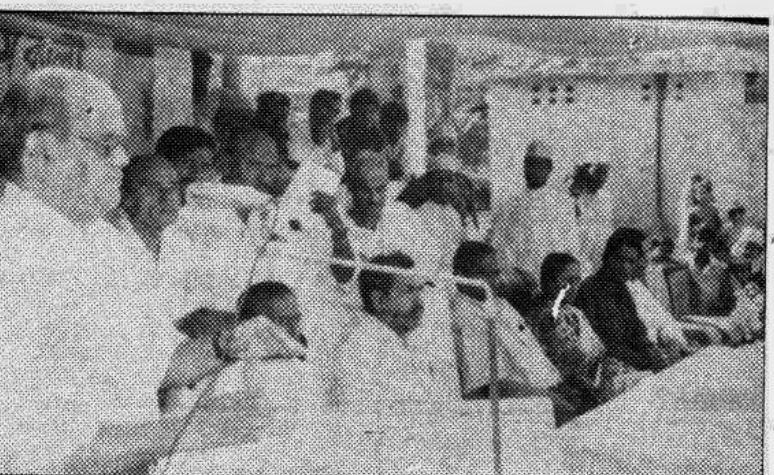
The civil surgeon of Barisal speaking at the ORTC meeting recently.