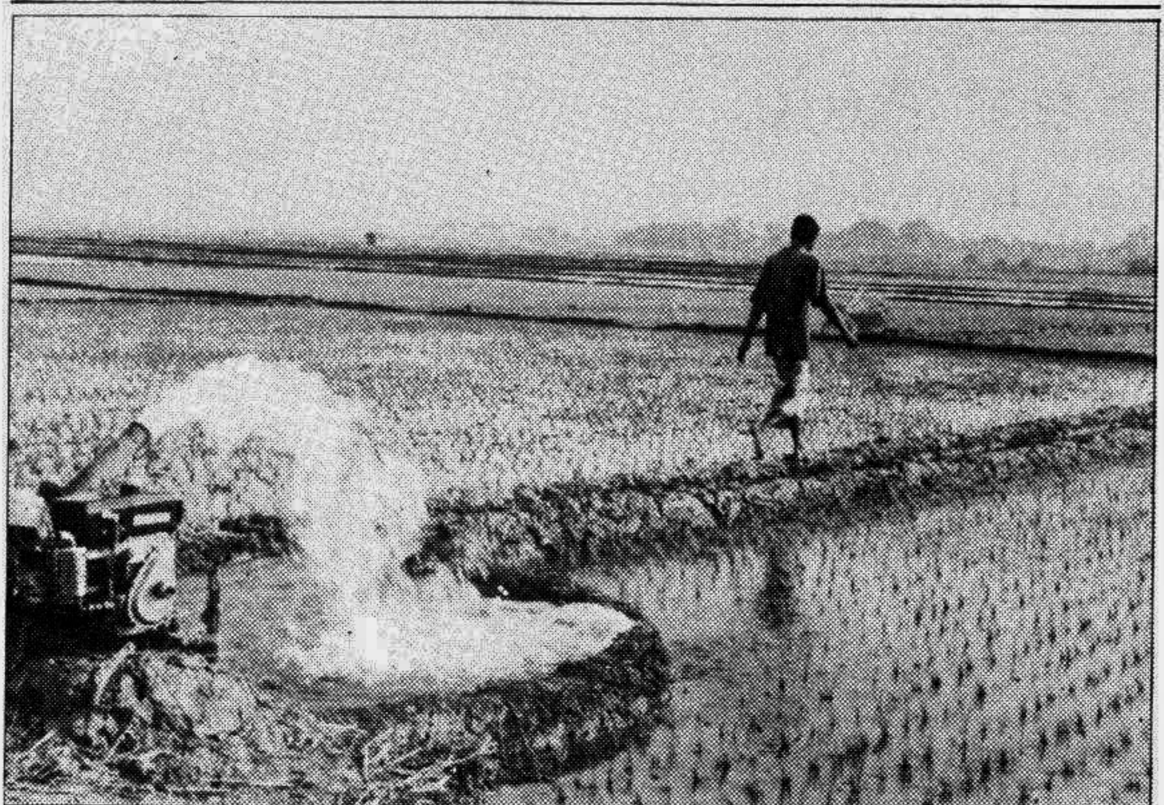
Will dream come true? : Natore farmers sowing transplanted Aman paddy with renewed zeal and enthusiasm. Being inspired by last year's bumper production of Boro crops, they are striving hard in the hope of a good yield this season also. Hopefully weather has favoured them so far.

The law enforcing agencies are not taking steps to curb the menace, it is widely allged.