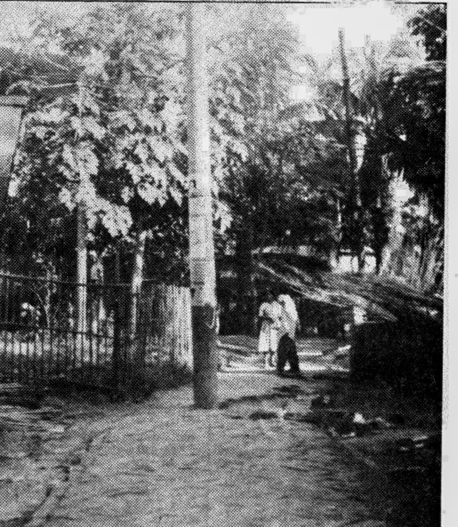
Routine affair: The electric pole in the middle of a road in Saikupa Municipality of Jhenidah district is PDB's idea of development.