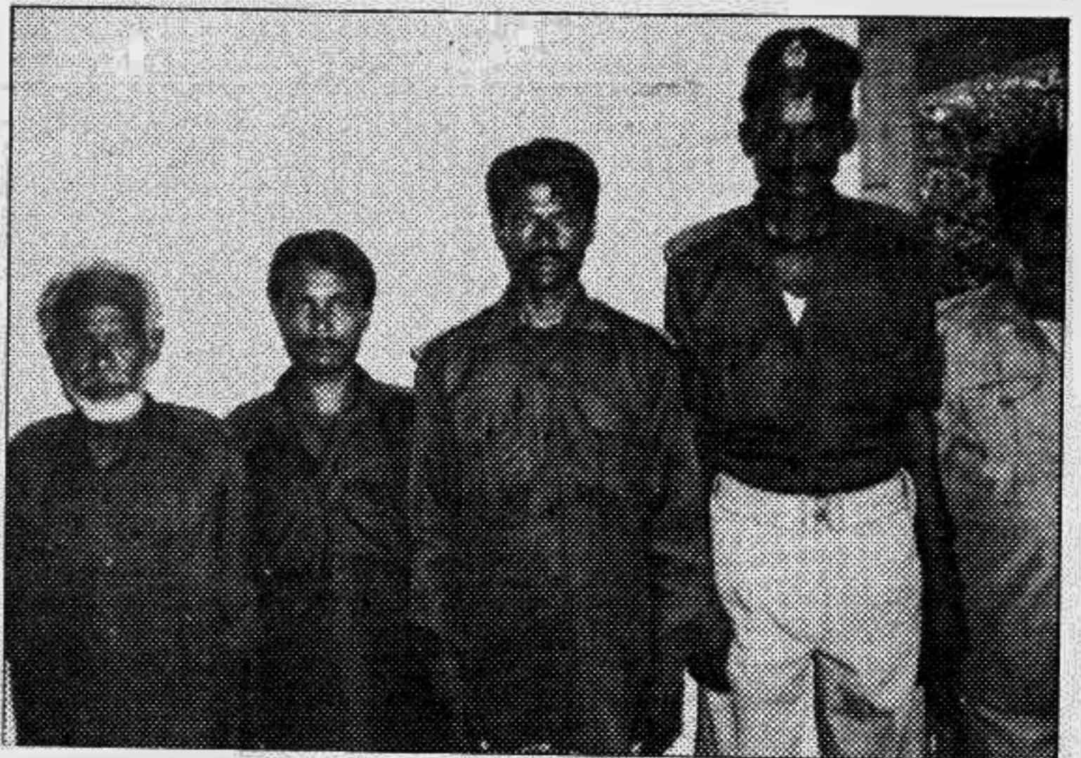
Suffering deprivation: Grim faces of some Gram Policemen.

the members of 'gram police', their income is lesser than that of a day labourer. Even a street beggar is more well-off than a 'gram police'. They also opined that despite living in a miserable condition, they are getting deprived of sympathy of the union council authorities.