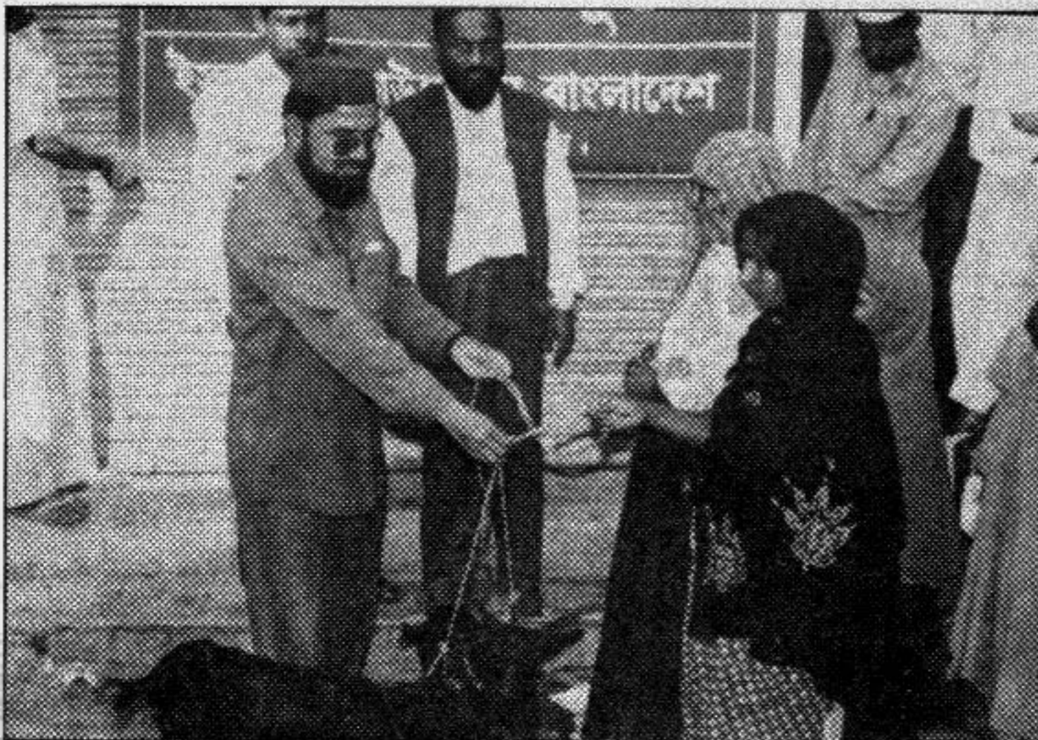
Welfare programme: Deputy Director of Natore Islamic Foundation distributing goats among the hapless women of rural areas as part of its poverty alleviation programme.