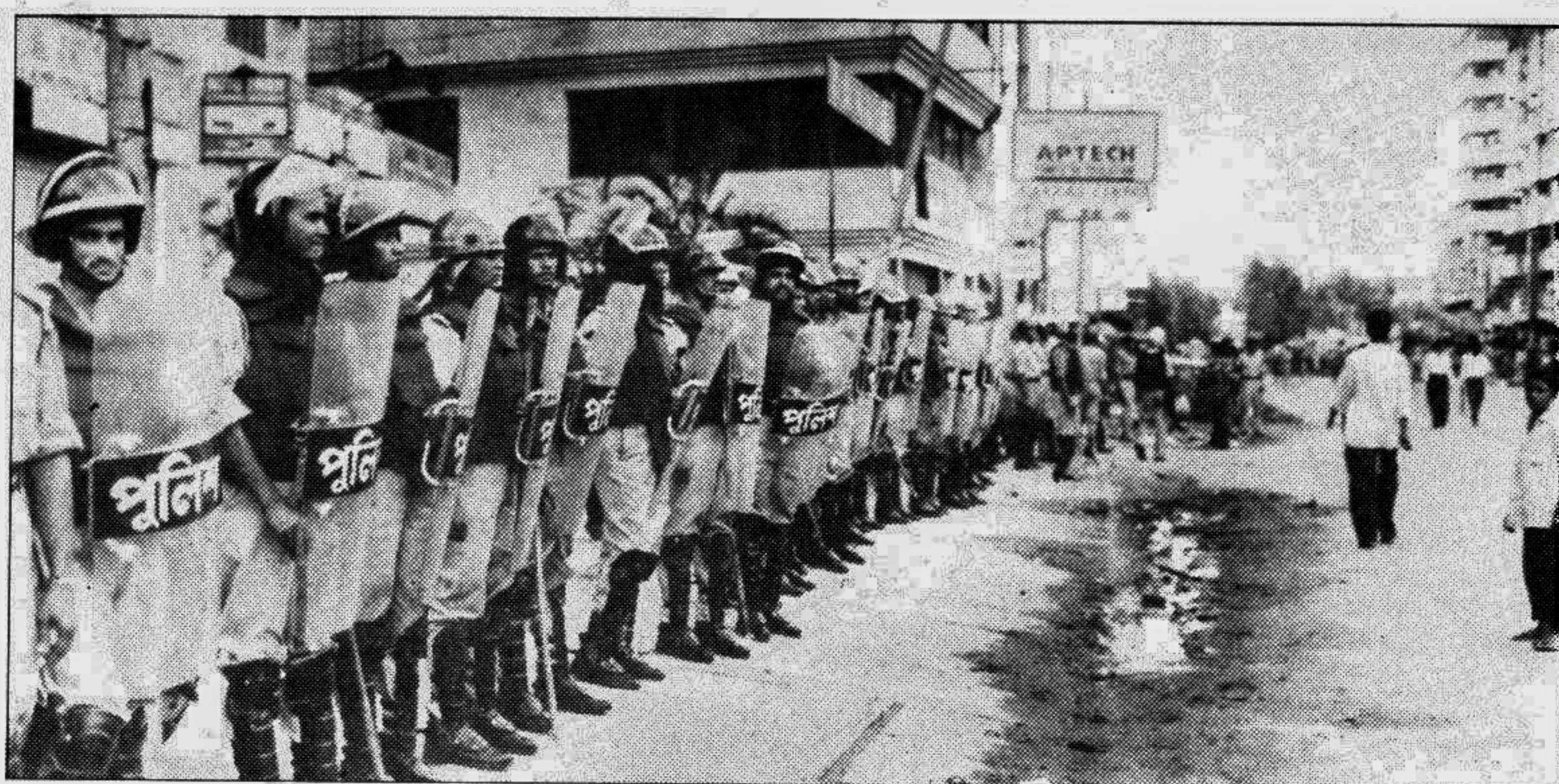
Cops in riot gear stand vigil in front of the BNP office in the city during hartal hours yesterday.

She accused the opposition leader of spreading "lies" against the ruling party. "She said that from the CHT region up to Feni will be part of India."