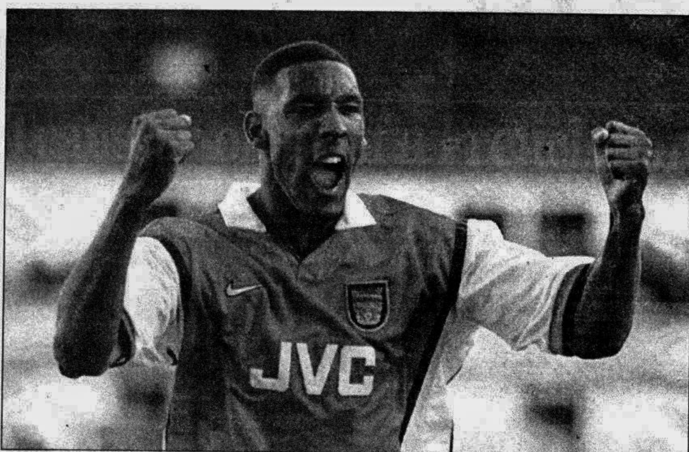
DESTINATION MADRID: An AFP file photo of French superstar Nicolas Anelka whose much publicised transfer saga from Arsenal ended yesterday with a move to Spanish giants Real Madrid.