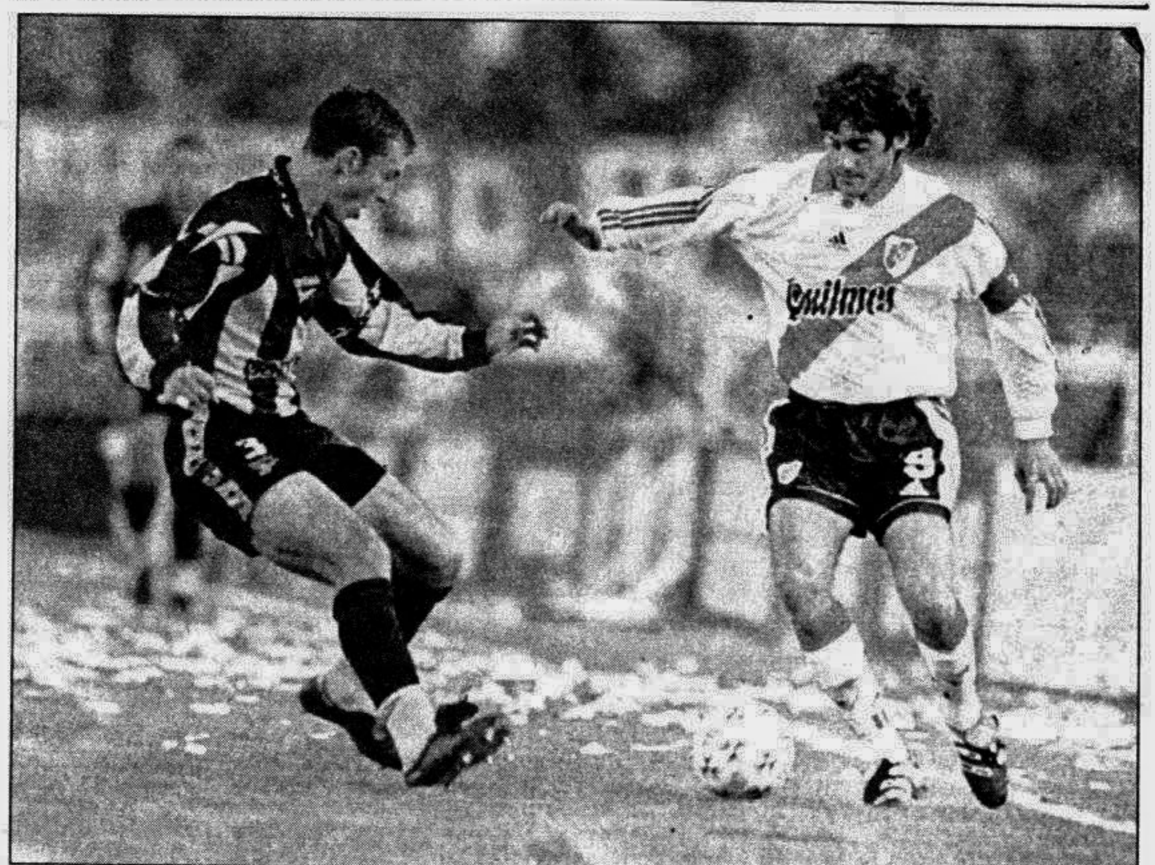
THE GREAT URUGUAYAN'S LAST: Uruguayan football legend Enzo Francescoli (R) of River Plate displaying his customary skills during his last appearance as a professional player in a match against Penarol at Buenos Aires on August 1.

Sampras stretched his lead over Agassi in their head-to-head series to 15-10. The long-time rivals, who first played each other as juniors, engaged in some good-natured needling after the match. Sampras pointing out that he leads Agassi 3-1 in grand slam finals, and Agassi indicating he was saving himself for a US Open showdown.