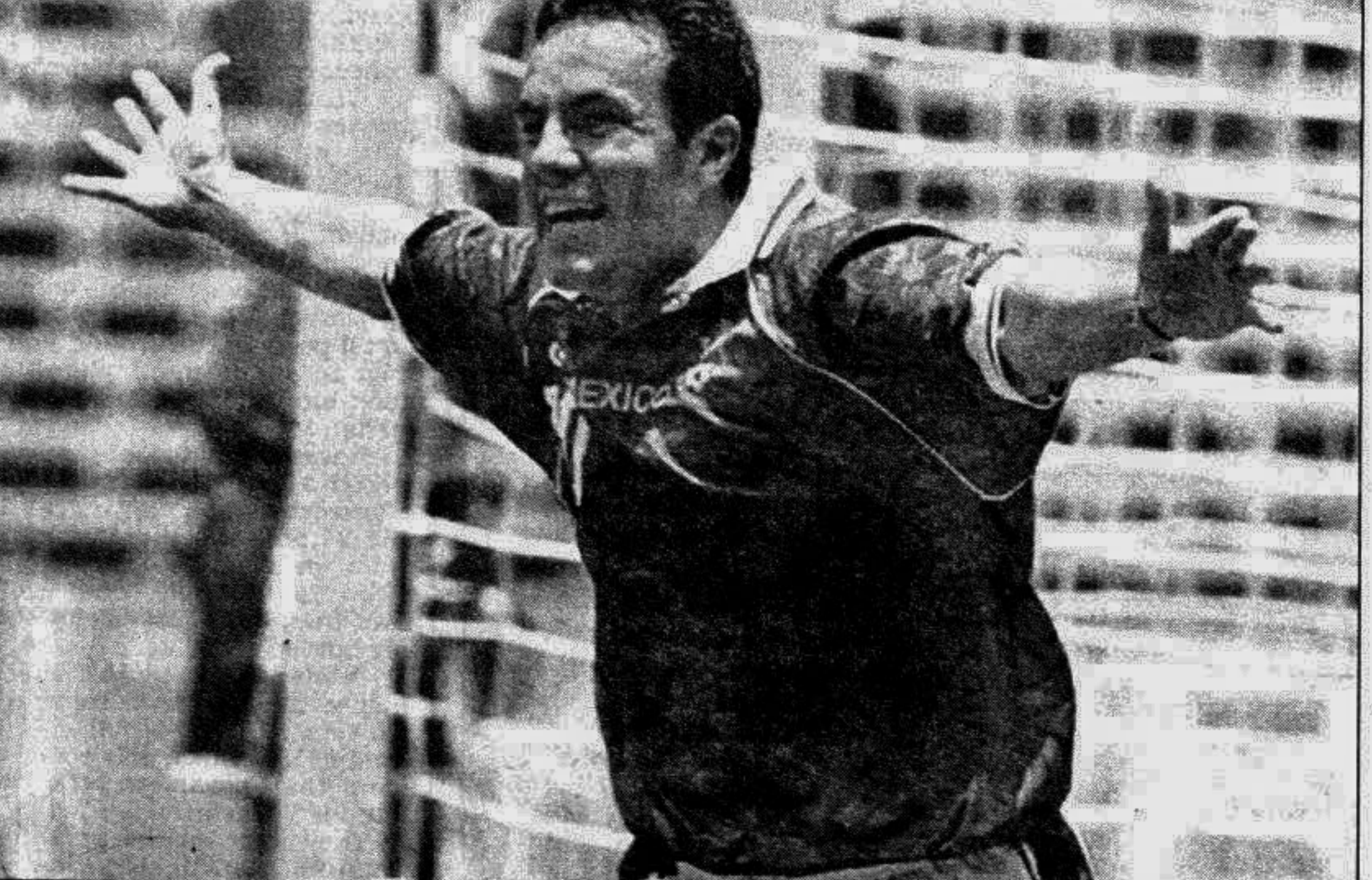
Mexico's prolific striker Cuauhtemoc Blanco is elated after scoring the 'golden goal' in the Confederations' Cup semifinal against the USA at Mexico City on August 1.