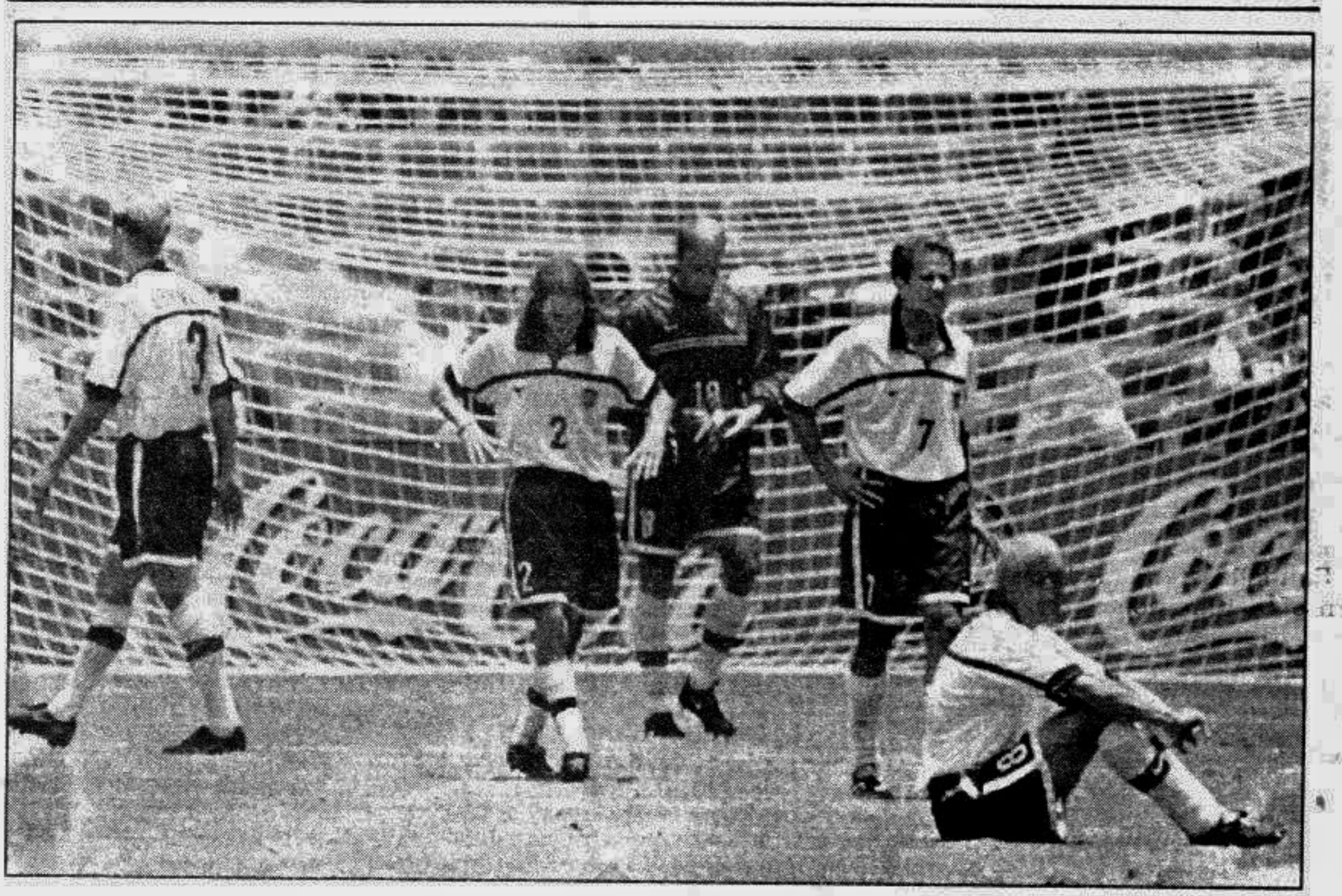
END OF THE ROAD: Disappointed USA players trying to come to terms with their 'golden goal' defeat in the Confederations' Cup semifinal.

A retired man and a worker died in the Mediterranean city of Alexandria following "a sudden surge in blood pressure due to their anger over the team's defeat," the government daily Al-Ahram reported.