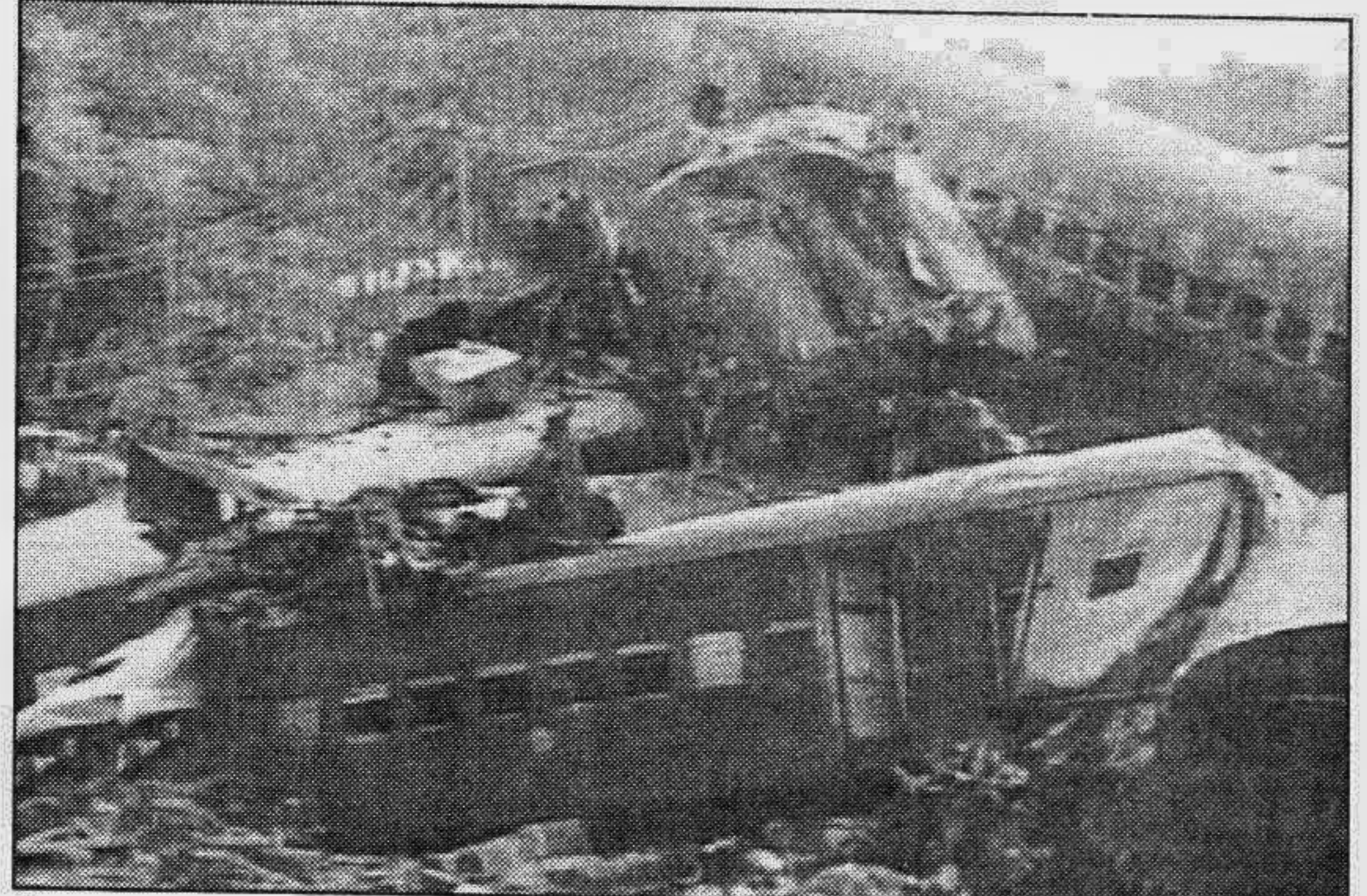
The wreckage of two express trains which collided head-on at Gaisal station, some 500 km north of Calcutta before dawn yesterday.