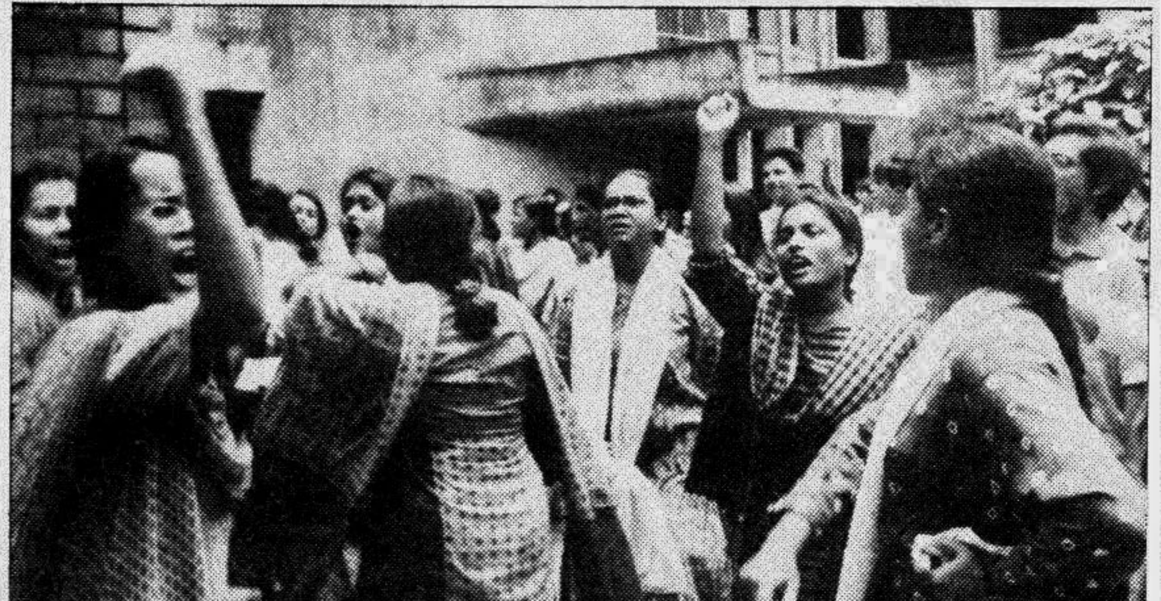
Grapes of wrath Militant students march off after raiding the Maulana Bhasani Hall yesterday in search of criminals (top), Kamaluddin Hall is thoroughly searched, room by room for rapists (middle), and students demonstrate in front of the VC's office demanding arrest of killers and rapists within 24 hours (bottom).