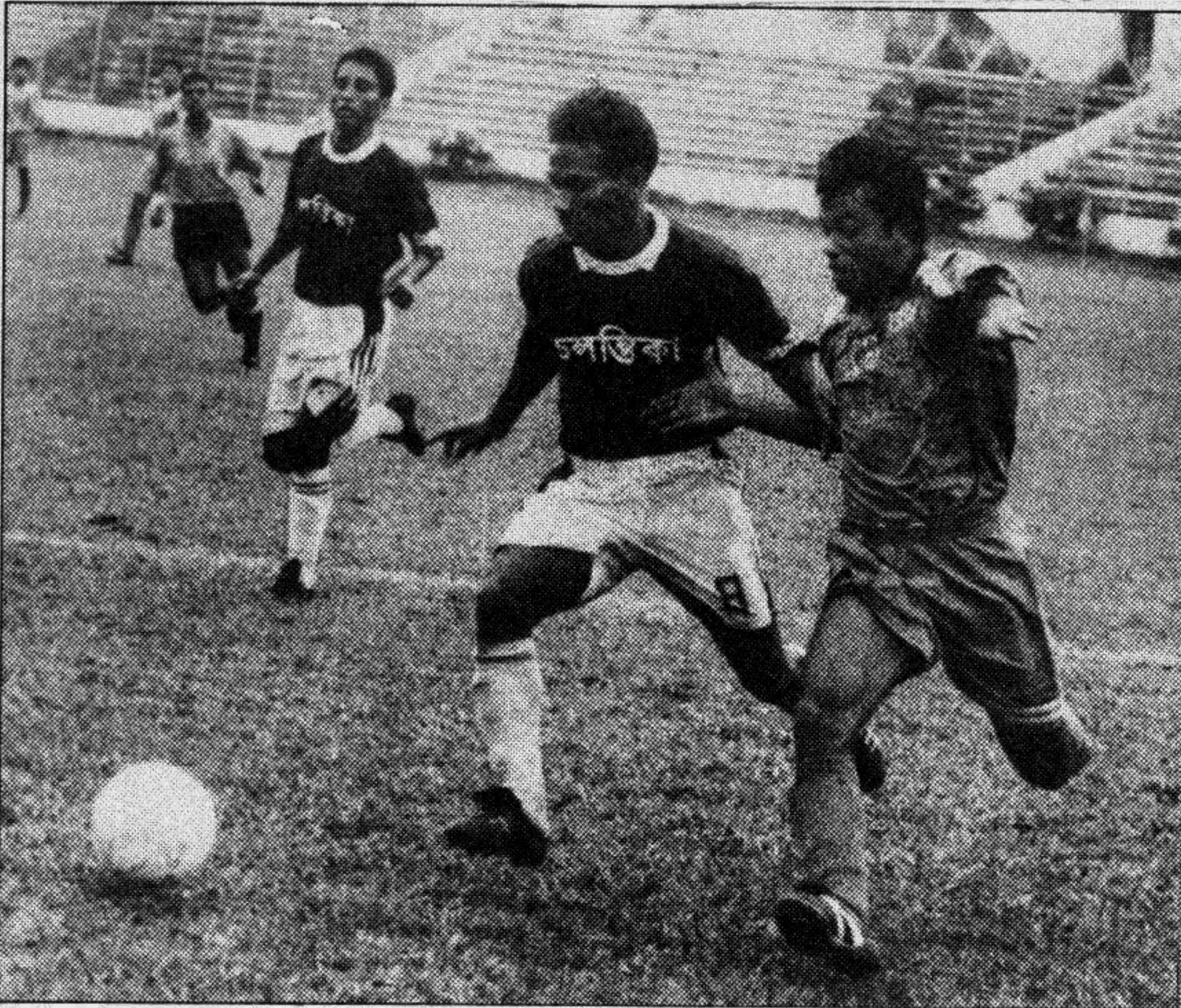
Action from yesterday's Premier Division football league encounter between Youngmen's Fakirerpool and Mirpur Chalanika.