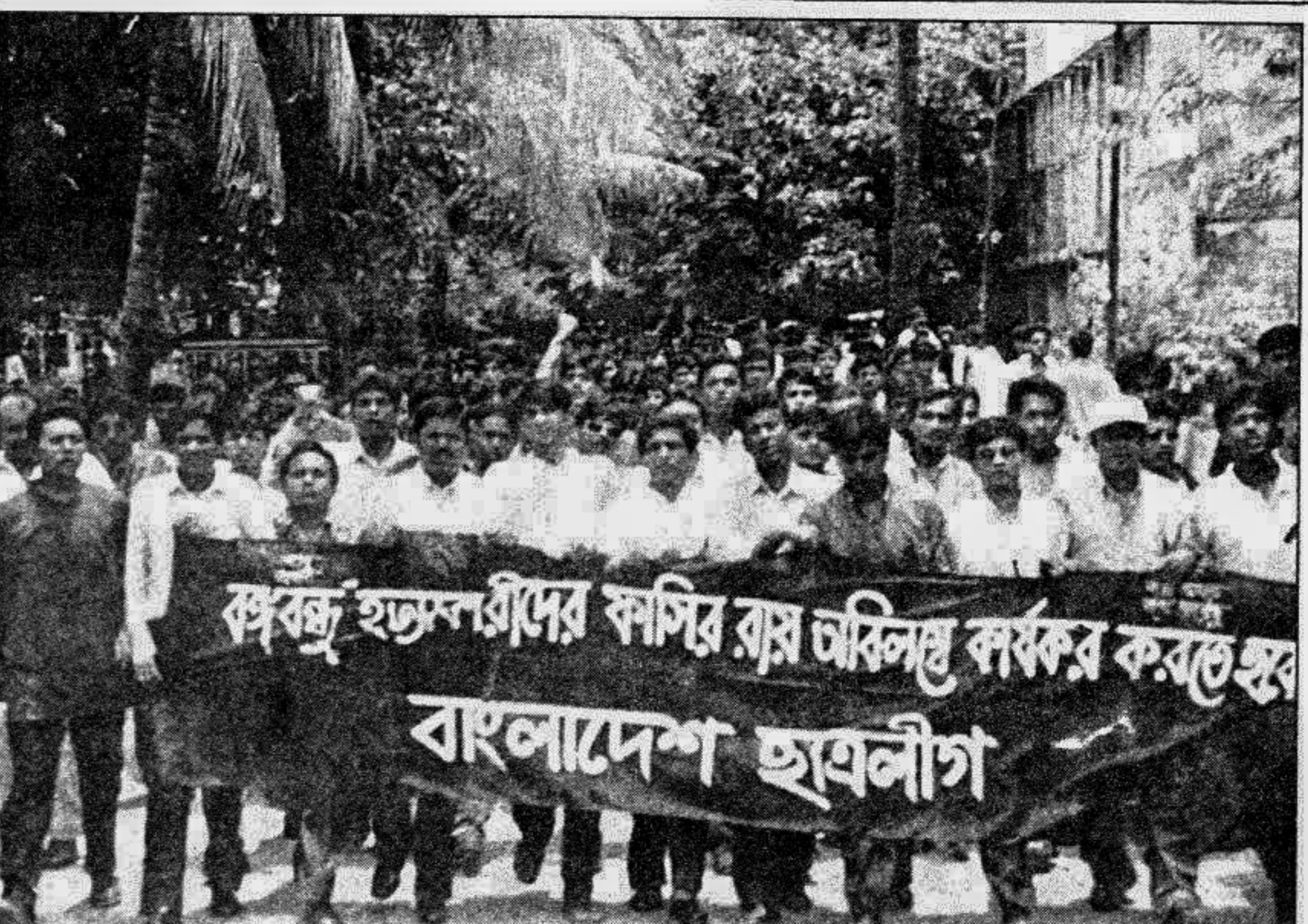
Bangladesh Chhatra League (BCL) brought out a procession on the Dhaka University campus yesterday demanding immediate execution of the Bangabandhu Murder Case verdict.

'However, this time, I find no such quality in a newspaper. Sometimes, the report published is baseless and concocted,' he said without naming any newspaper but expressed the hope that a report would be properly written before publishing it."