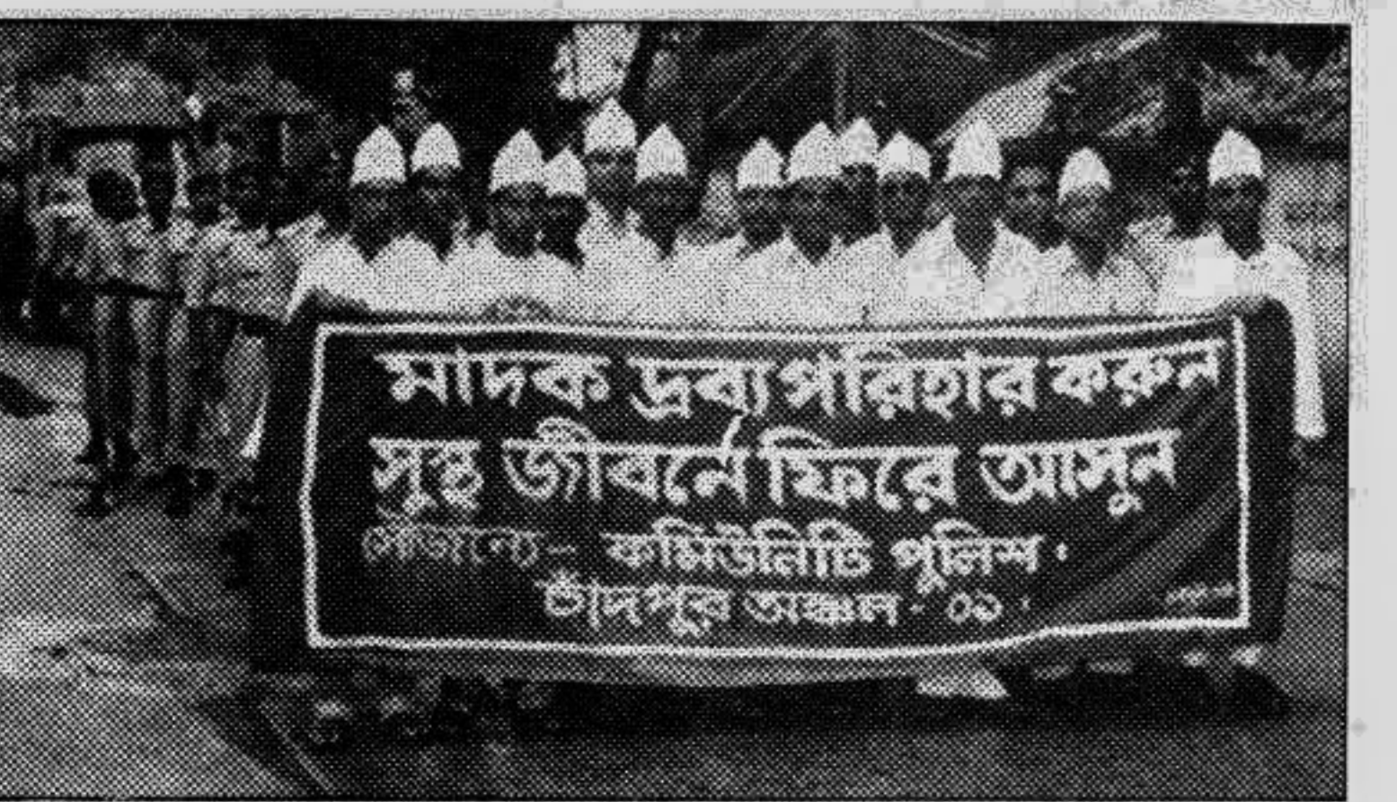
Return to healthy life: Community police of Chandpur zone 01 urged misguided people to shun drug addiction by bringing out a rally in Chandpur town recently.