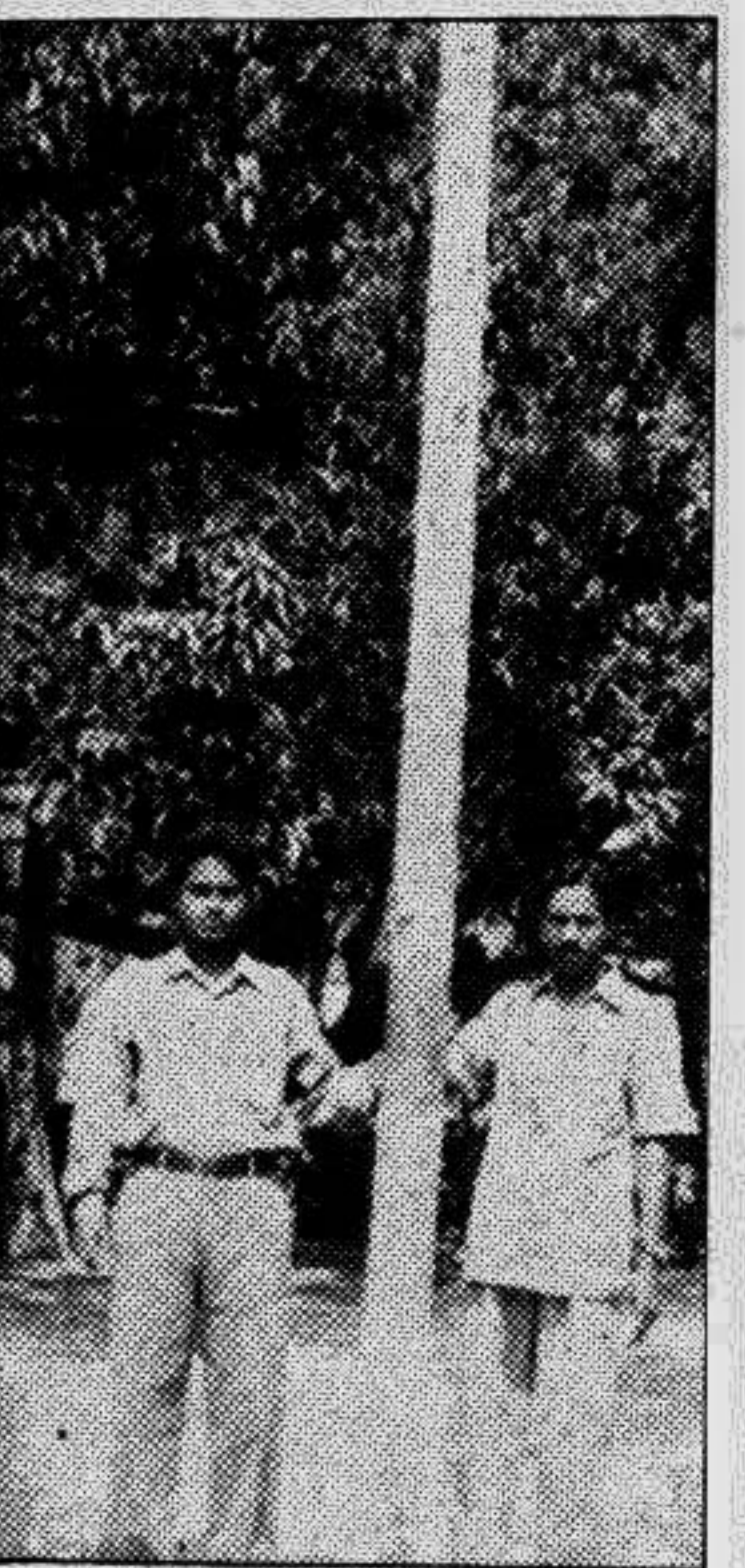
Another wonder? : Owners display a 83-inch diameter bamboo that they had cut from their homestead forest recently in Jhenidah.

Later on, they drew Tk 16.68 lakh as overdraft and place account loans from June 5, 1996 to January 6, 1997. After investigation, the bureau found the two officials guilty of opening false account and misappropriation of money.