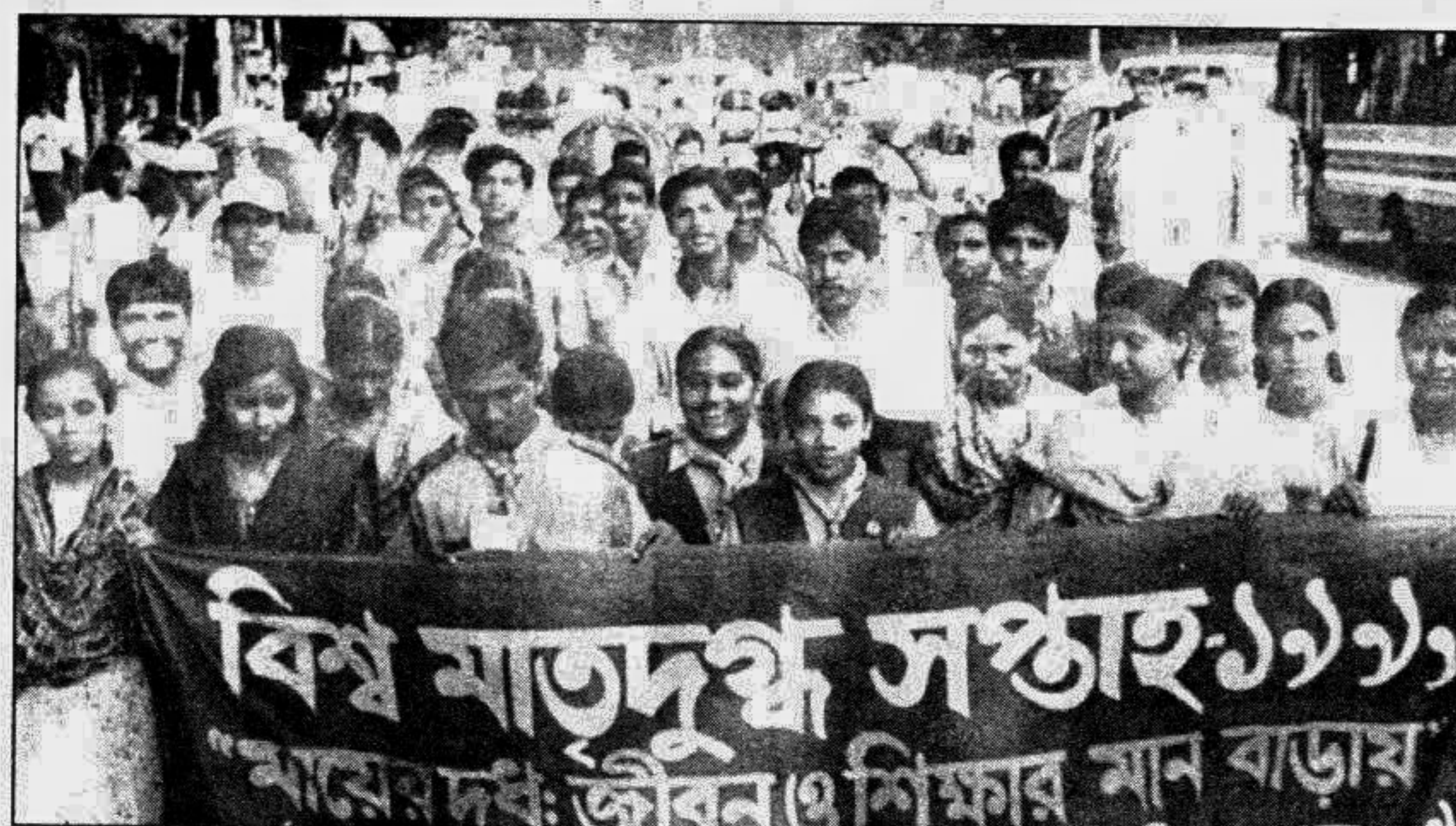
A colourful rally was brought out in the city yesterday to mark the beginning of World Breastfeeding Week 1999.

Earlier, Prof Amanullah led a colourful procession marking the week from Shahbagh to National Press Club in the morning.