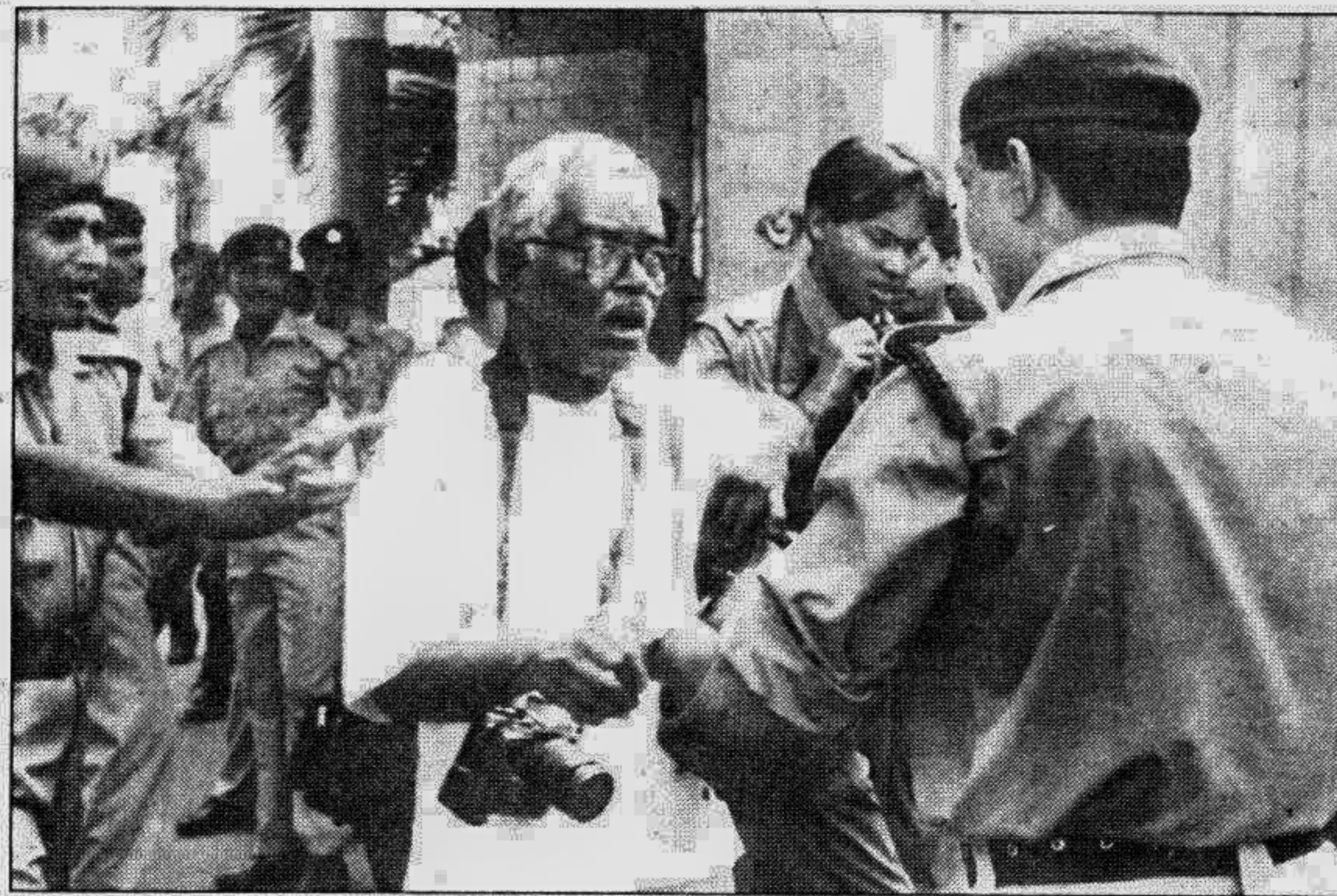
Photojournalists were barred from entering the Secretariat for professional work yesterday and harassed by the on-duty policemen deployed to control the tense situation in the area.

PATUAHALI, Aug 1: A man was stabbed to death by an identified gang of miscreants at village Idrakpur in sadra thana early Saturday, reports UNB.