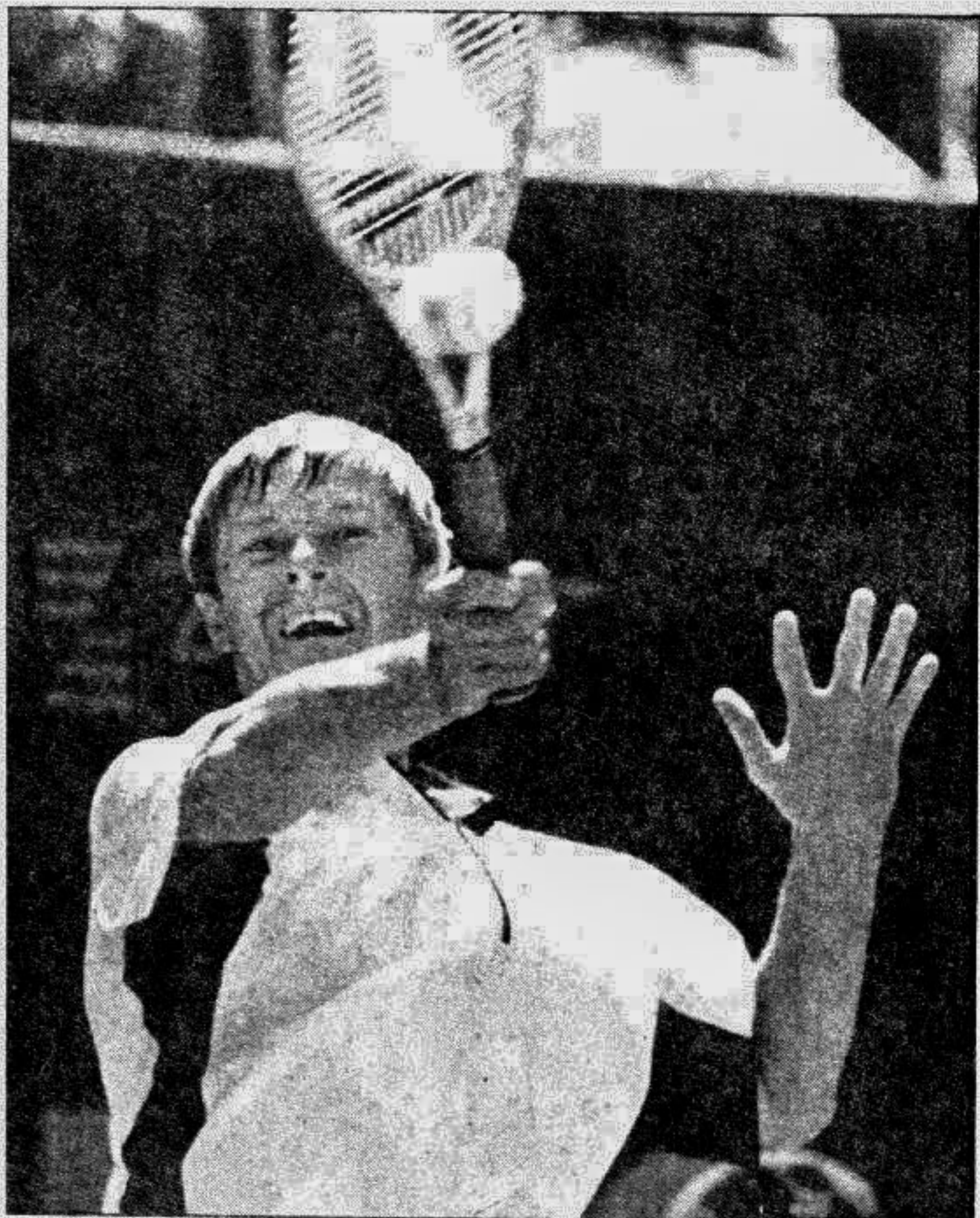
Russian Yevgeny Kafelnikov hits a forehand return during his quarterfinal against Australia's Richard Fromberg at the Generali Open on July 30.