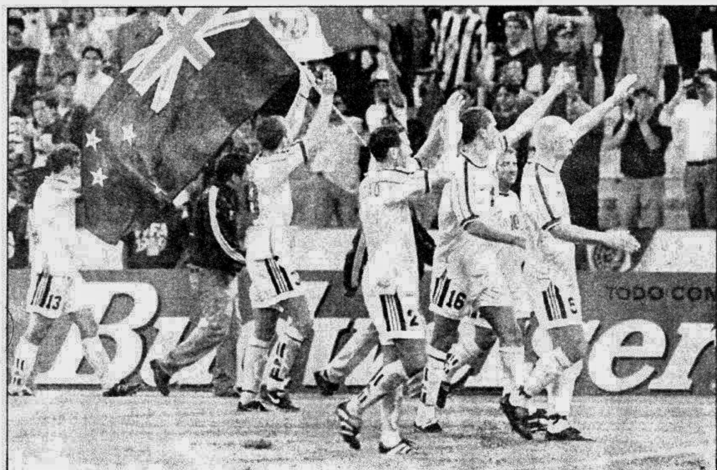
BEING BRAZILIAN! New Zealand players wearing the famous yellow shirts go on an 'unofficial' lap of honour after losing 2-0 to their mighty opponents in the Confederations Cup.