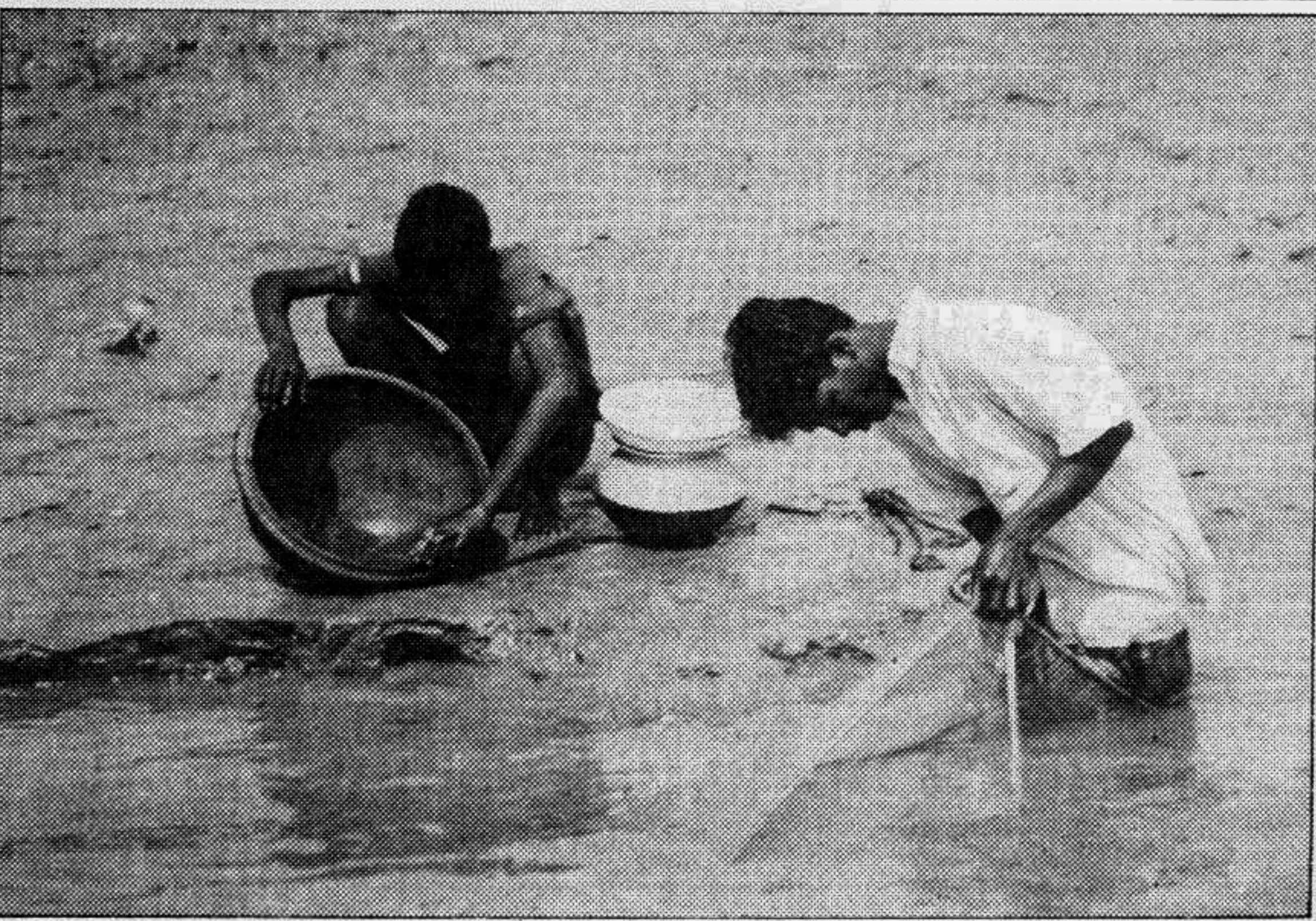
Two Bagda fry catchers at Hatia.

Series of clashes took place in and around Agrabad Commerce College between the two factions on Thursday leaving about 20 people injured, police and witnesses said.