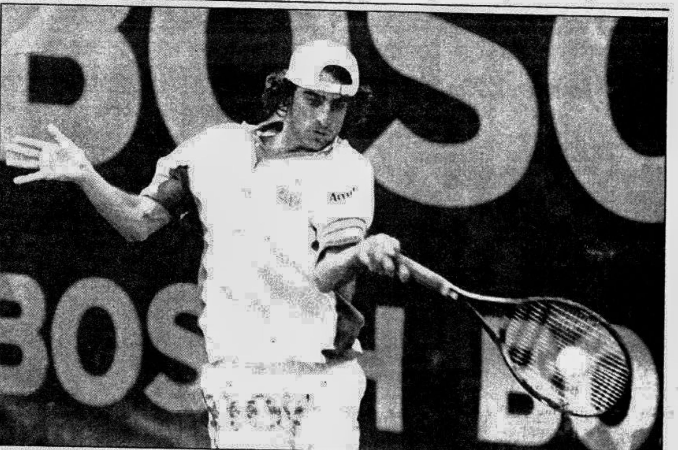
Brazilian Fernando Meligeni makes a forehand return against Ukrainian Andrei Medvedev at the Generali Open on July 29.

Arsenal play host to Leicester City on Saturday.