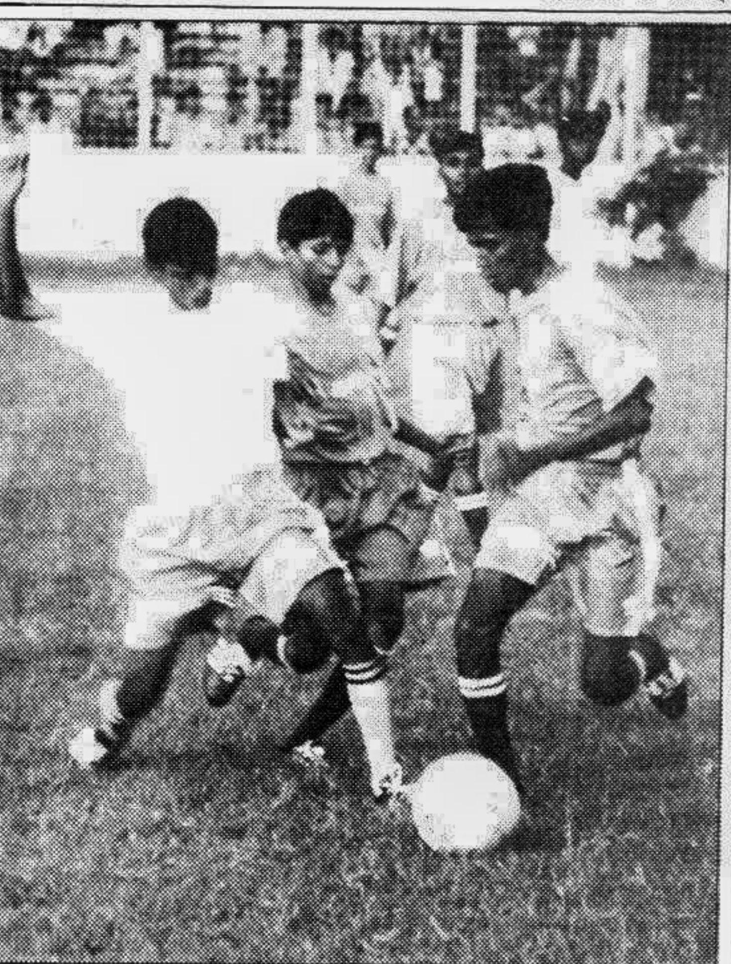
STREET BOYS NO MORE: Street boys showcase their football talent at the Bangabandhu National Stadium yesterday.

Farju netted 3 and Mithun 2 goals for the winners while Sumi scored 2 for the losers.