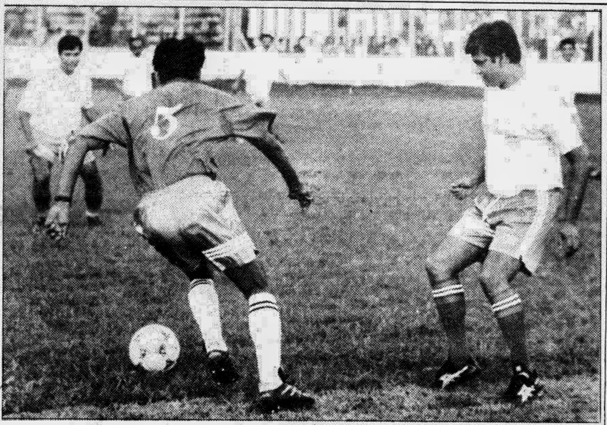
Action from the exhibition match between Obermann XI and Patzke XI at the Bangabandhu National Stadium yesterday.