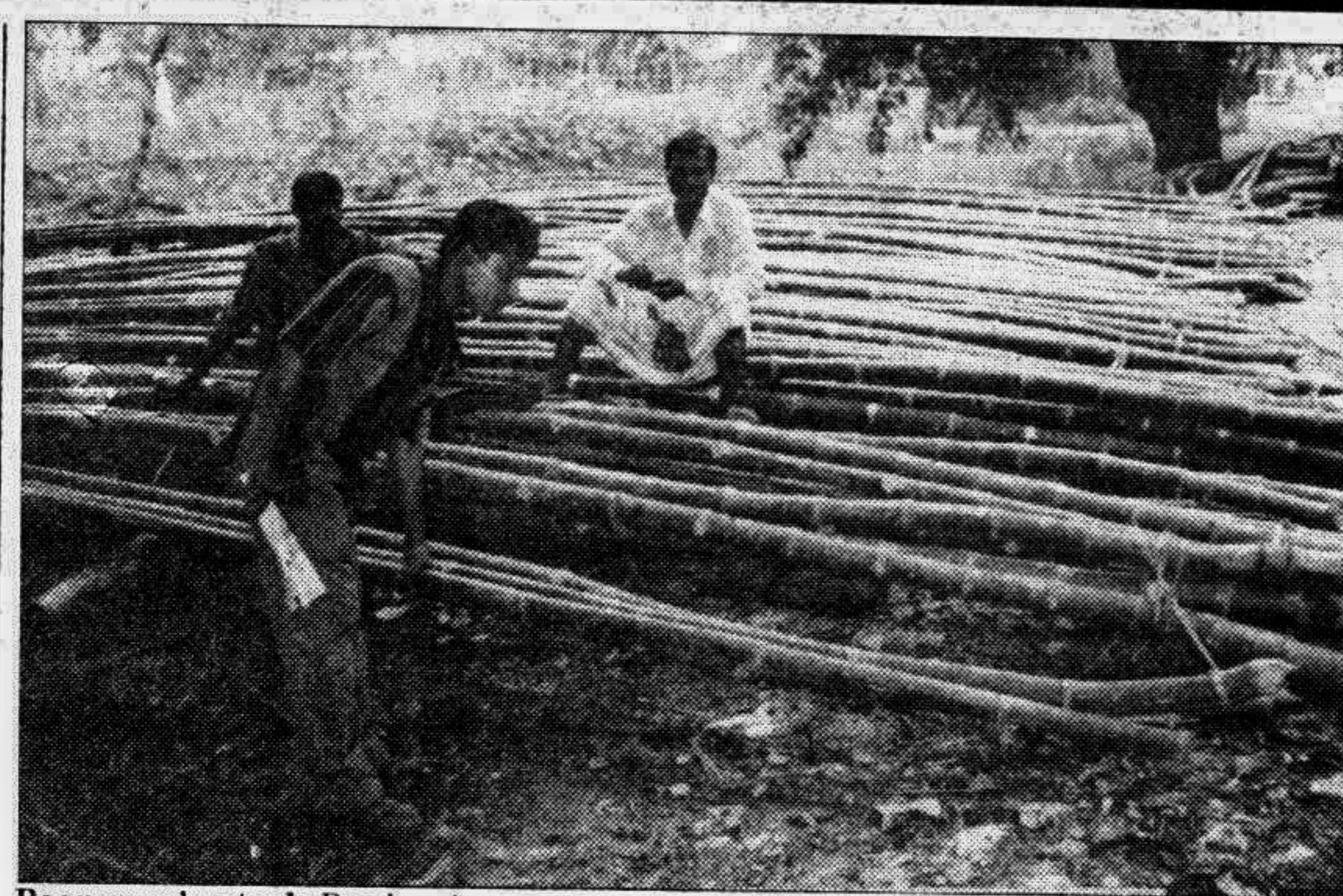
Poor man's steel: Bamboo is a common house building material for most villagers in Bangladesh and a powerful storm and flood buffer. But prices of the reed have recently shot up in the hats and bazaars of Magura.