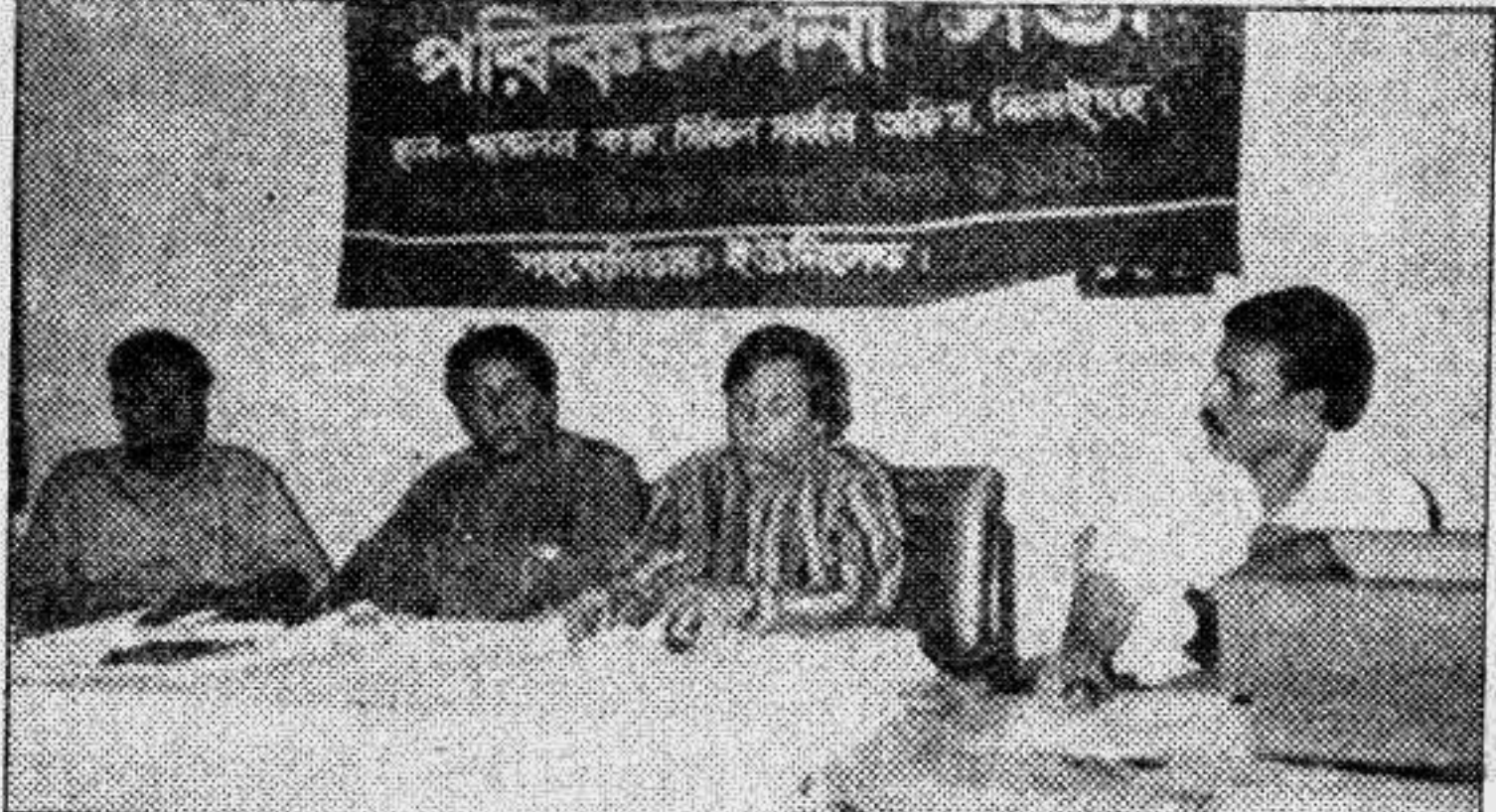
A planning meeting on Oral Rehydration Therapy (ORT) training in Maheshpur thana was held at Jhenidah civil surgeon's conference room recently.