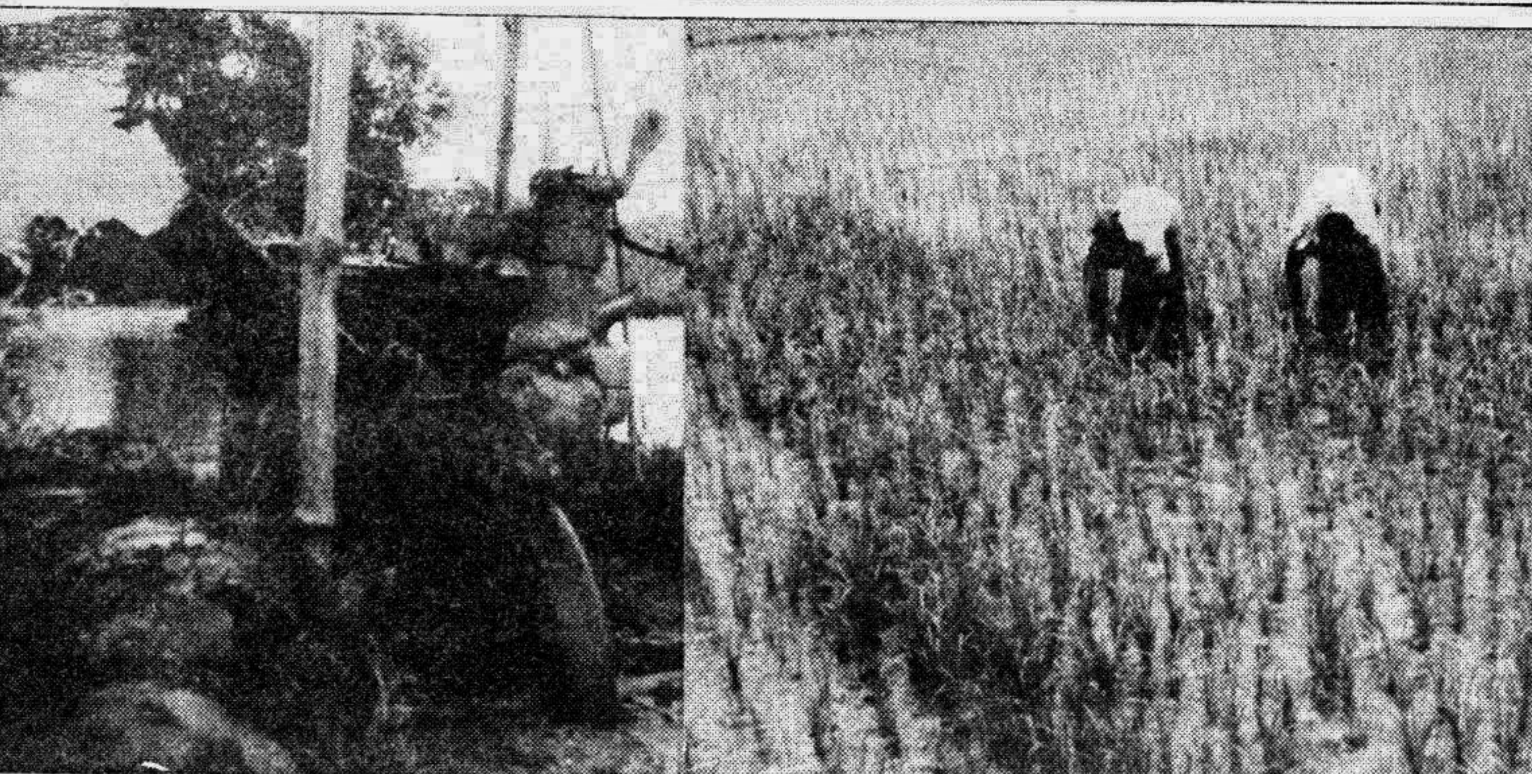
Will their hopes be realised?: Following bumper production of IRR-Boro paddy the farmers of Jhenidah are encouraged to cultivate Aus paddy this season. Shampur farmers of Sailakupa thana irrigating water through shallow machines (left) and cleaning weeds (right) hoping for another good harvest.

A section of meat traders in the rural areas defying government order to observe meatless day also slaughter a good number of farm animals causing shortage of bullocks.