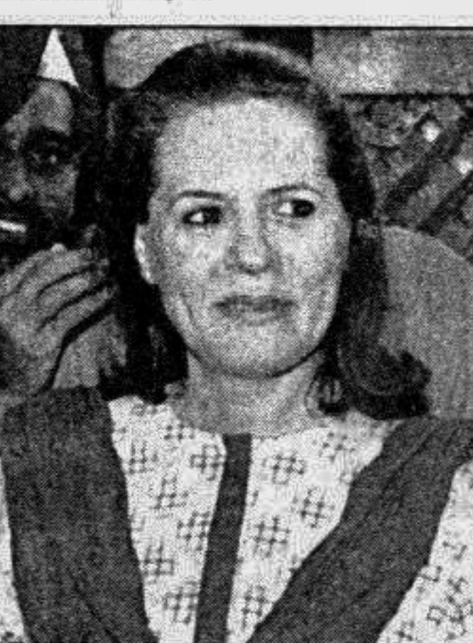
argument that her presence in the politically key state which elects highest number (85) of members to Lok Sabha, will give a big boost to the party's prospects.

PARTICIPATE IN THIS UNIQUE SEMINAR AND HELP PREPARE BANGLADESH FOR THE 21ST CENTURY