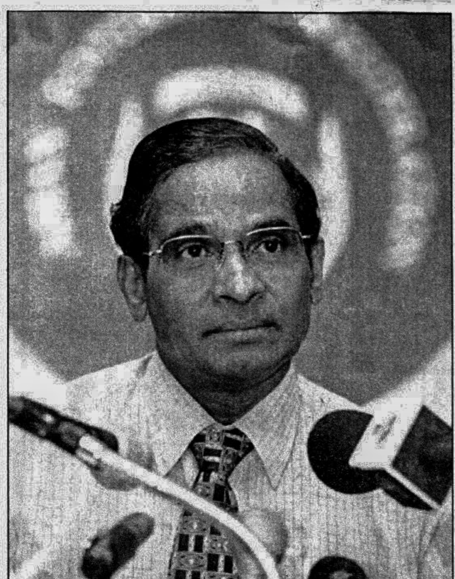
Asian Football Confederation general secretary Peter Velappan listens to a query during a press conference in Kuala Lumpur yesterday. The AFC official announced that Asia could still boycott the 2002 World Cup if the row over berth allocation was not resolved.

Brazil claimed the second semifinal in 38.67 seconds with the United States second in 38.93.