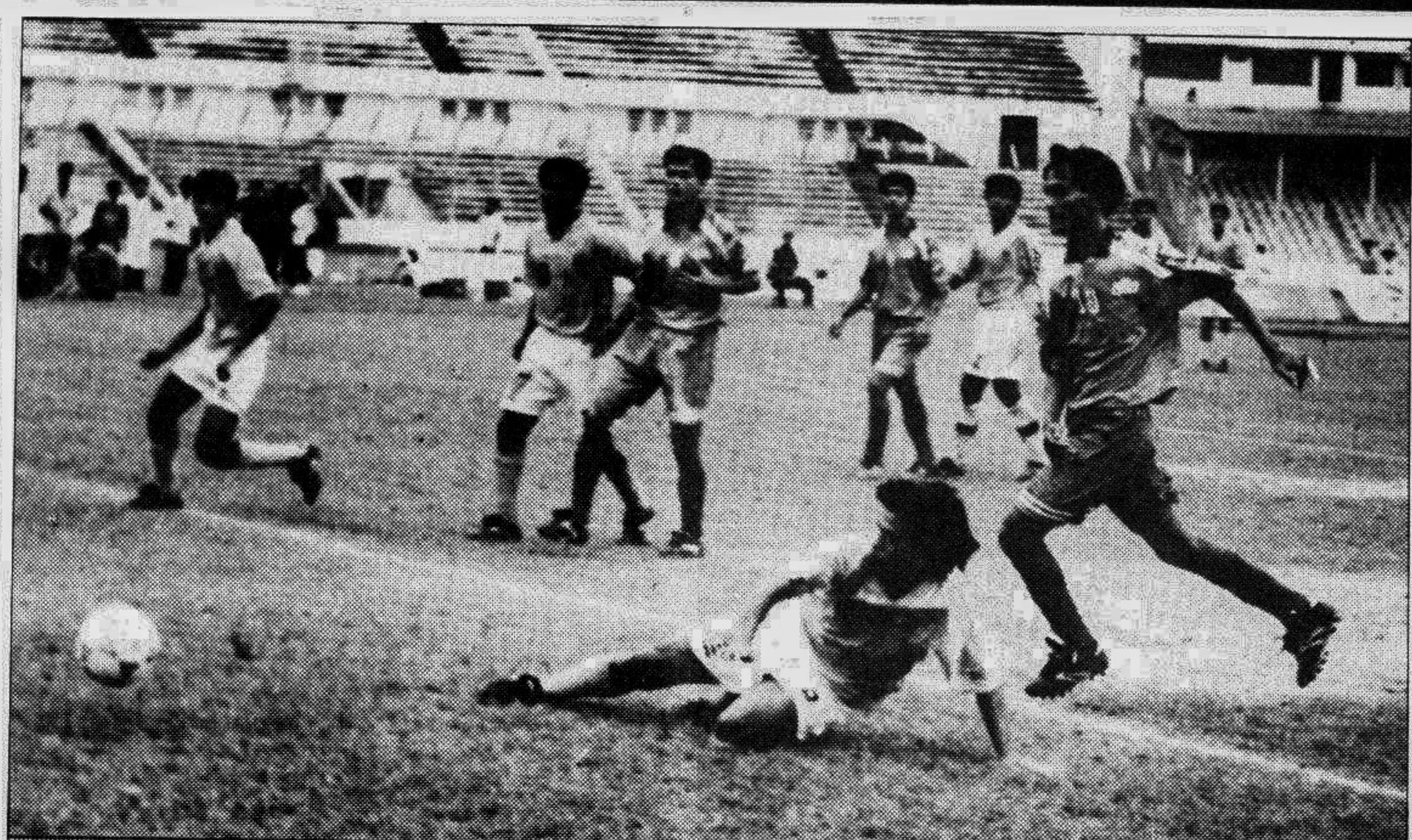
Action from yesterday's Premier Division football encounter between Fakirerpool and Rahmatganj.

The meeting discussed different aspects of Bangladesh's preparations and participation in the Games.