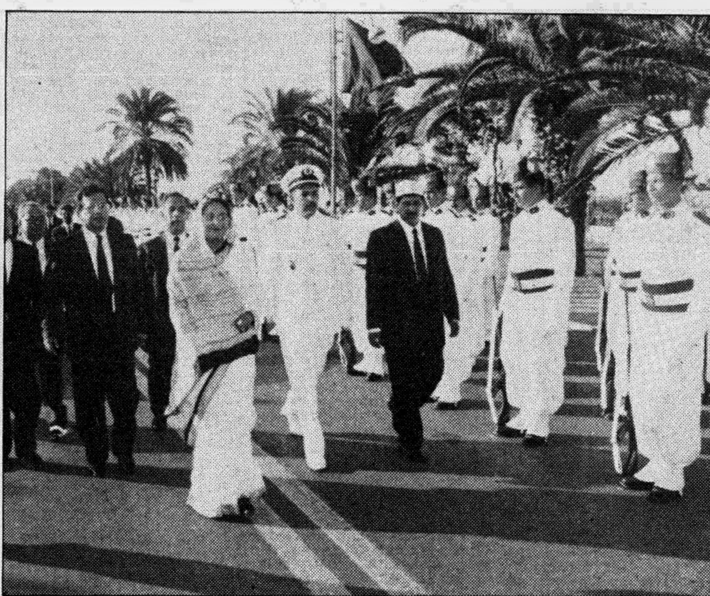
Prime Minister Sheikh Hasina and her entourage march in the funeral procession of the late King Hassan at Rabat on Sunday.