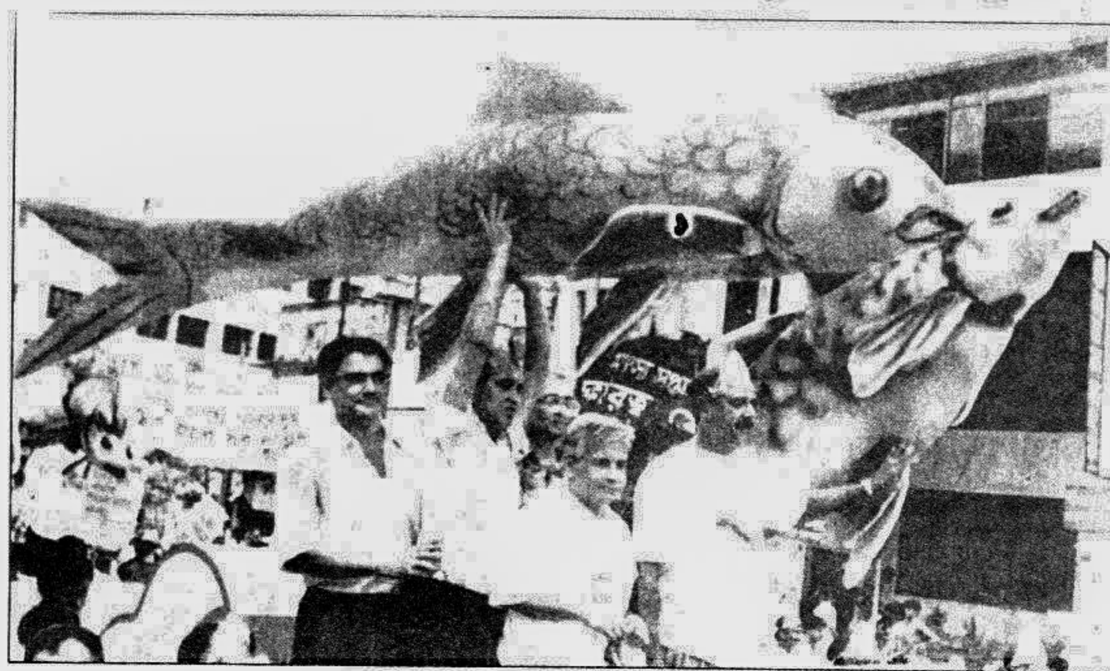
A colourful procession was brought out in the city yesterday marking the inauguration of the Fisheries Week '99. Minister for Fisheries ASM Abdur Rob led the march.

The agencies — Police, BDR and Ansars — in their 94th day of the joint operation known as 'combining operation' recovered 11 illegal fire arms, seven rounds of bullet and four explosives from them, the sources added.