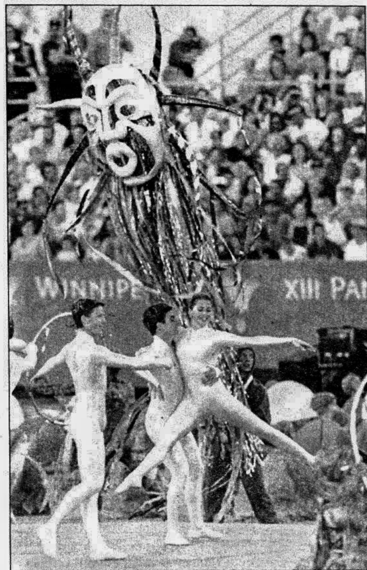
Scene from the colourful opening ceremony of the Pan Am Games in Winnipeg, Canada on July 23.

Donovan Bailey, whom organisers paid almost $200,000 to promote the games, will be here, but the Canadian, who lost his 100 metres world record to Greene last month, will compete only in the 4x100-metre relay.