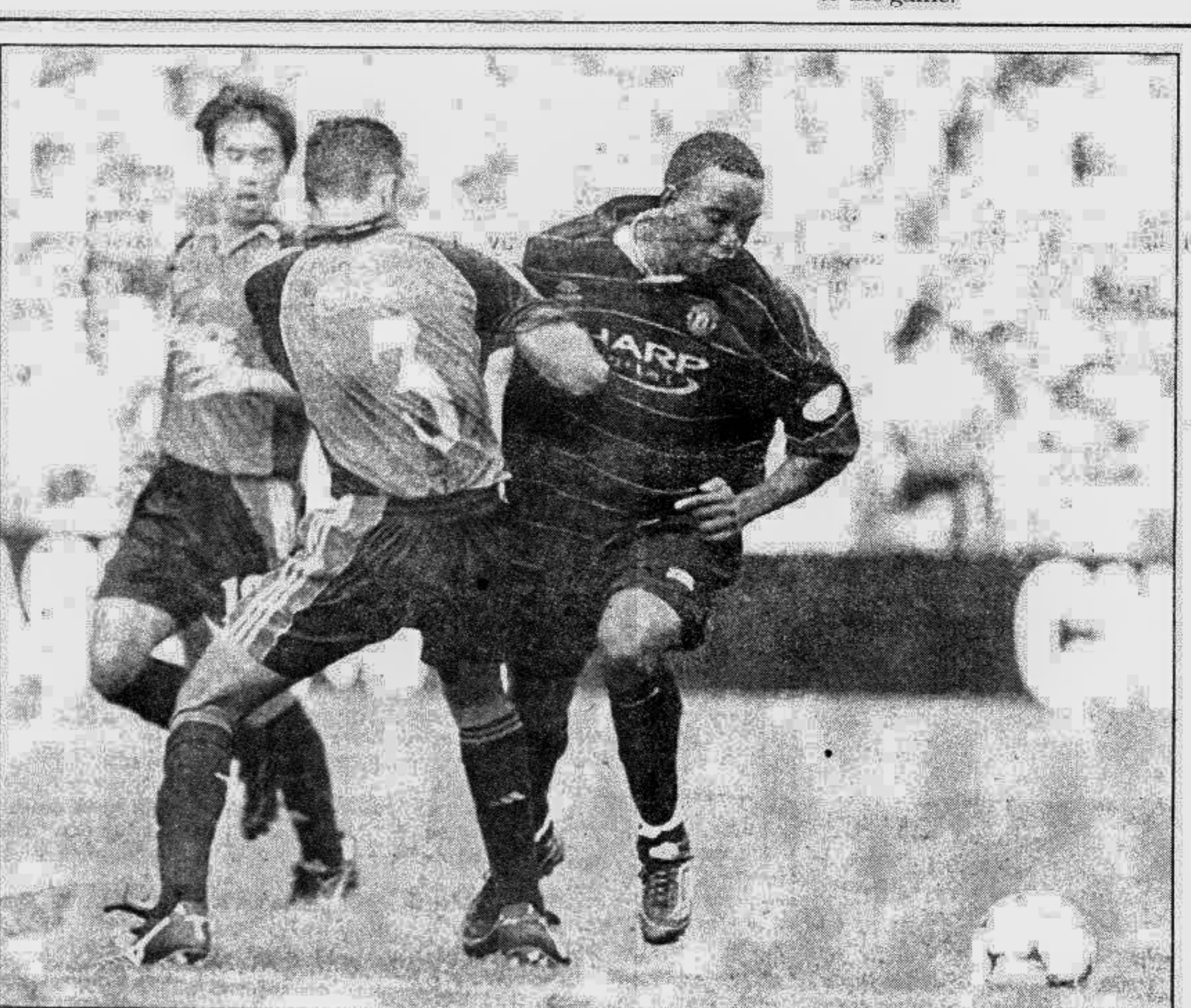
Manchester United forward Dwight Yorke (R) is under pressure from a South China defender during their exhibition soccer match in Hong Kong on July 23.