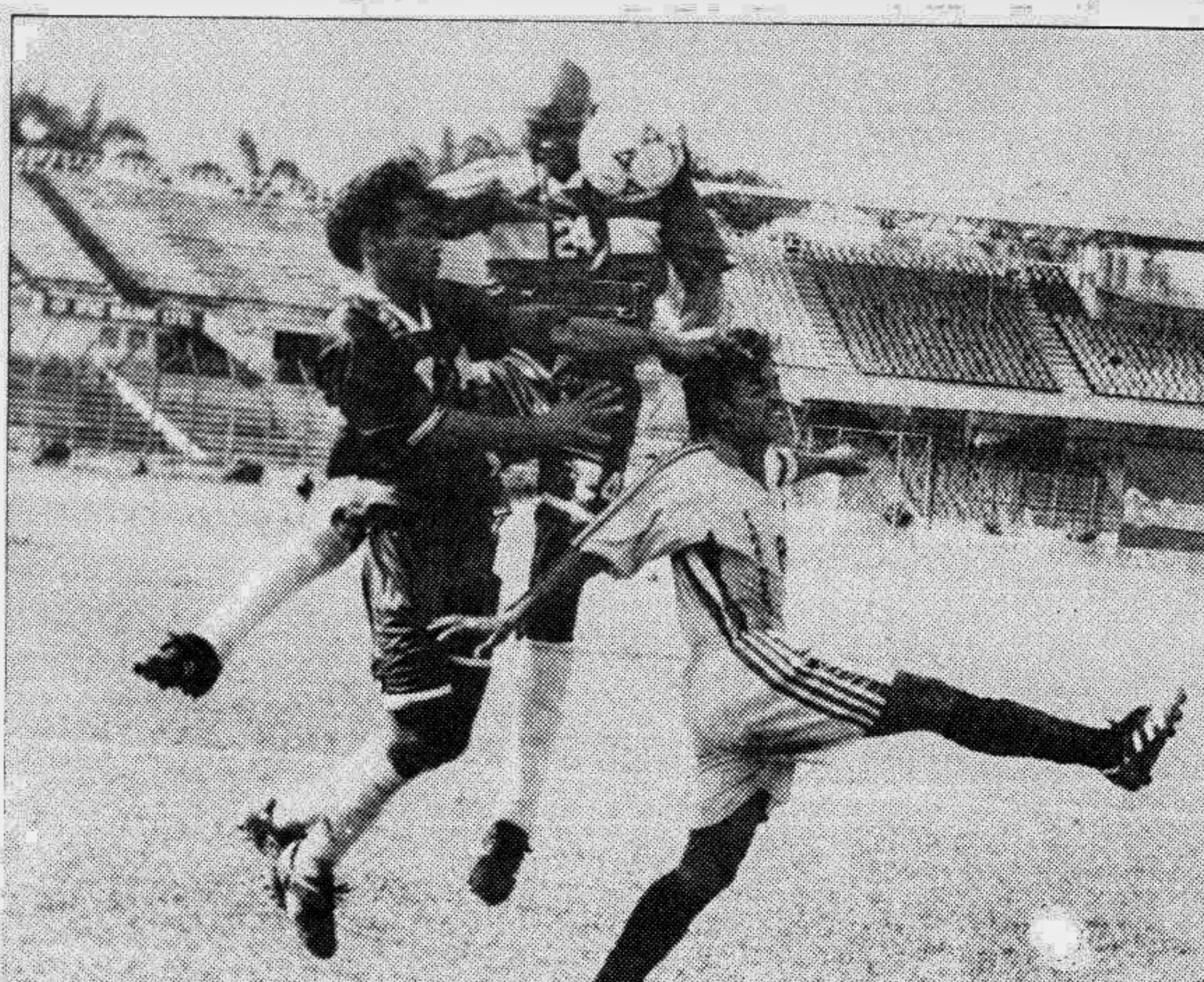
Players of Badda Jagarani and Farashganj Sporting Club battle for the ball during their Premier Division football league match yesterday.