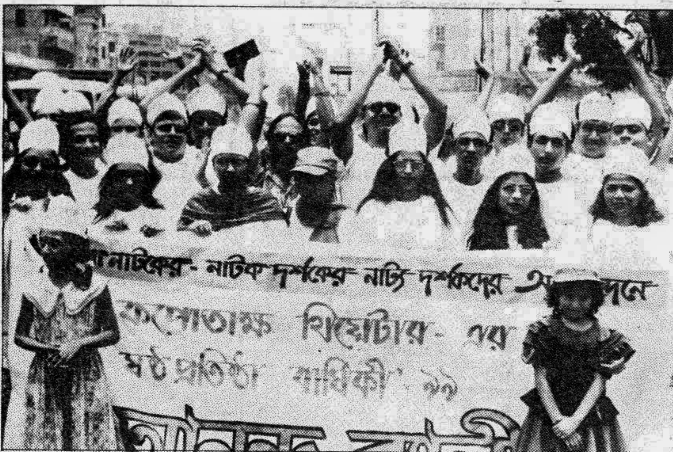
Members of the Kabotakkah Theatre brought out a colourful procession in the city yesterday marking its 6th founding anniversary.

They alleged that anti-liberation elements in the administration were out to destroy the pro-liberation forces.