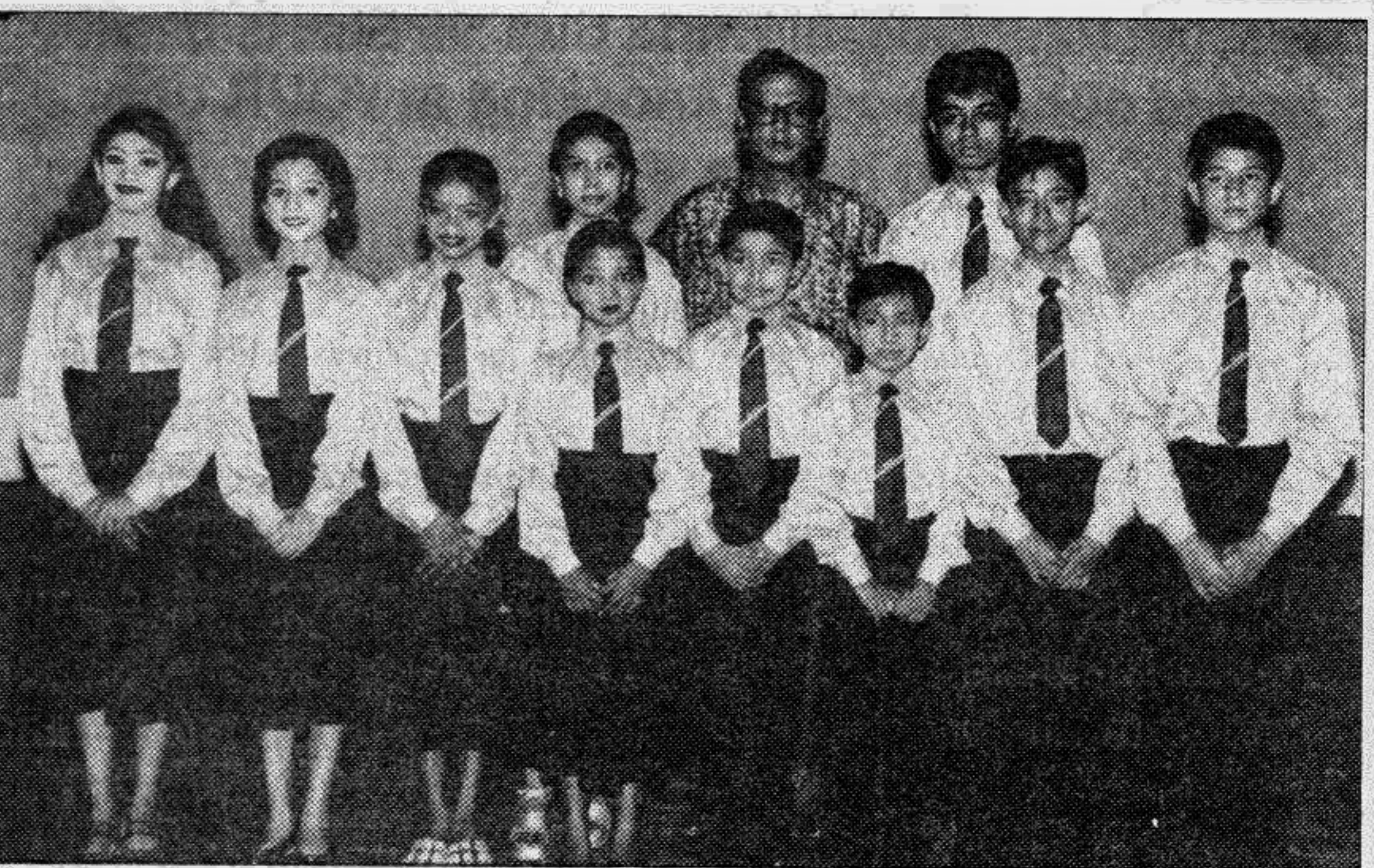
An 11-member children delegation left for Japan yesterday to take part in the Asia-Pacific children's conference.